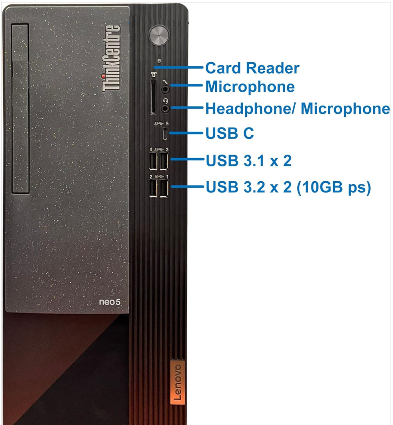
Image Description: A close-up view of the Lenovo ThinkCentre Neo 50T Gen4 Tower's front panel, highlighting its various ports. From top to bottom, these include a Card Reader, Microphone jack, Headphone/Microphone combo jack, USB-C port, two USB 3.1 ports, and two USB 3.2 (10 Gbps) ports.