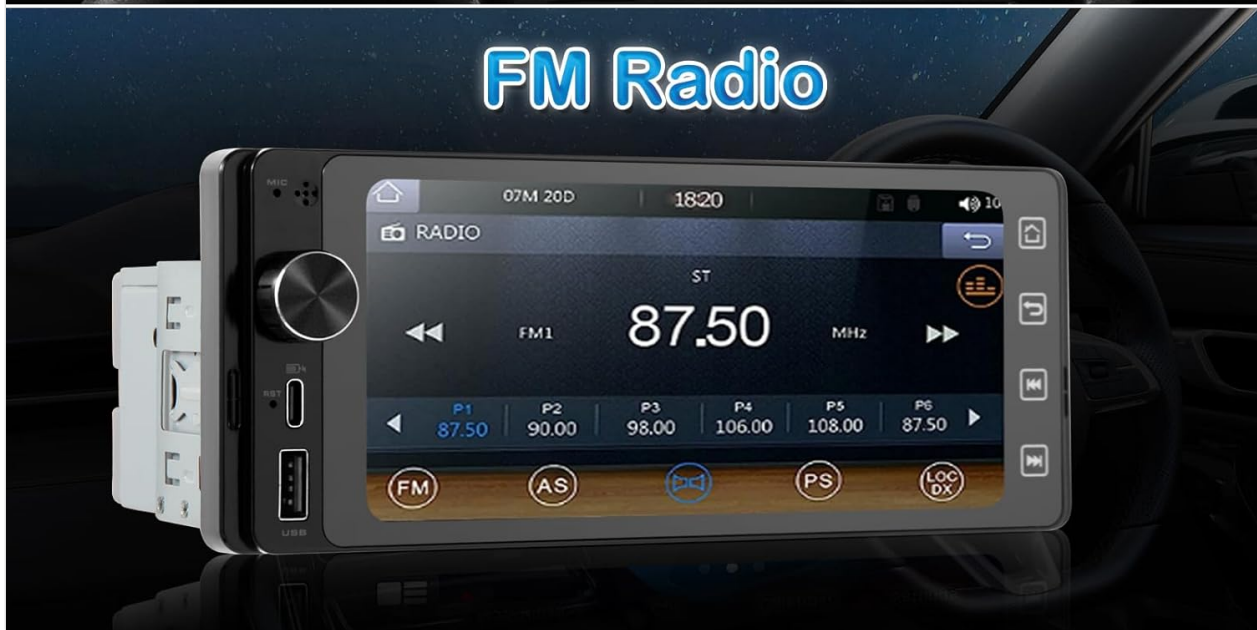
Image: Steering Wheel Control and FM Radio interface.