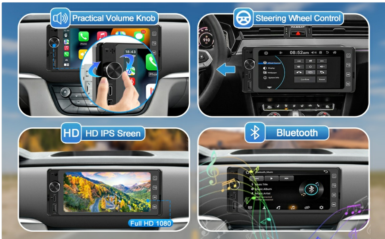
Image: Practical volume knob, Steering Wheel Control, HD IPS Sreen, and Bluetooth features.