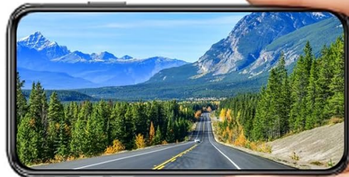
Image: Mirror Link functionality supporting Android phones and iPhones.