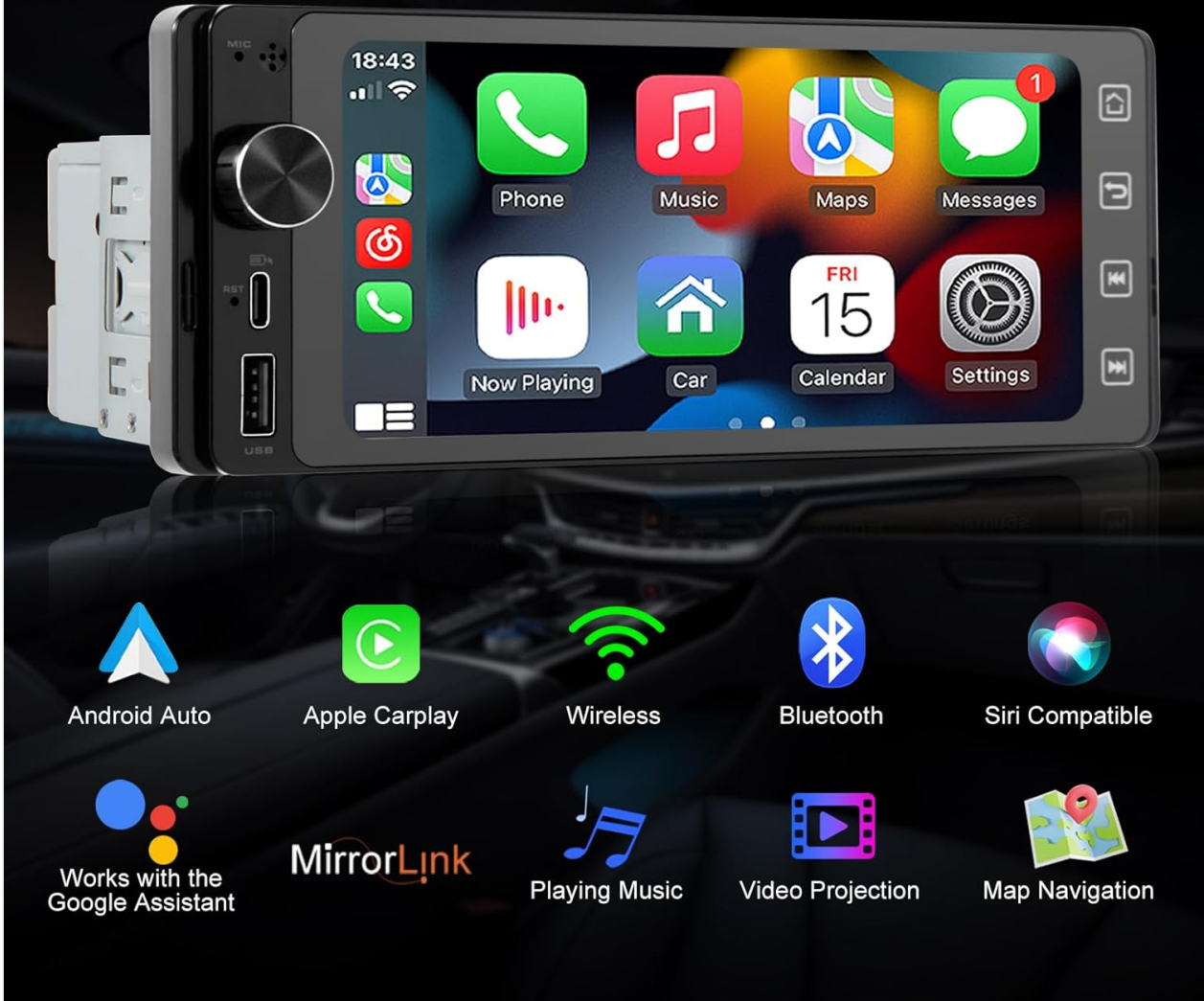
Image: Wireless and Wired Android Auto features.