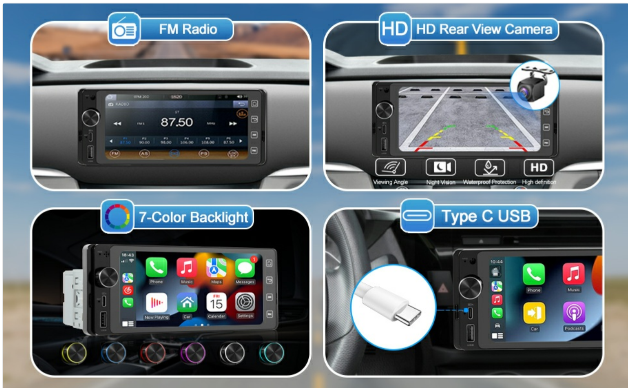
Image: FM Radio, HD Rear View Camera, 7-Color Backlight, and Type C USB features.