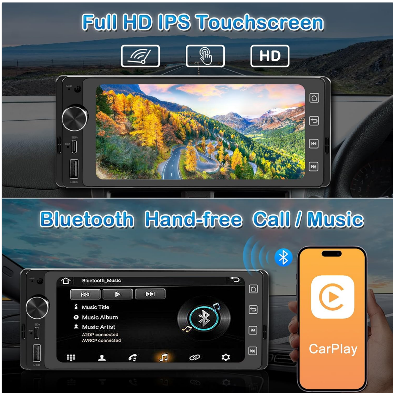
Image: Full HD IPS Touchscreen and Bluetooth Hands-free Call/Music.