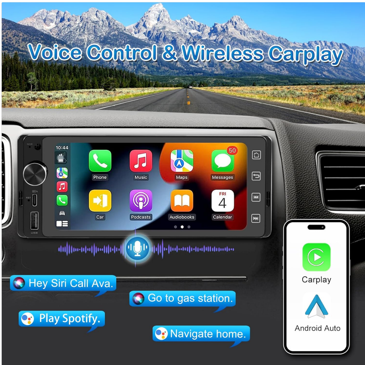
Image: Voice Control and Wireless CarPlay functionality.