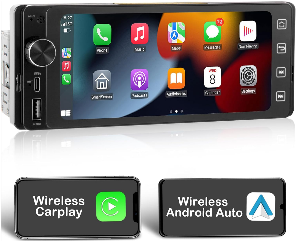
Image: LIMINGDE Single Din Touchscreen Car Stereo with CarPlay and Android Auto features.