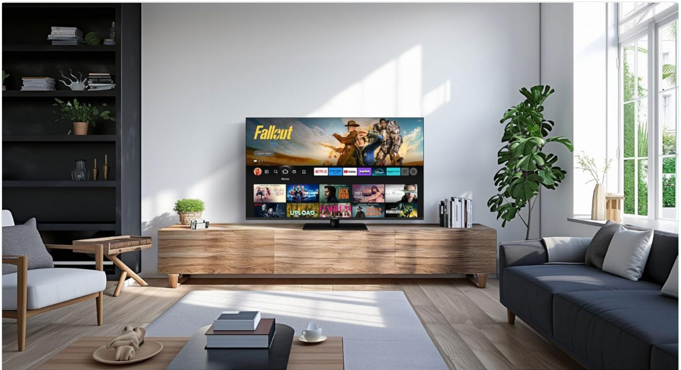
Panasonic W80 Series 4K LED Smart TV displayed in a modern living room setting, mounted on a wooden media console.

Your television can be placed on a stand or mounted on a wall. Ensure the TV is placed on a stable, level surface or securely mounted using a VESA-compatible wall mount (400 x 200 mm).