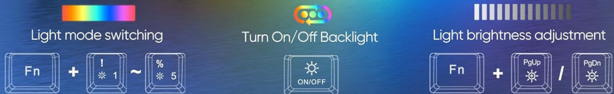
Image: The RedThunder K20 TKL keyboard displaying various RGB backlight effects and the key combinations for adjustment.

Your browser does not support the video tag.