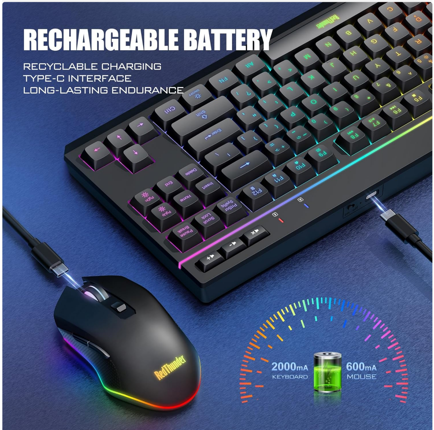
Image: The RedThunder K20 TKL keyboard and mouse connected for charging, illustrating their rechargeable battery feature.