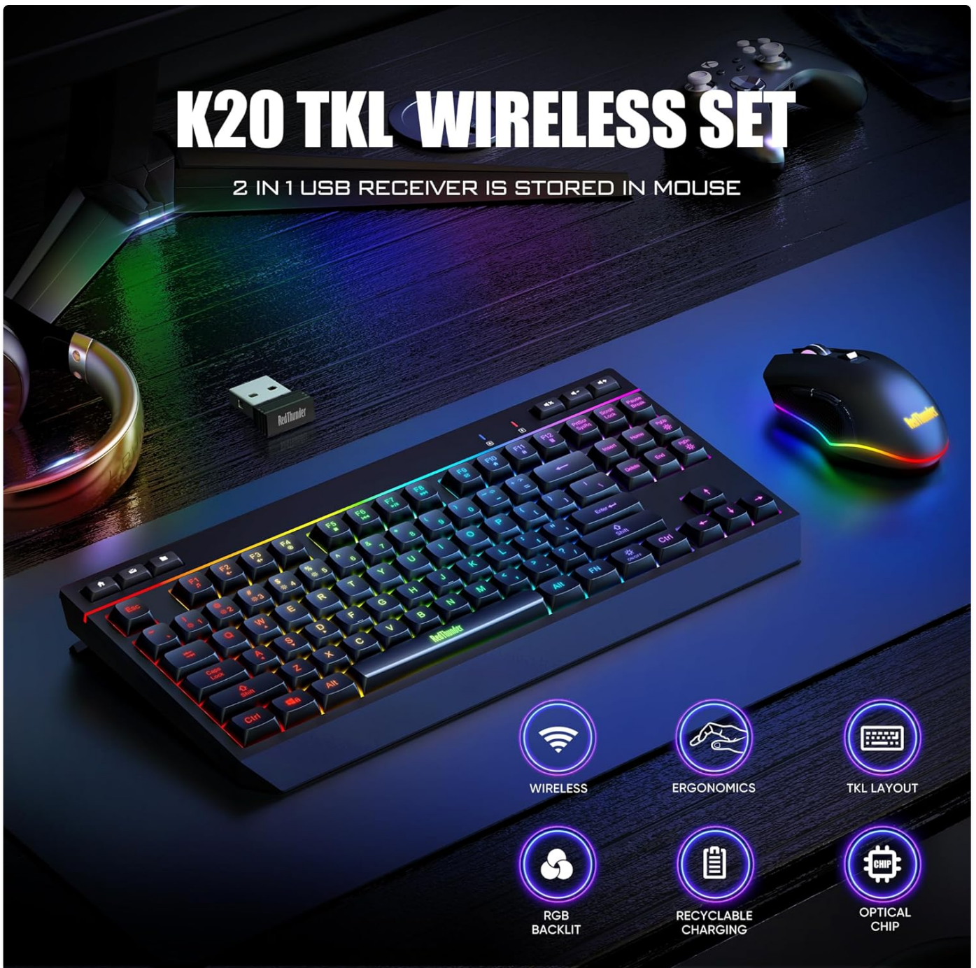
Image: The RedThunder K20 TKL Wireless Keyboard and Mouse Combo, highlighting the compact TKL layout and the USB receiver.