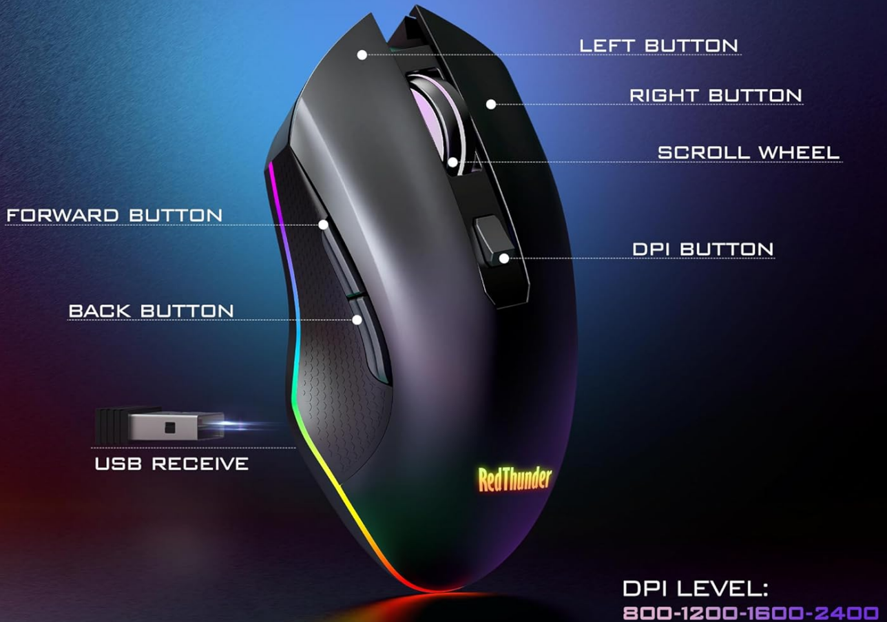
Image: Detailed view of the RedThunder optical gaming mouse, indicating the left/right buttons, scroll wheel, DPI button, forward/back buttons, and USB receiver storage.

ADJUSTABLE RGB RECYCLABLE CHARGING CHARGING IN WIRED MODE