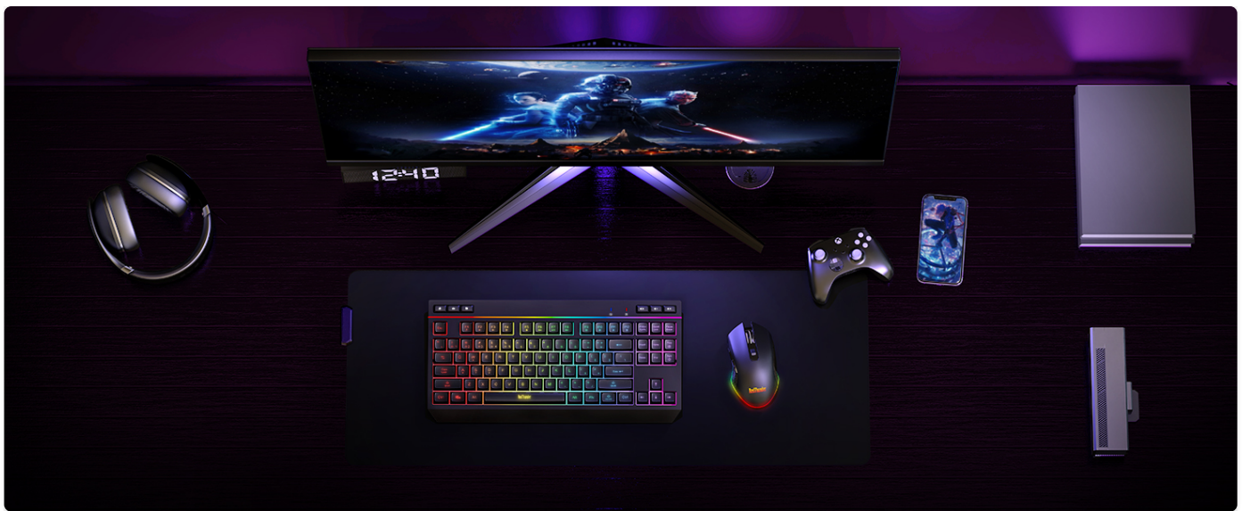
Image: Illustration of the stable 2.4G wireless connection between the keyboard, mouse, and a laptop via the USB receiver.