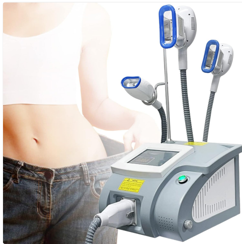
Figure 3.1: Main Cryolipolysis Machine with its three detachable handles.

The Cryolipolysis Fat Freezing Machine comes with a main unit and three different sized handles for versatile application on various body areas.