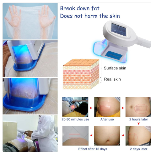
Figure 5.2: Visual representation of the device application and how it targets the fat layer beneath the surface skin without harming it. Includes examples of before and after effects over time.