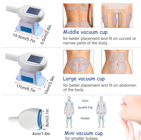
Figure 3.3: Overview of the three handle sizes: Middle (14.5cm/5.7in x 5.5cm/2.6in) for curved/narrow parts, Large (17cm/6.7in x 10cm/3.9in) for abdomen, and Mini (8cm/3.1in x 4cm/1.6in) for smaller bulges like chin, armpit