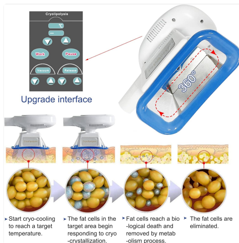
Figure 3.2: Illustration of the upgraded control interface and the 360° cryolipolysis mechanism within the handle.