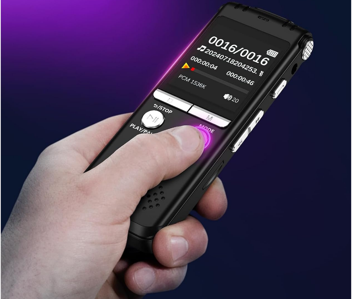
Image: A hand demonstrating the one-click operation of the voice recorder, highlighting the REC button for easy recording initiation.