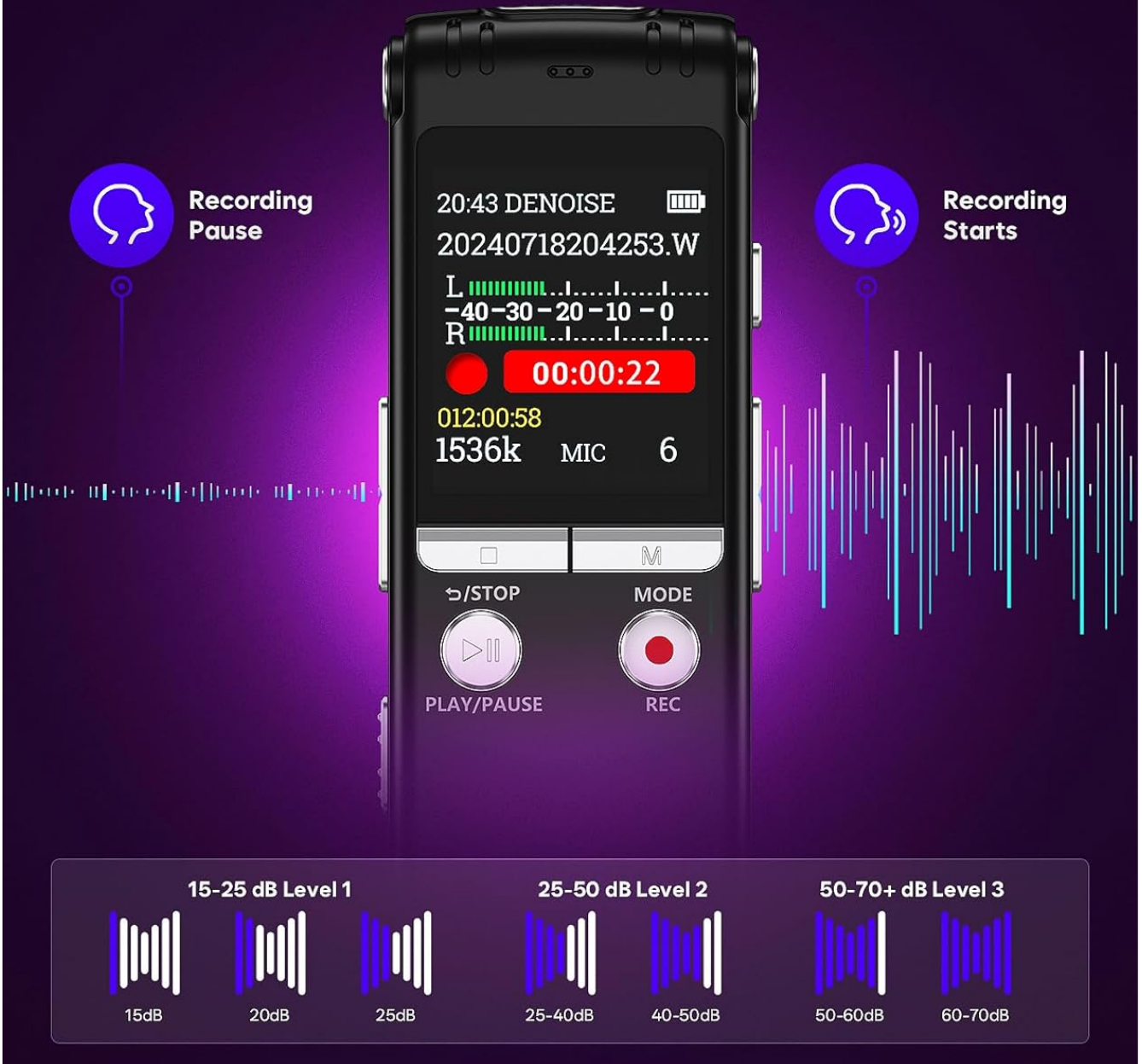
Image: Visual explanation of the voice-activated recording feature, showing how recording pauses and starts based on sound levels, with examples of 7 levels of voice sensitivity.

7 levels of voice sensitivity, skip invalid silences Saving time and space