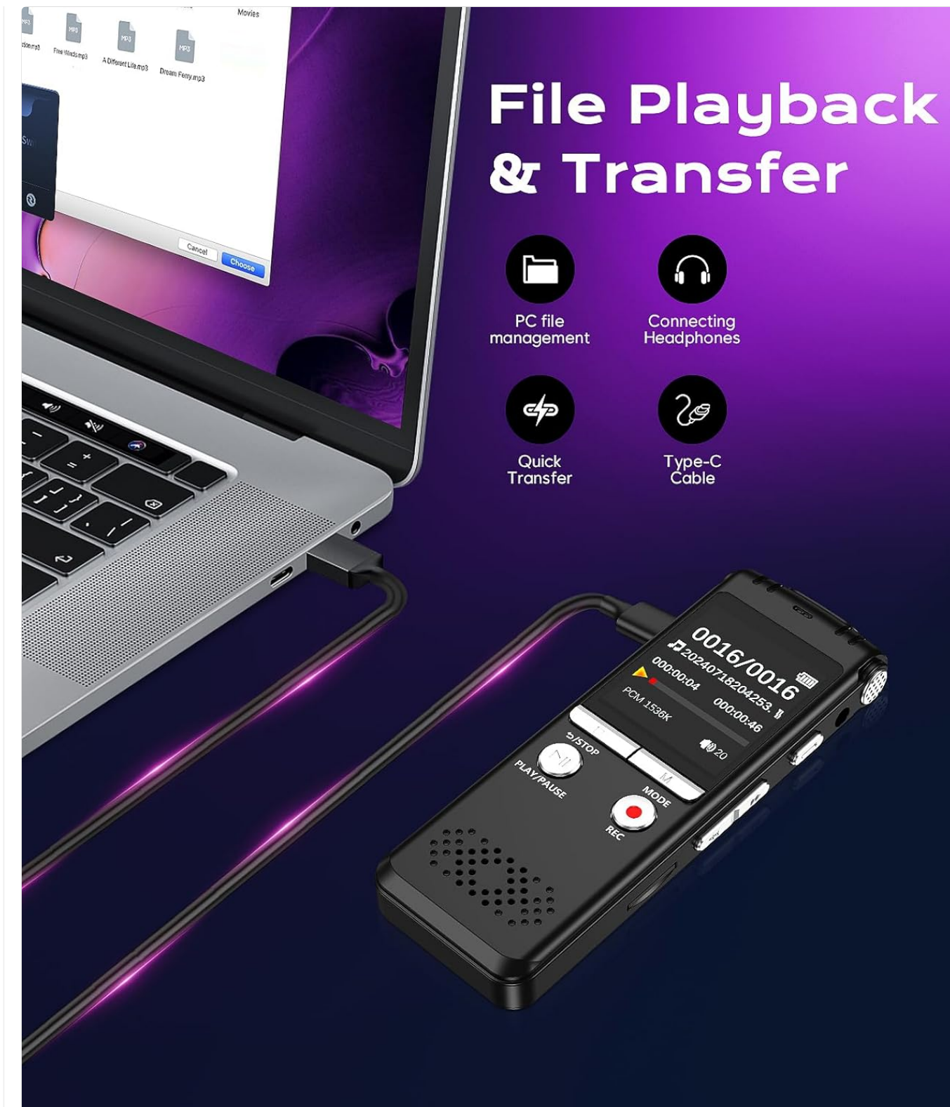
Image: The voice recorder connected to a laptop via USB-C cable, demonstrating PC file management, quick transfer, and the option to connect headphones for playback.