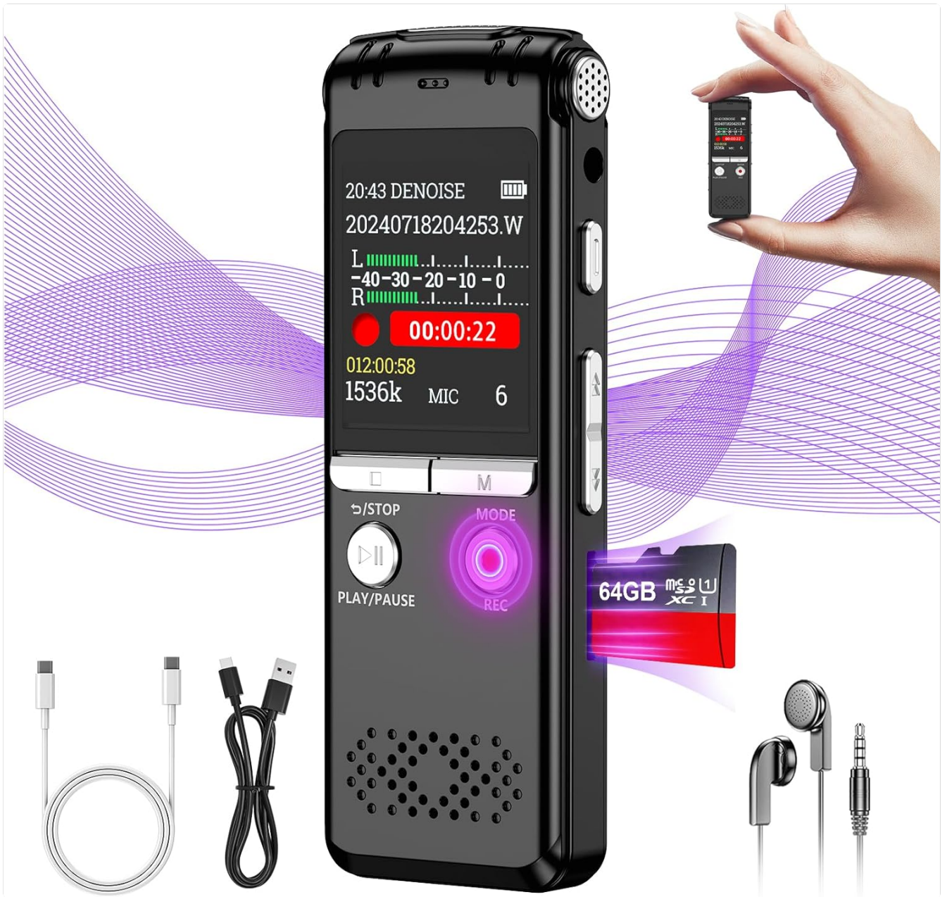
Image: The ZIPCIDe 64GB Digital Voice Recorder shown with its included accessories: USB-C charging cable and wired headphones.