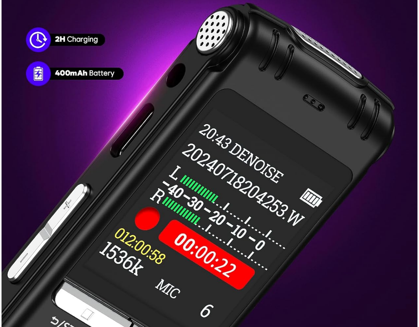
Image: The voice recorder highlighting its 40 hours of continuous recording, 2 hours charging time, and 400mAh battery capacity, along with the USB-C port for fast charging.