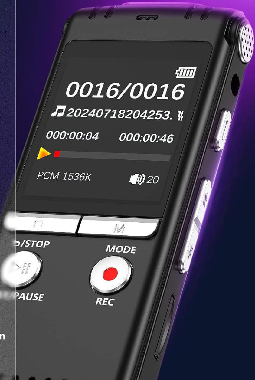
Image: Close-up view of the voice recorder's screen, illustrating its 64GB memory, 4608 hours recording time, 40 hours battery life, 1.44' TFT screen, Voice Activation Sensor, and AI intelligent noise reduction capabilities.