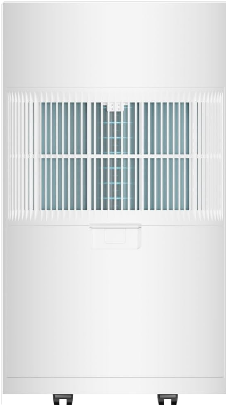
Figure 3: Rear view of the dehumidifier, indicating the location of the air intake and water tank access.