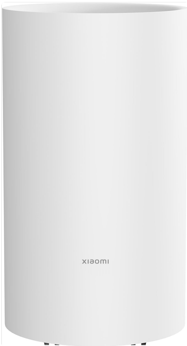
Figure 1: Front view of the dehumidifier, showcasing its sleek, minimalist design.