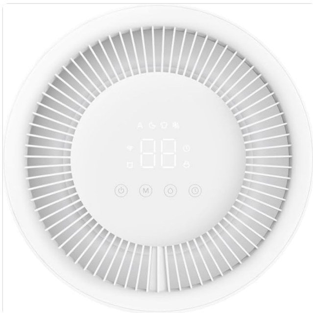
Figure 2: Top control panel with digital display and intuitive touch controls.