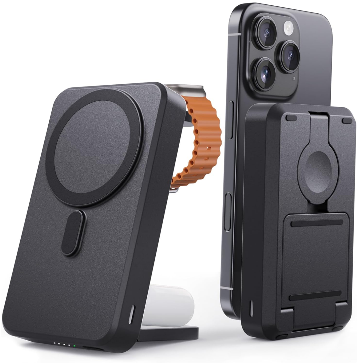
Image: The Kysson 3-in-1 Portable Charger in its compact, folded state, ready for travel.