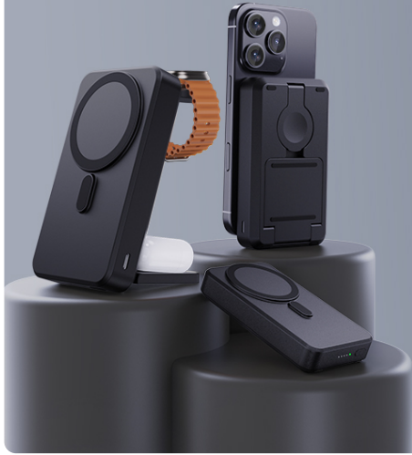
Image: The Kysson charger set up as a desktop charging station, demonstrating its multi-device charging capability.