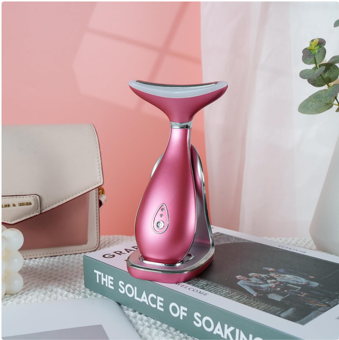
Image: The VRAIKO Lily device resting on its custom charging stand, ready for use.