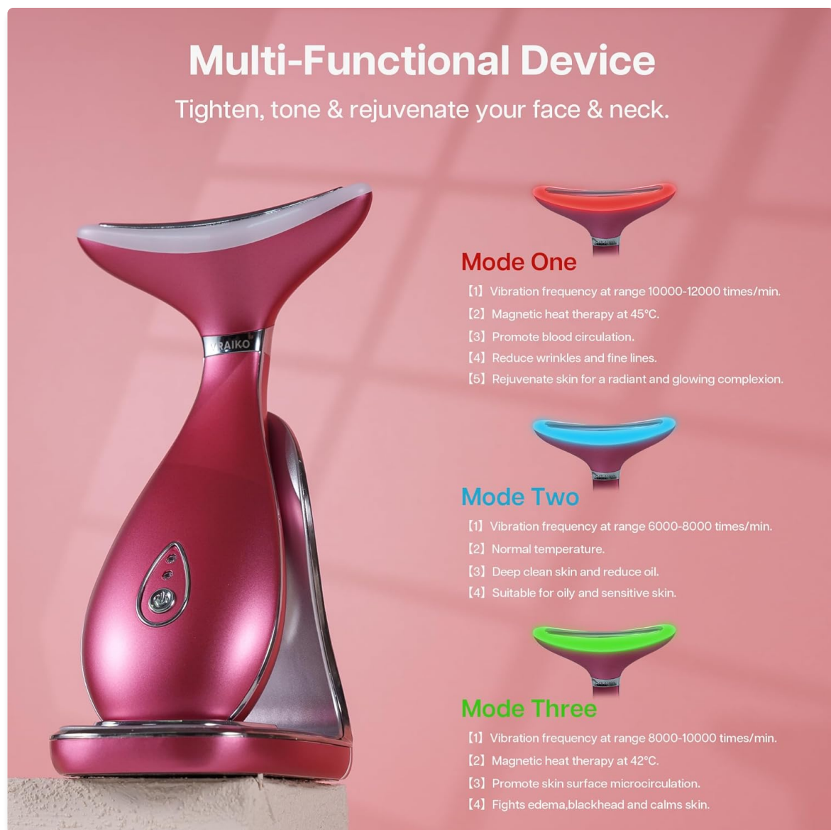
Image: Visual representation of the three modes (Red, Blue, Green) and their respective functions and benefits.