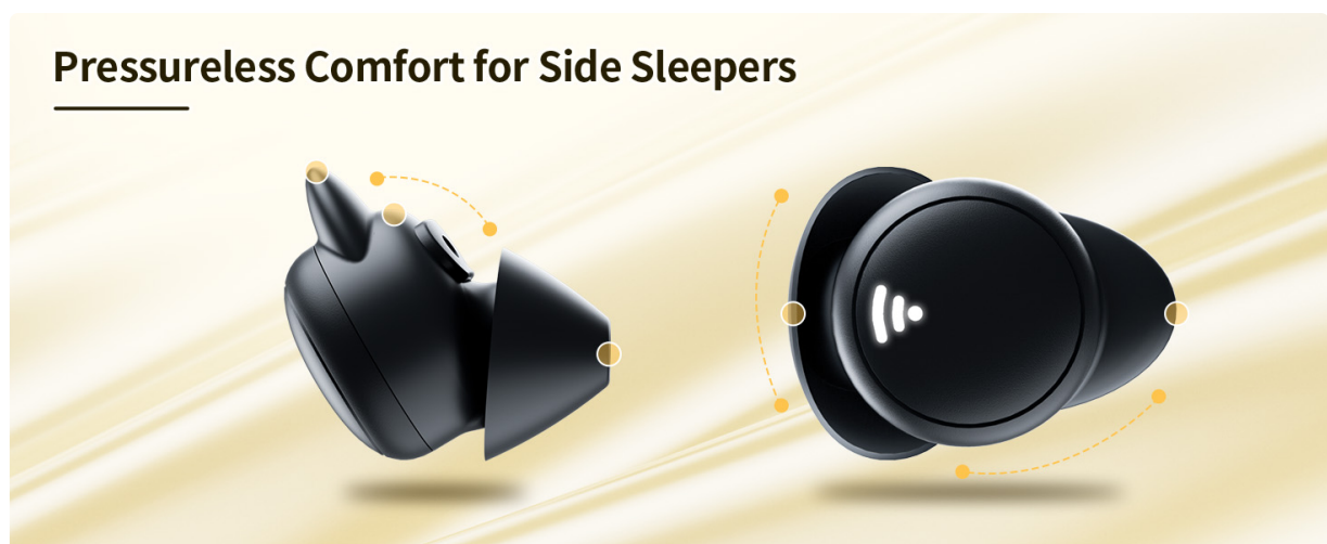
Image: Detailed view of the earbuds' ergonomic design, emphasizing comfort for side sleepers.

Your browser does not support the video tag.