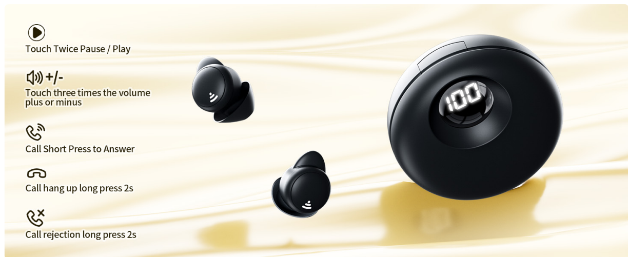
Image: Visual guide to the touch-sensitive controls on the earbuds.