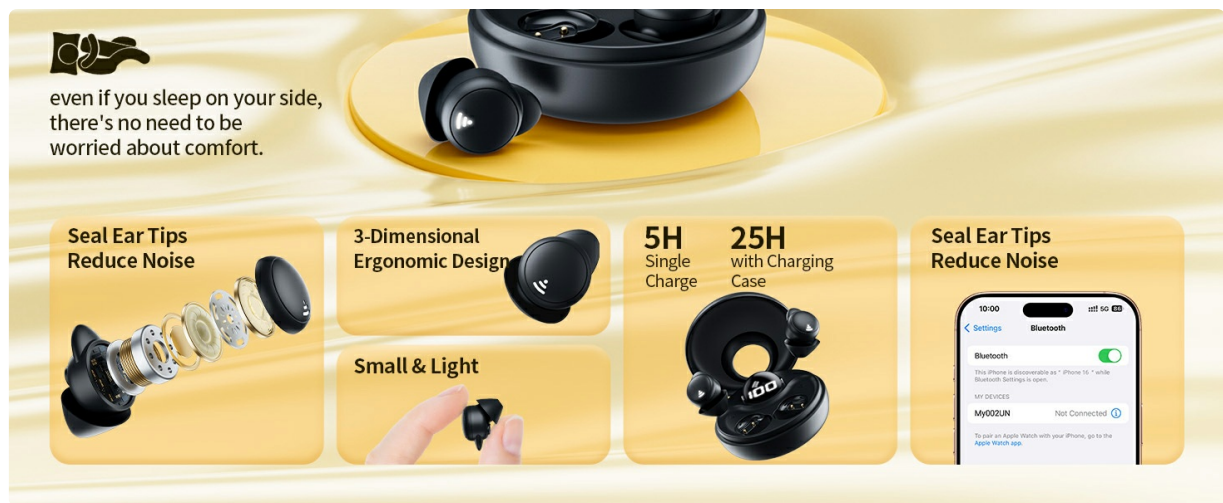
Image: Features of the earbuds, including a visual of the Bluetooth pairing process on a smartphone.

Your browser does not support the video tag.