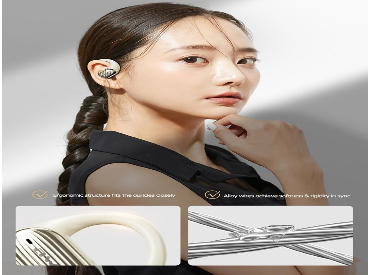
Image: A person wearing the AWEI T95 earbuds, demonstrating the secure over-ear fit. Insets show close-ups of the skin-friendly silicone earhooks and their alloy wire structure.

The ergonomic structure fits human auricles closely, alloy wires in the silicone achieve softness and rigidity synchronously