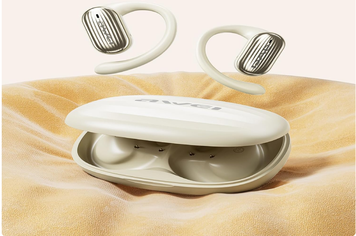
Image: AWEI T95 Wireless Earbuds and their charging case, displayed on a textured surface. The earbuds feature an over-ear hook design.

Heavy Bass / Bluetooth 5.3 / Snug to Wear