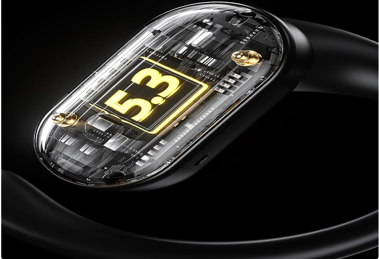
Image: A close-up view of the internal circuitry of an AWEI T95 earbud, with the text "Bluetooth 5.3" prominently displayed on a chip. Note: The product features Bluetooth 5.4 technology for enhanced connectivity.

Anti-electromagnetic interference, no jam or disconnection, high-speed transmission, lower power consumption which improve the e-sports experience greatly