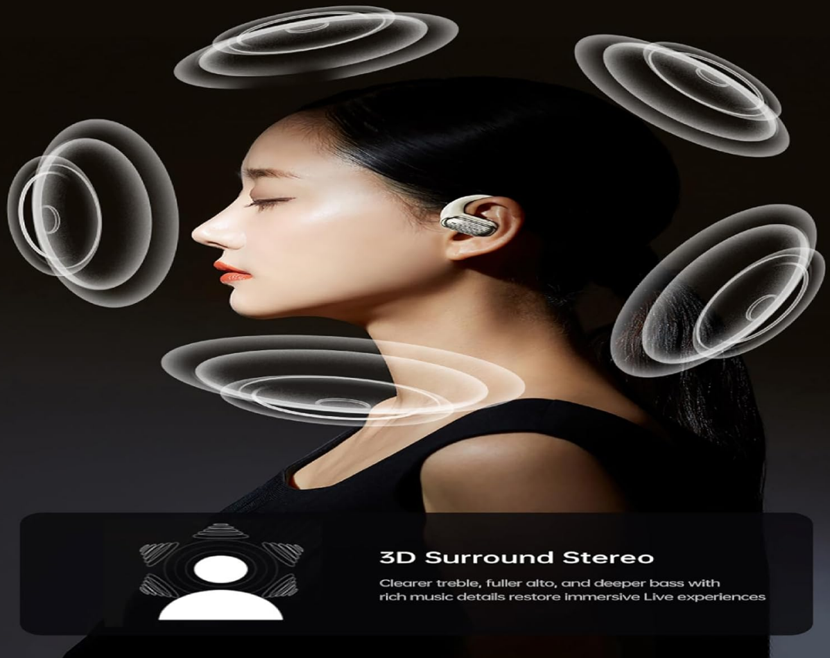
Image: A person with sound waves emanating from the AWEI T95 earbuds, illustrating the dynamic spatial sound effects and 3D surround stereo experience.