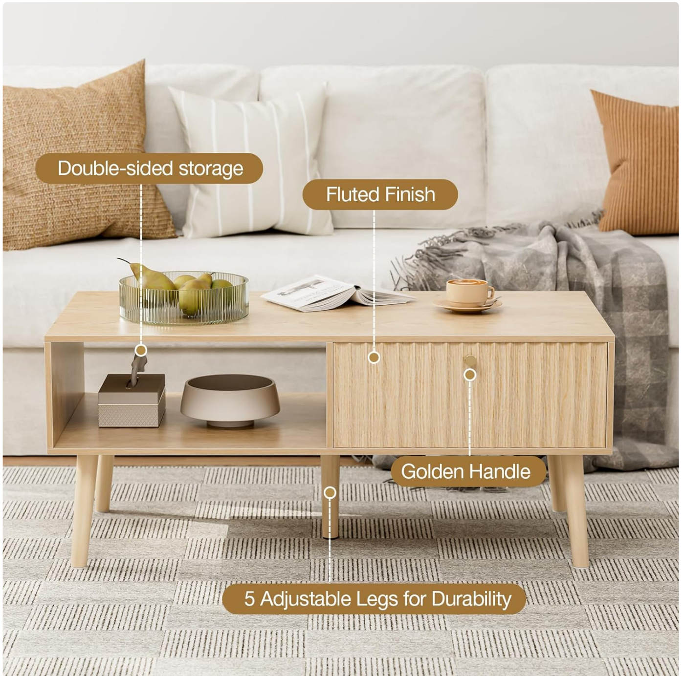
Image: Highlights key features including double-sided storage, fluted finish on the drawer, golden handle, and five adjustable legs for durability.