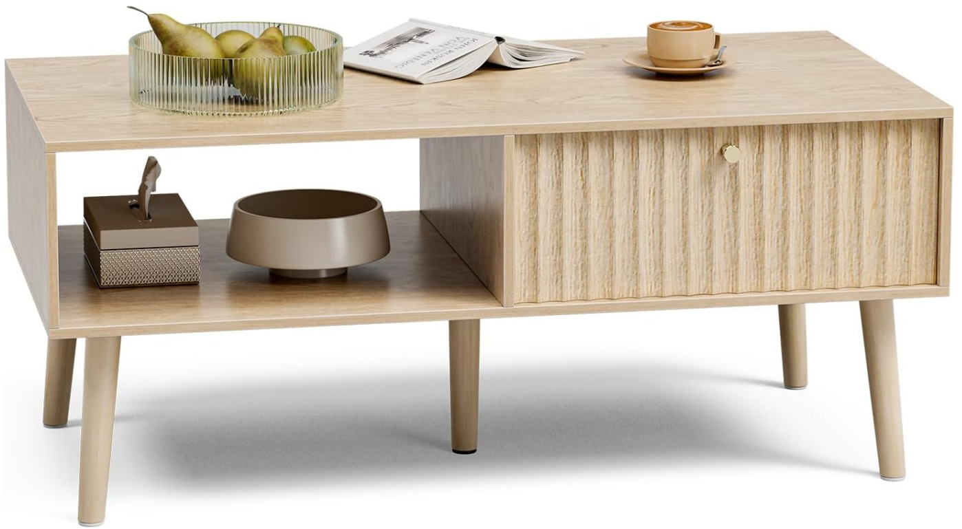
Image: A close-up view of the LCRBOL Coffee Table, demonstrating how items like books, a tissue box, and a bowl can be organized within its open shelf and fluted drawer.