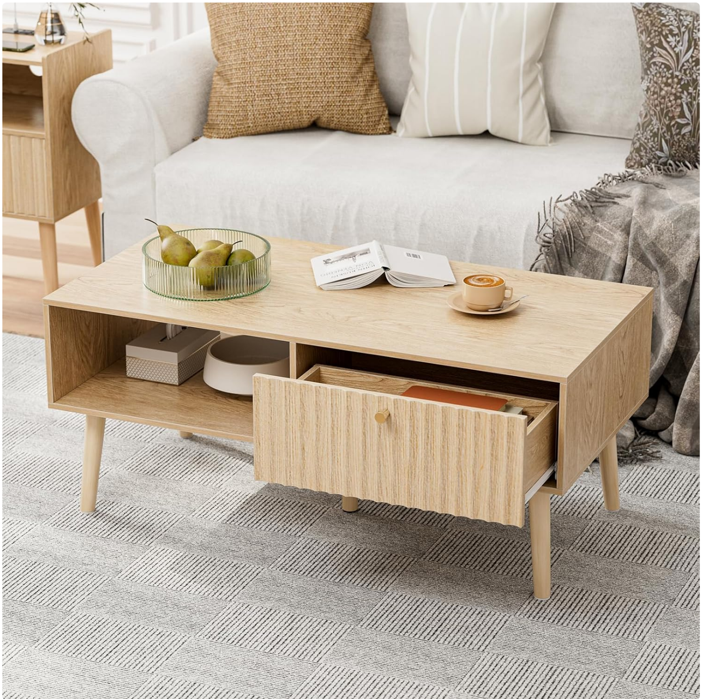
Image: The LCRBOL Coffee Table with its drawer open, showcasing its storage capabilities and elegant design in a living room environment.