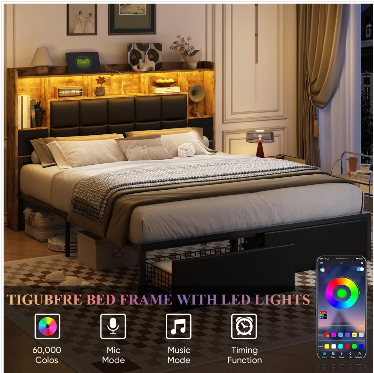
Image: The bed frame with its LED lights illuminated in different colors, showcasing customizable ambiance.

The integrated LED light strip can be controlled via a dedicated app or a physical button. Use the app to customize color, brightness, lighting modes, and set timing functions to suit your preference.