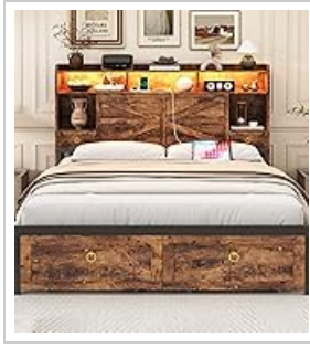
Image: Overview of the TIGUBFRE King Size LED Bed Frame, highlighting the bookshelf headboard and storage drawers.