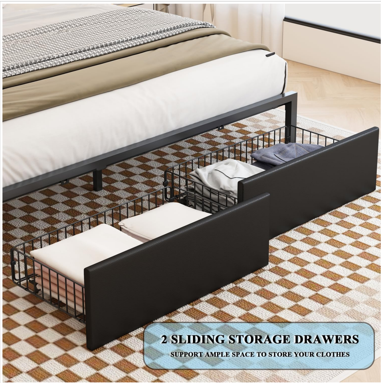
Image: The two sliding storage drawers at the foot of the bed, shown partially open with items inside.