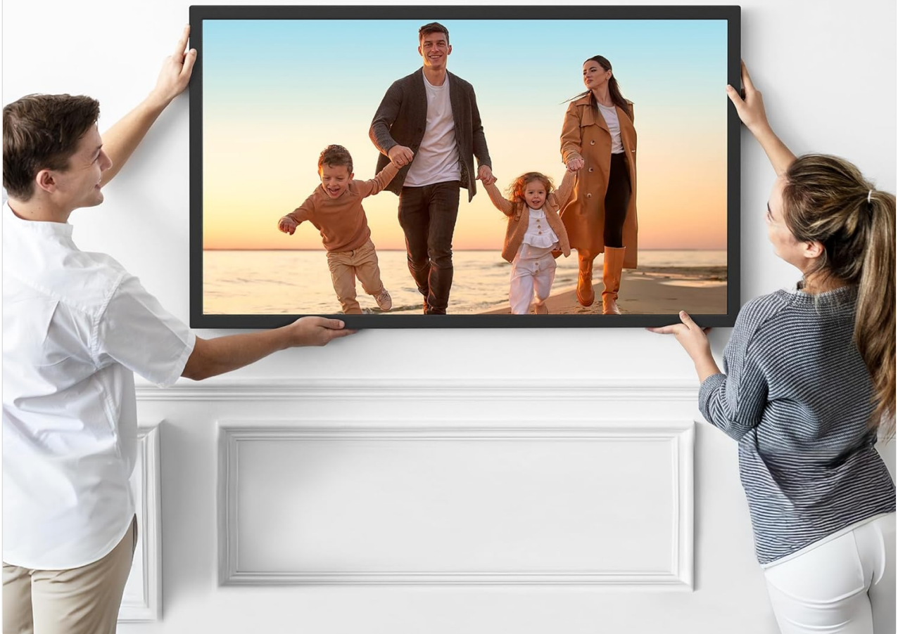
Image: The Dragon Touch Classic 32 Digital Picture Frame positioned on its included stand, showcasing the large display.