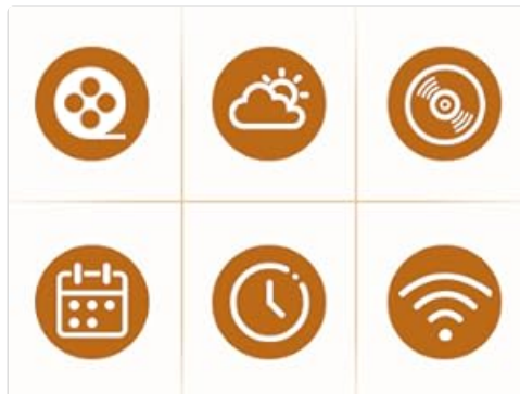
Image: A set of icons illustrating the frame's functionalities, including video, weather, music, calendar, clock, and Wi-Fi.