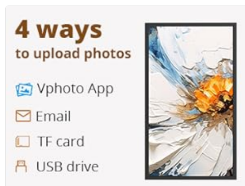
Image: An illustration detailing the four available methods for uploading photos to the frame: via the Vphoto App, email, TF card, and USB drive.