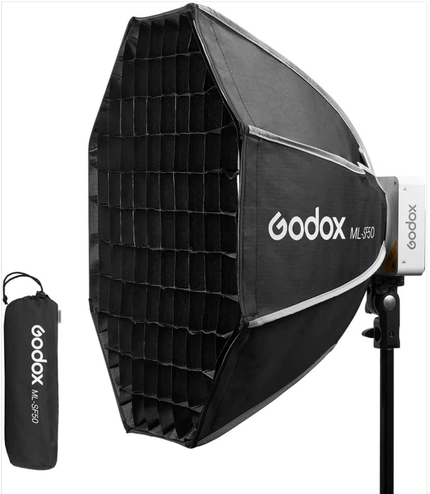
Figure 1: The Godox ML-SF50 Softbox shown with its compact carrying case, highlighting its portability.