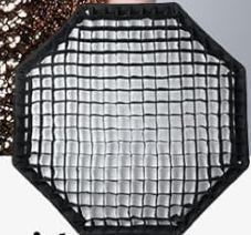
Figure 3: Visual comparison demonstrating the effect of using two layers of diffuser versus two layers of diffuser with the honeycomb grid for light control.