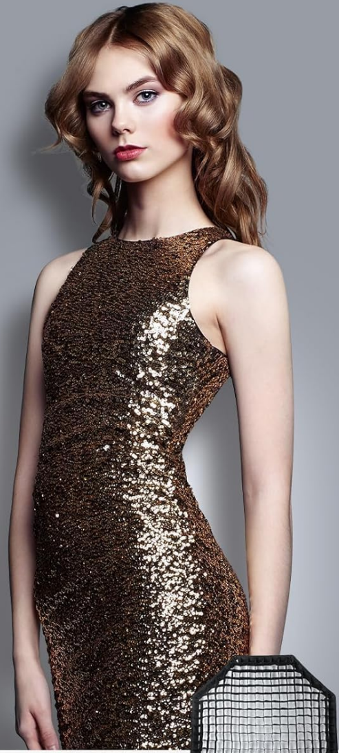
Two layers of diffuser + honeycomb grid