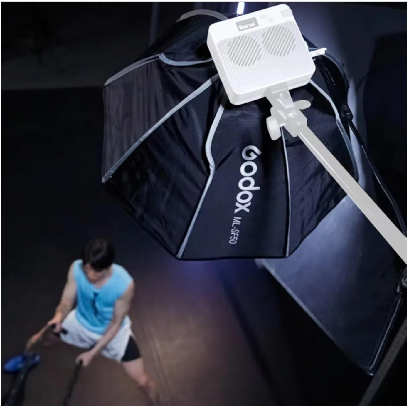
Figure 2: The ML-SF50 Softbox securely mounted onto a compatible Godox light, ready for use.