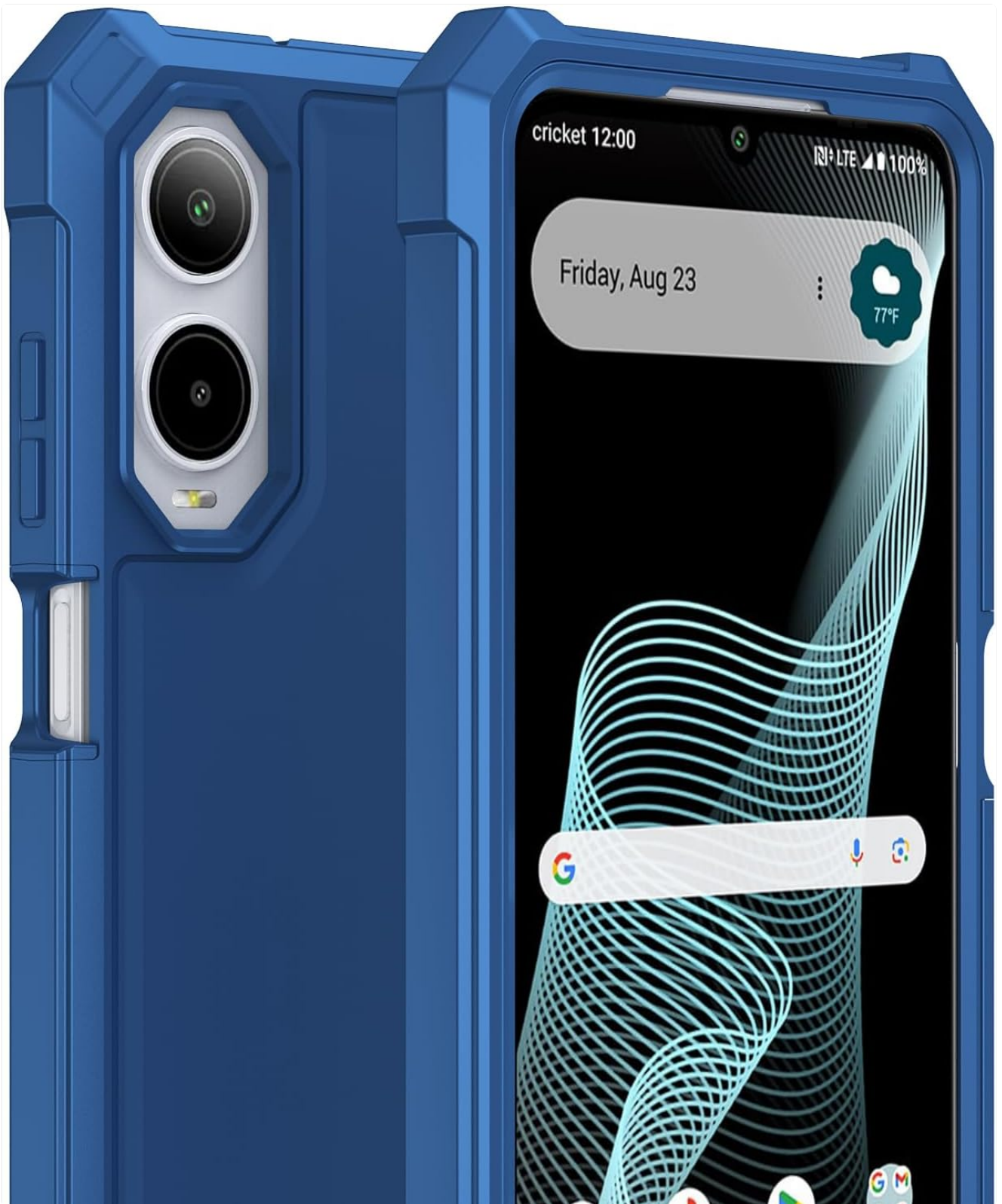
Figure 5: Precise Button and Camera Access