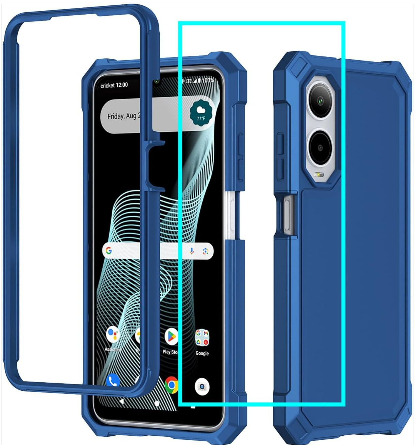
Figure 1: Aulzaju Phone Case (Blue) - Front and Back View