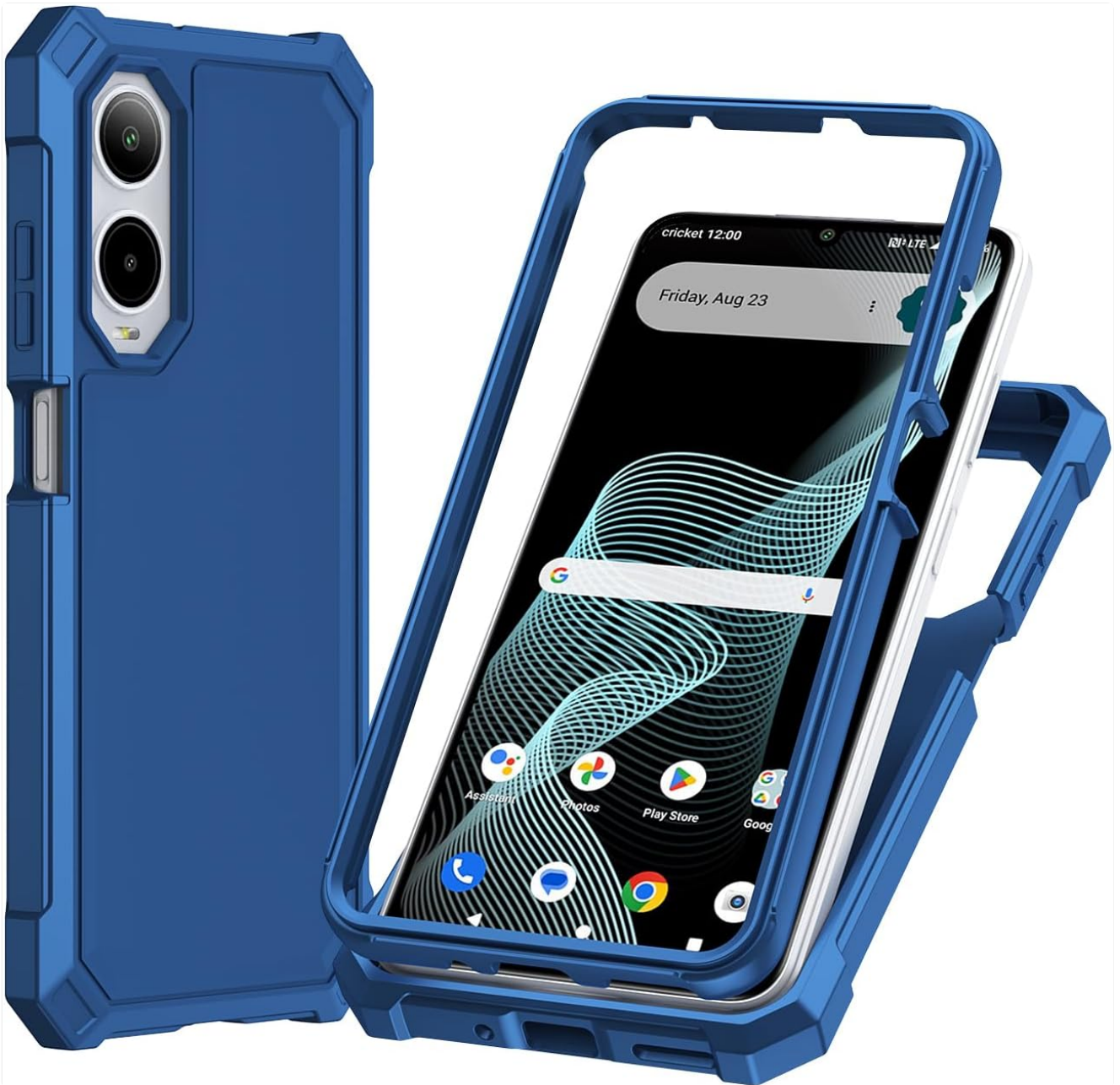
Figure 4: Assembling the Case