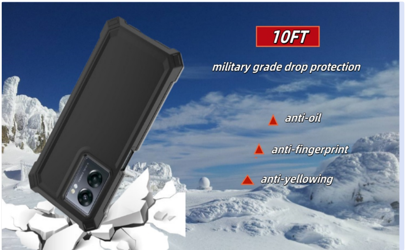
Figure 7: Military Grade Drop Protection