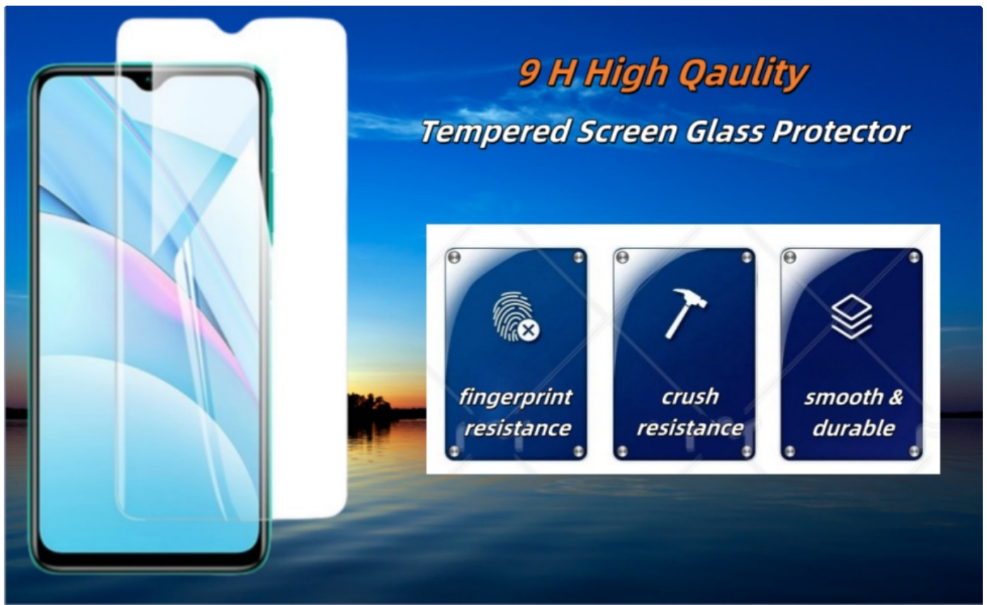
Figure 2: Tempered Glass Screen Protector Features