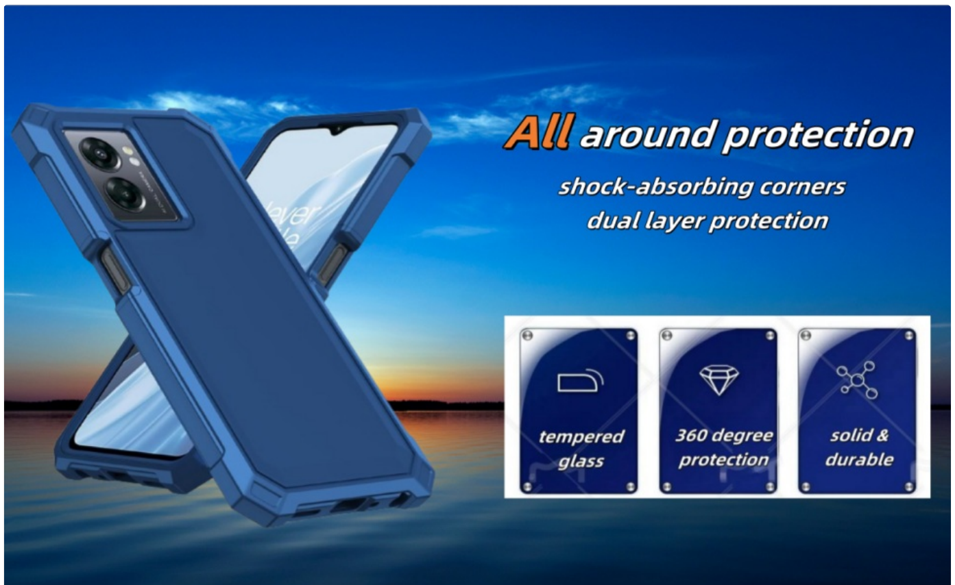
Figure 8: All-Around Protection Features