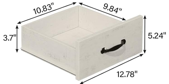
Figure 4.1: Product dimensions for planning your space and assembly.