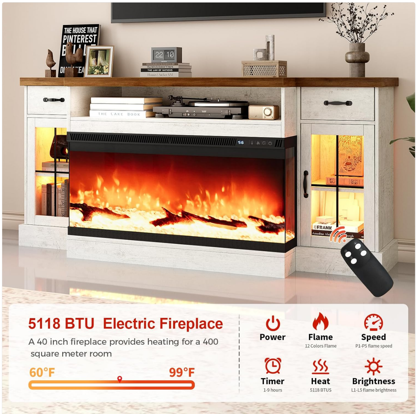
Figure 5.1: Key features and controls of the electric fireplace.