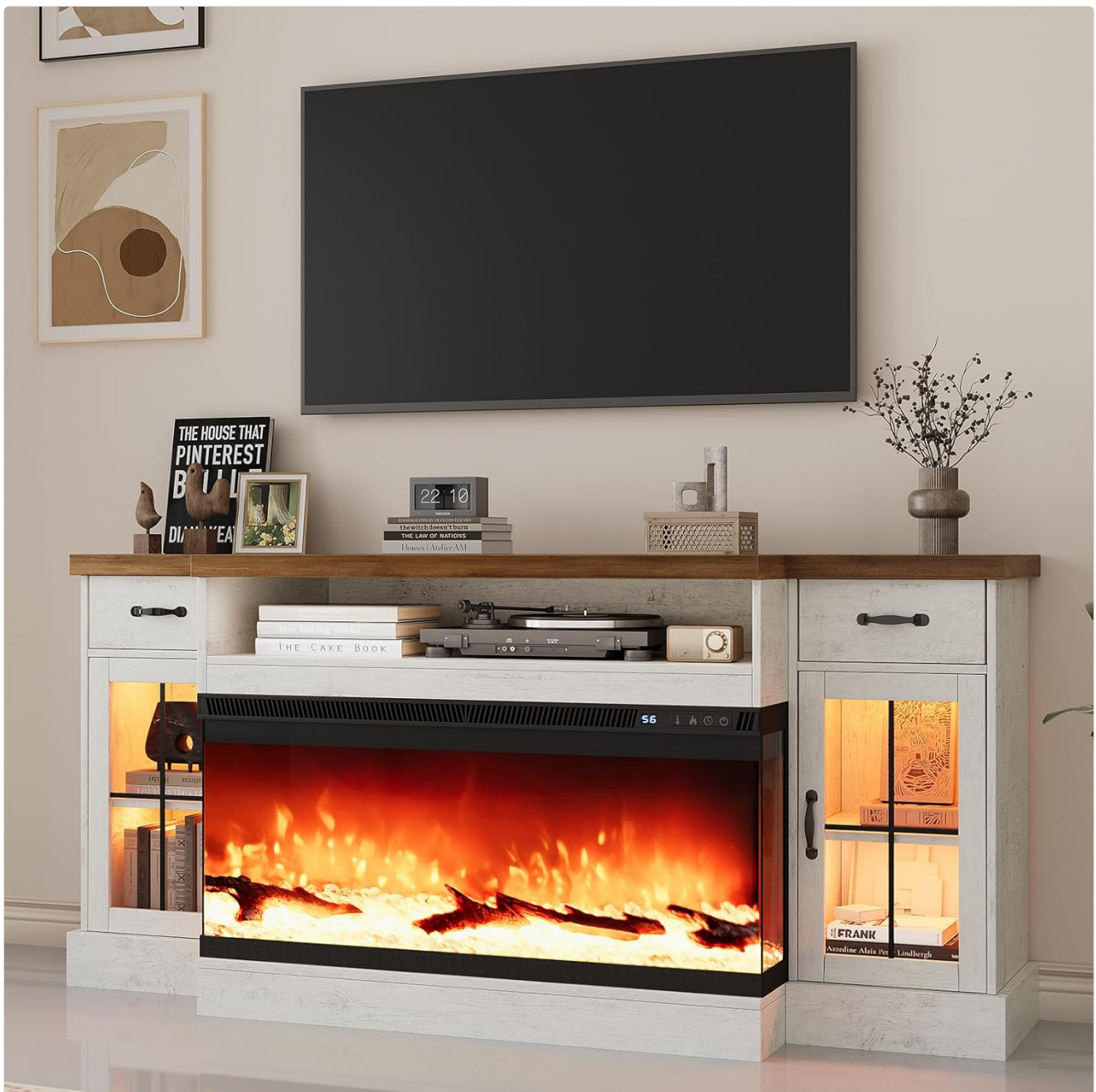
Figure 1.1: The 4 EVER WINNER Fireplace TV Stand with an 80-inch TV, showcasing its design and integrated electric fireplace.