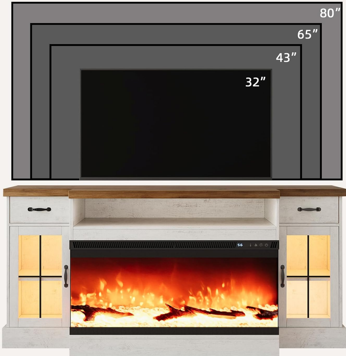
Figure 4.2: The TV stand is designed to accommodate TVs up to 80 inches.