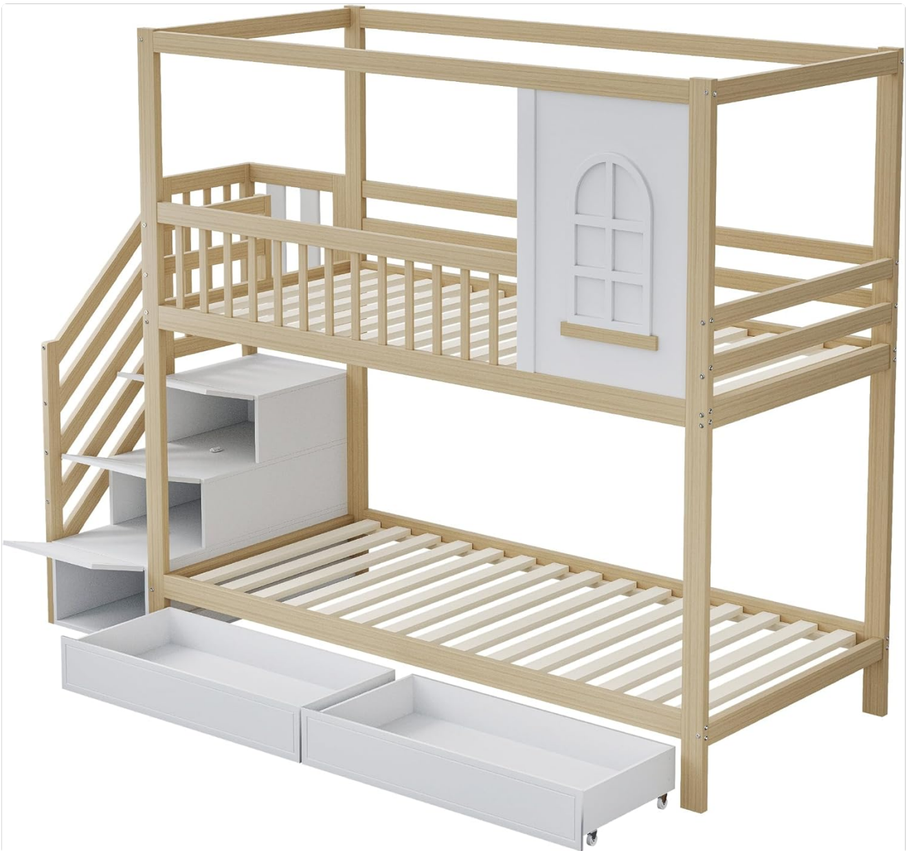
Image 2: Exploded view of the Moimhear Bunk Bed. This image displays the bunk bed with its various components slightly separated, highlighting the main bed frame, the safety ladder with its integrated storage compartments, and the two pull-out drawers designed to fit under the lower bunk. This view is helpful for identifying parts during assembly.