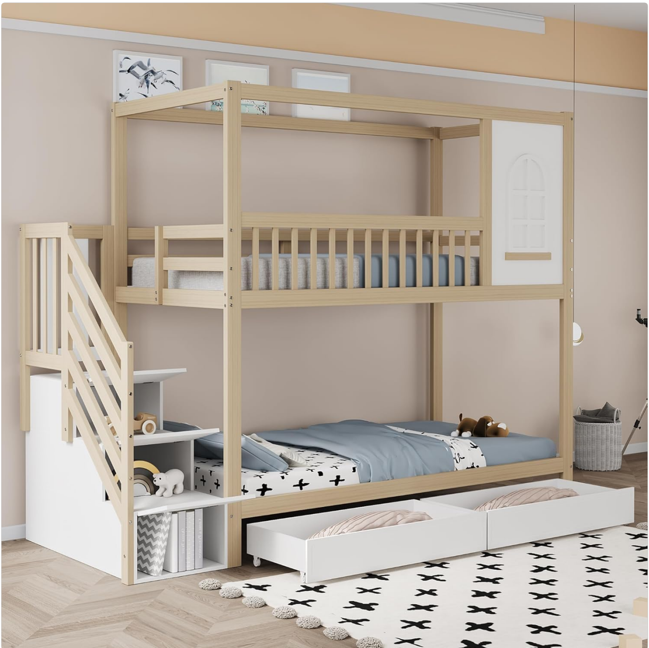
Image 3: Moimhear Bunk Bed in a room setting. This image shows the bunk bed fully assembled and decorated in a child's bedroom, highlighting its aesthetic appeal and functional features like the house-shaped upper bunk, the safety ladder with integrated storage, and the pull-out drawers beneath the lower bunk.