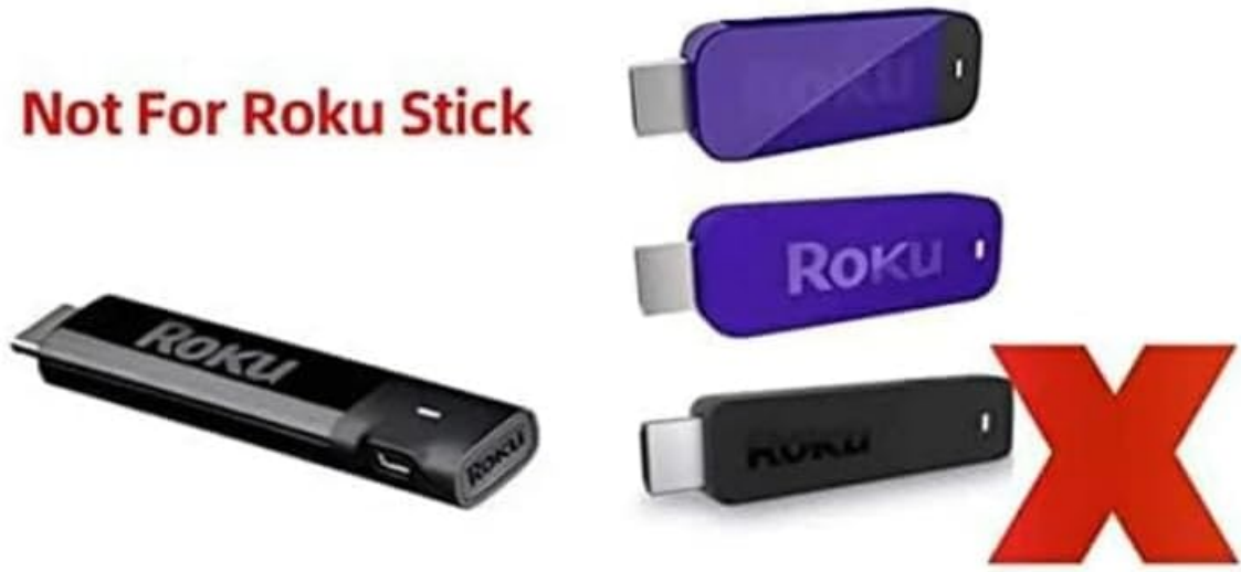
Image: A visual guide illustrating the compatibility of the remote. It shows various Roku Player Box models (e.g., Roku Ultra, Express, Premiere) with a green checkmark, indicating compatibility. Below, several Roku Stick models are shown with a red 'X', indicating incompatibility.