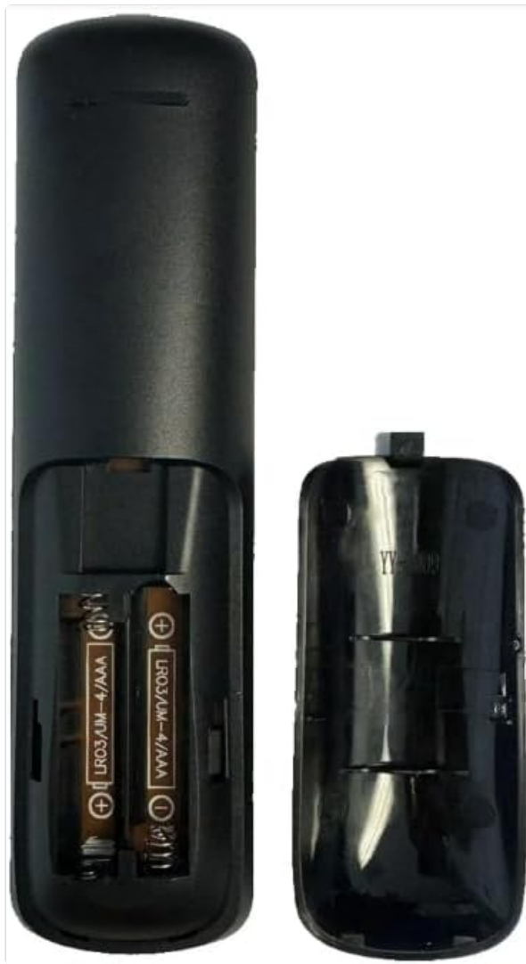
Image: The back of the Roku-T4026 remote control with the battery cover removed, revealing the battery compartment. Two AAA batteries are shown correctly inserted, indicating polarity.