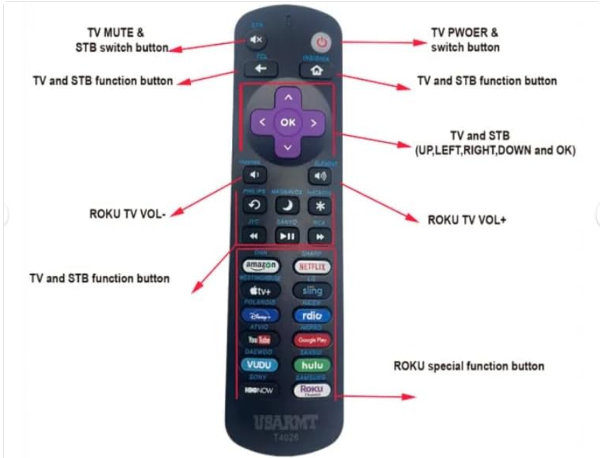
Image: A detailed diagram of the Roku-T4026 remote control, highlighting key buttons such as TV Mute & STB switch, TV Power & switch, TV and STB function buttons (directional pad, OK), Roku TV Volume controls, and Roku special function buttons (app shortcuts).