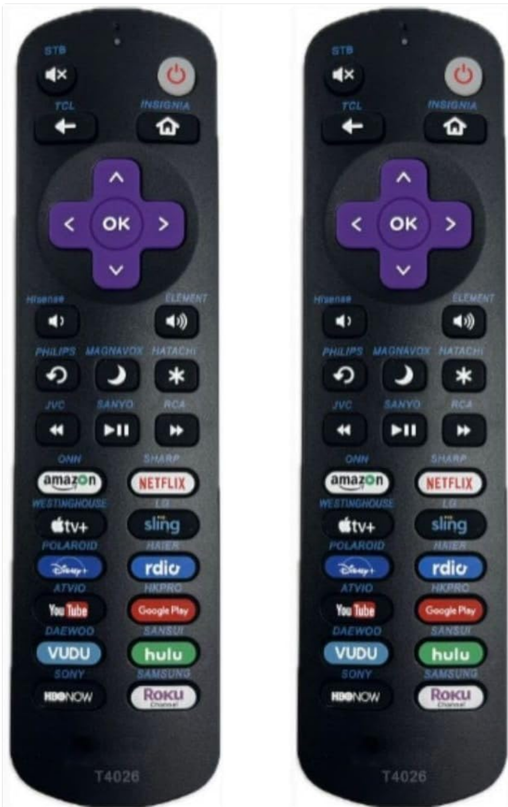
Image: Two Besia Roku-T4026 universal remote controls, showcasing the front view with all buttons clearly visible. The remote is black with purple directional pad and various app shortcut buttons.