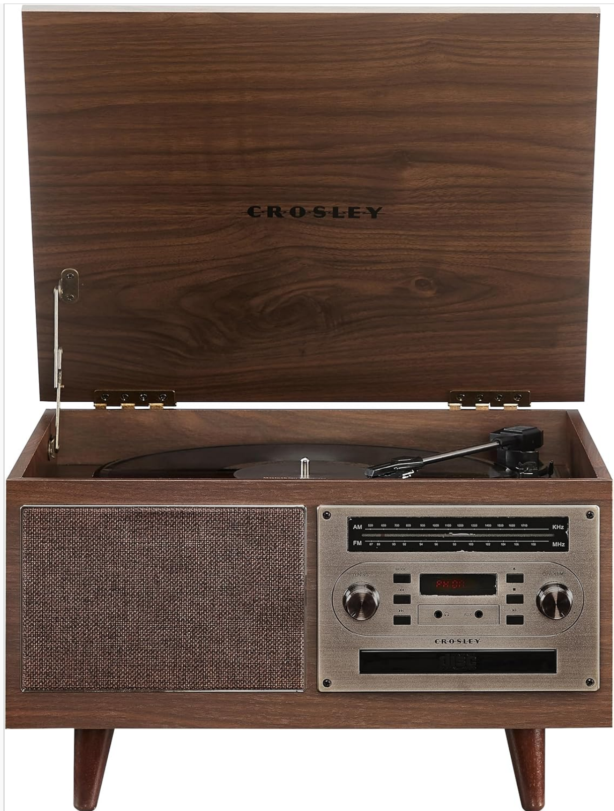
Image 1.1: Front view of the Crosley Serenade CR7023A with the turntable lid open.