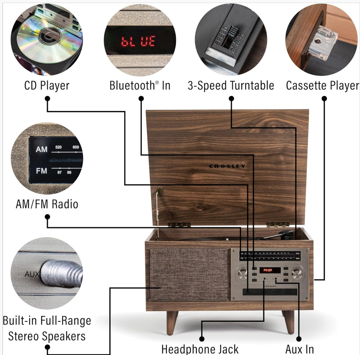
Image 2.1: Key features and components of the Crosley Serenade CR7023A.