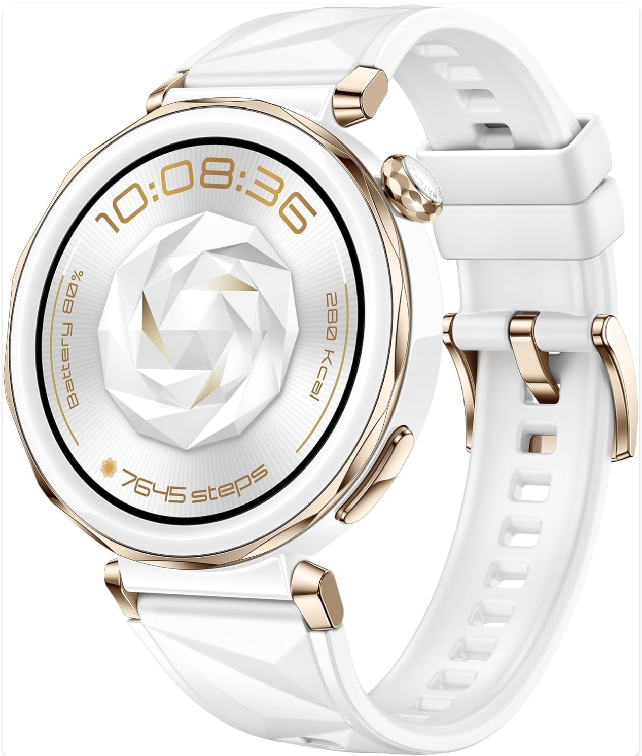
Figure 1.1: Front view of the HUAWEI Watch GT 5 Pro 42 mm Smartwatch.