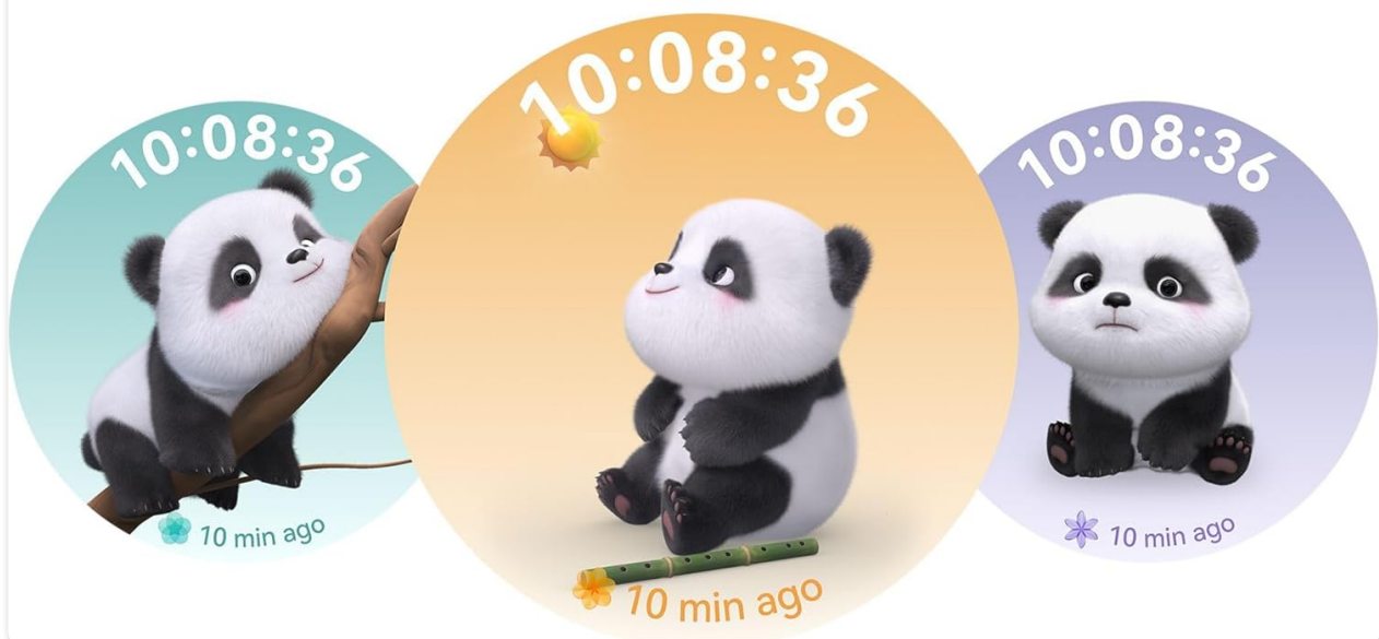
Figure 5.1: The Emotional Wellbeing Assistant provides insights into your emotional state.

The app uses HUAWEI TruSense data to tell you how you're feeling in the moment