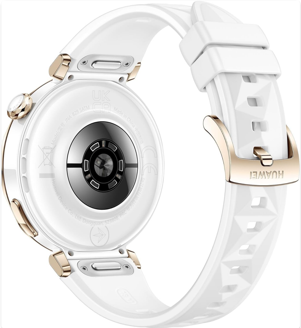
Figure 2.1: Rear view of the HUAWEI Watch GT 5 Pro, highlighting the health sensors.