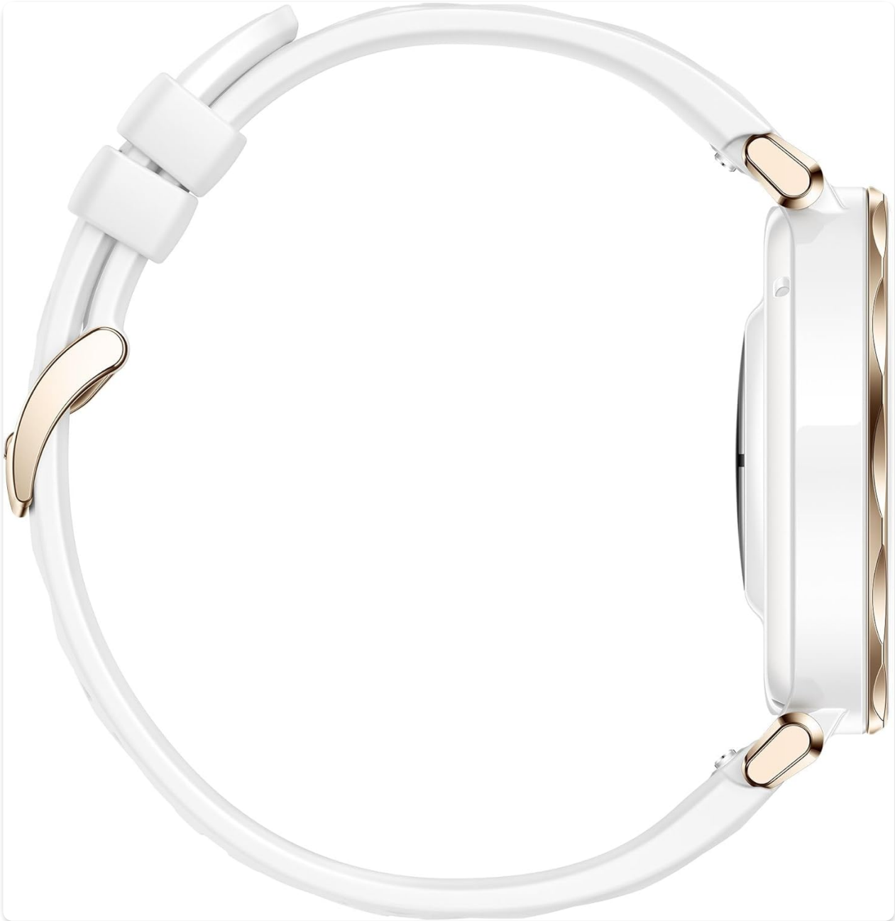
Figure 4.1: Side view of the HUAWEI Watch GT 5 Pro, illustrating the physical crown and button for interaction.

The HUAWEI Watch GT 5 Pro features a responsive touchscreen and a rotatable crown for intuitive navigation. Swipe left, right, up, or down to access different screens and menus. Rotate the crown to scroll through lists or zoom in/out on certain interfaces.