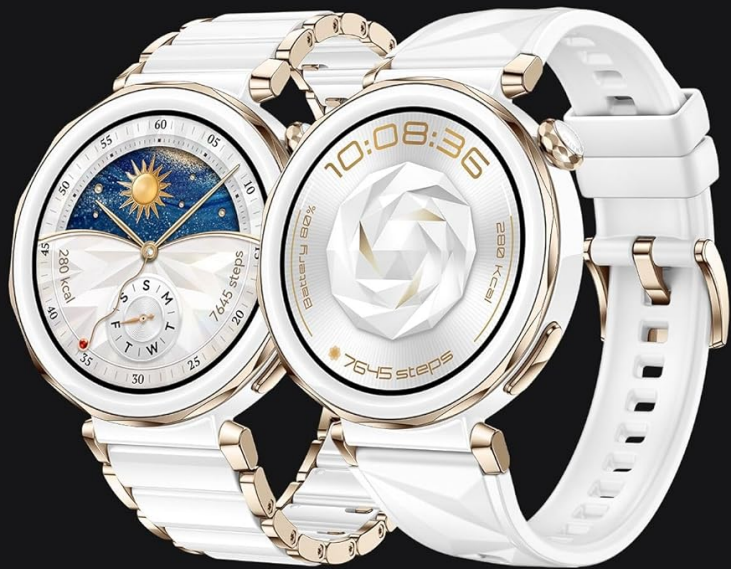
HUAWEI WATCH GT 5 Pro 42mm

Figure 7.1: The HUAWEI Watch GT 5 Pro offers robust battery life, up to 7 days max and 5 days typical.