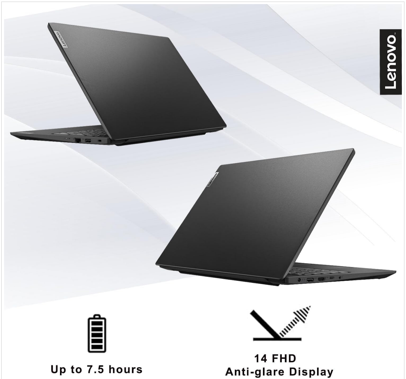
Image: Two views of the Lenovo Business Laptop, highlighting the 14-inch FHD anti-glare display and indicating up to 7.5 hours of battery life.