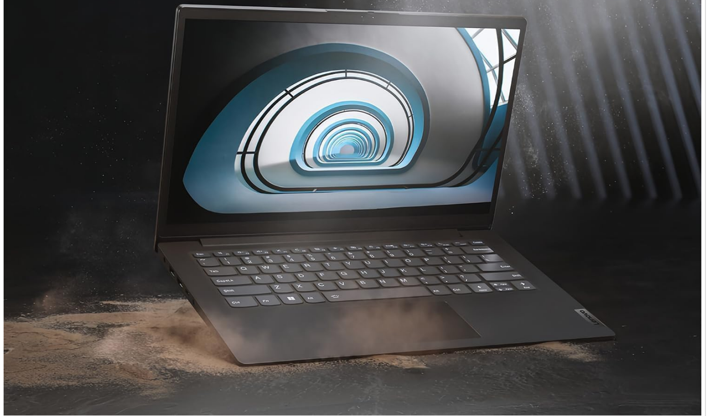
Image: Lenovo Business Laptop in a dusty setting, illustrating its military-grade durability and robust construction.