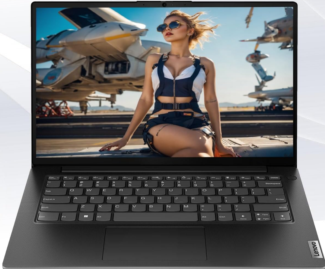
Image: Lenovo Business Laptop displaying a person on its screen, illustrating the immersive audio experience.