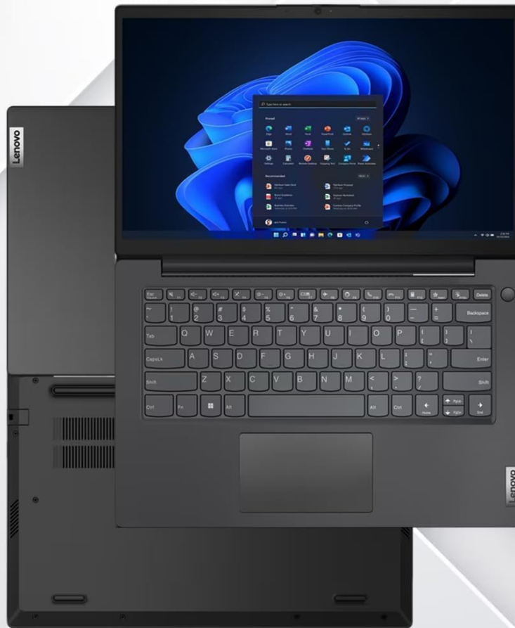
Image: Lenovo Business Laptop with its screen opened flat, demonstrating the 180-degree hinge functionality.

The 180-degree screen hinge allows you to open and carry it flat like a tablet.