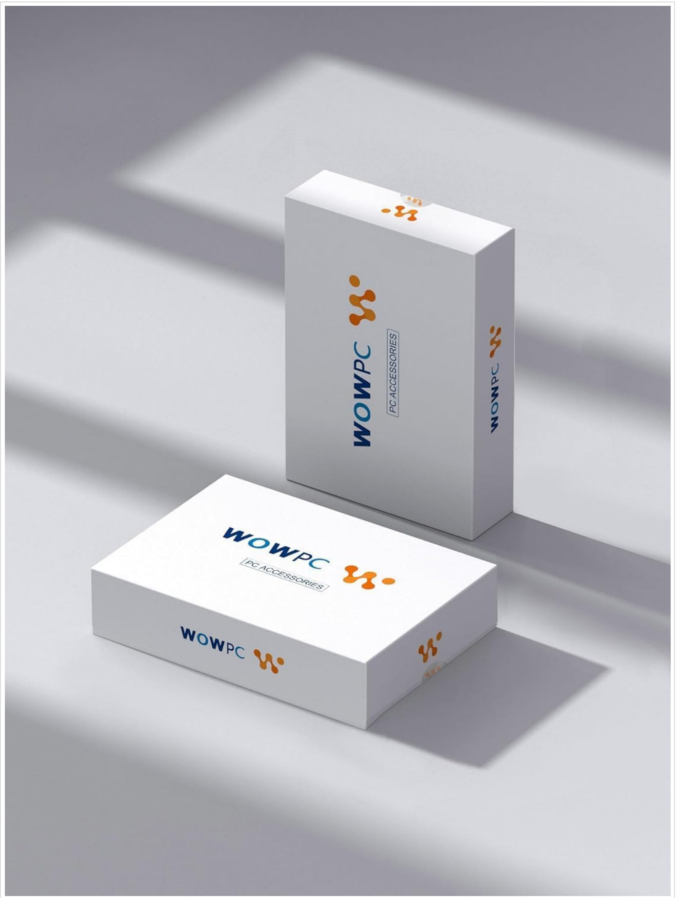
Image: WOWPC bundle accessories packaging. This image displays two white boxes with 'WOWPC PC Accessories' branding, indicating the included bundle items.