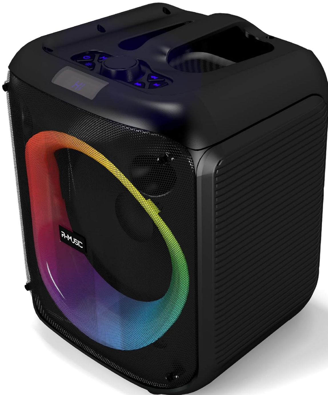
The R-MUSIC Party Boost S speaker, showcasing its integrated RGB lighting on the front grille and top control panel. The speaker is black with a textured finish on the sides and a convenient carry handle on top.