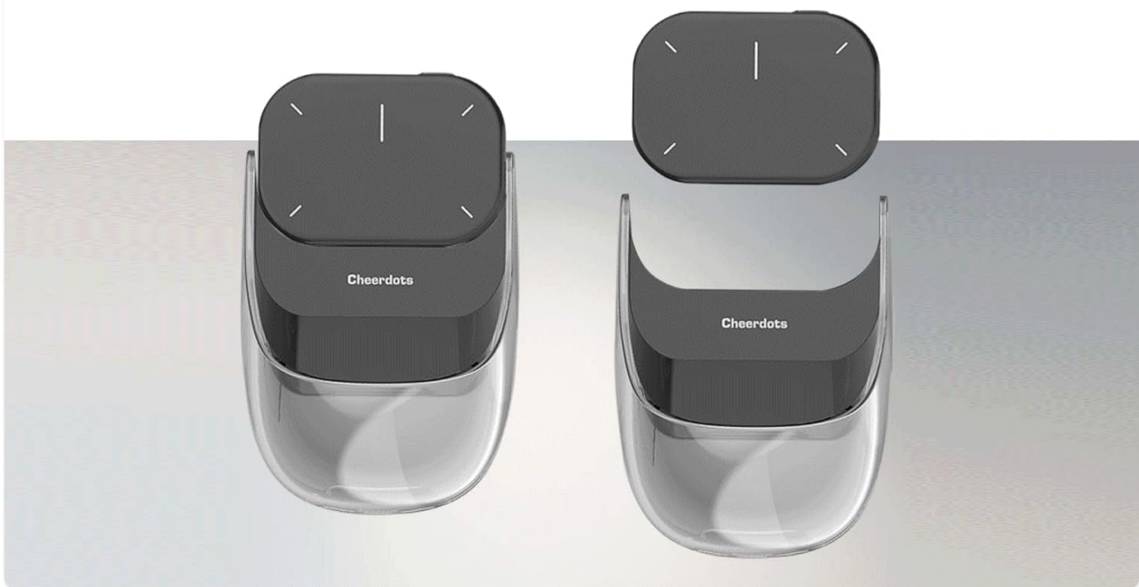
Image: Visual representation of the Cheerdots2's core functionalities including remote control, laser pointing, touchpad, and its split design.