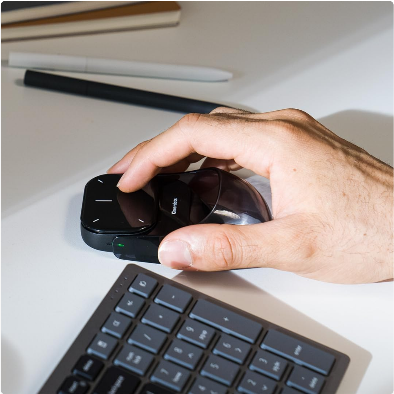
Image: A user operating the Cheerdots2 mouse in desktop mode, demonstrating its ergonomic fit for standard mouse functions.