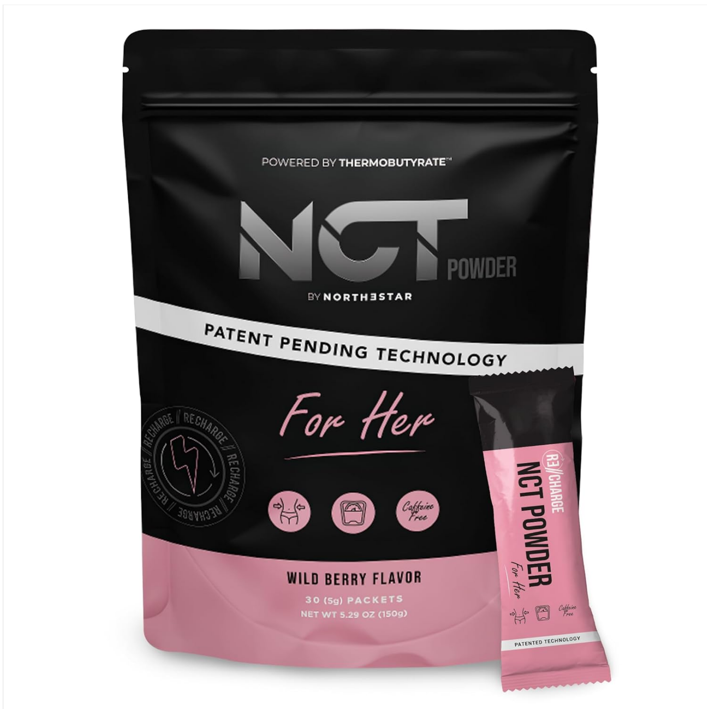
Image 1.1: NCT Powder For Her, Wild Berry Flavor, 30-packet pouch with a single packet shown. This image illustrates the product packaging and individual serving size.