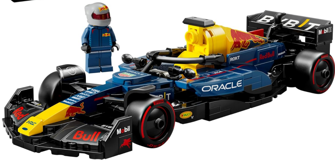
Image: The LEGO Speed Champions Oracle Red Bull Racing RB20 F1 Race Car Model 77243 box and the fully assembled model, showcasing its intricate details.