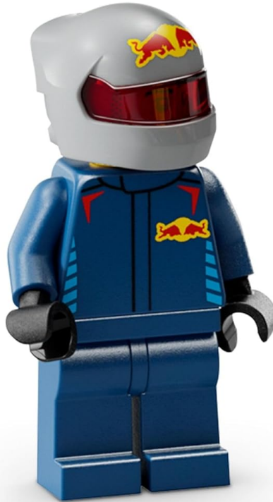
Image: The F1 driver minifigure, dressed in a Red Bull outfit and wearing a winged helmet, ready to be placed in the car's cockpit.