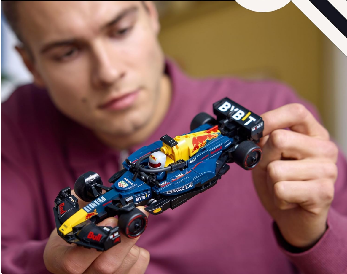
Image: A person engaged in the assembly process of the LEGO RB20 F1 Race Car model, demonstrating the hands-on building experience.