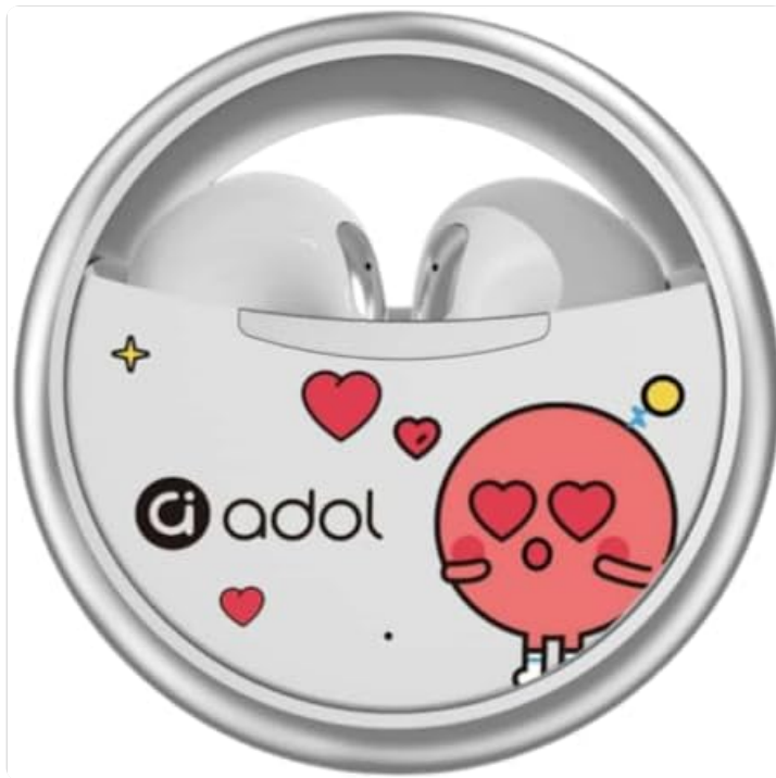
Image: The ASUS Adol earbuds nestled within their unique rotatable charging case, showcasing the compact and stylish design.