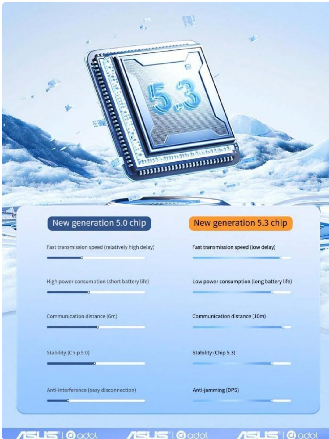
Image: A comparison chart detailing the advancements in Bluetooth chip technology, contrasting features like transmission speed, power consumption, and communication distance between Bluetooth 5.0 and 5.3. The ASUS Adol earbuds utilize Bluetooth 5.0 technology.