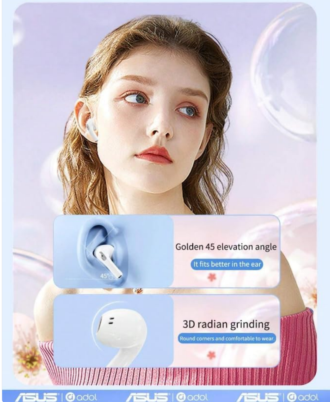
Image: A diagram illustrating the "Golden 45 elevation angle" and "3D radian grinding" for an optimal and comfortable earbud fit.