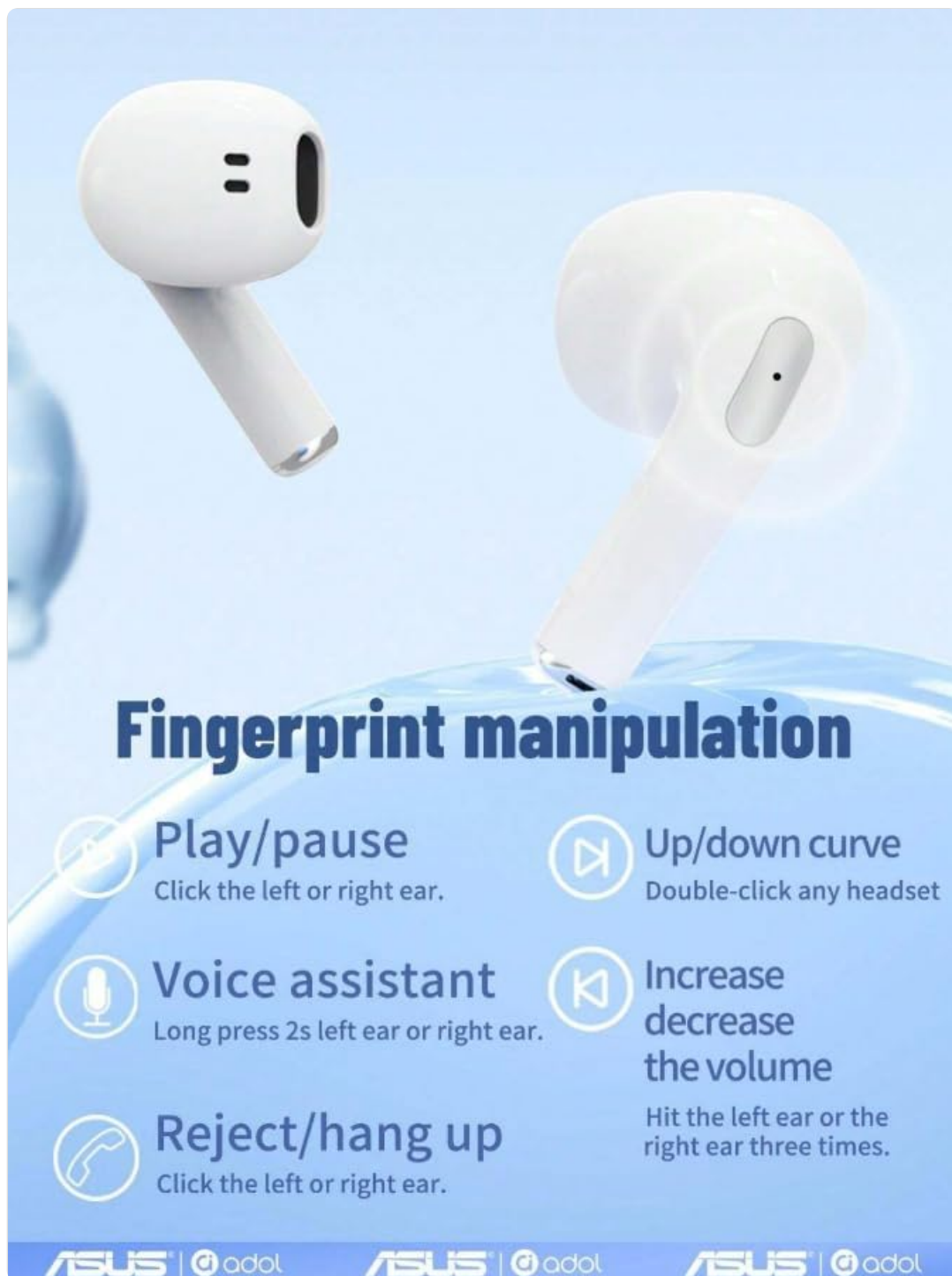
Image: A visual guide detailing the "Fingerprint manipulation" touch controls for the earbuds, including play/pause, track control, voice assistant, call management, and volume adjustment.