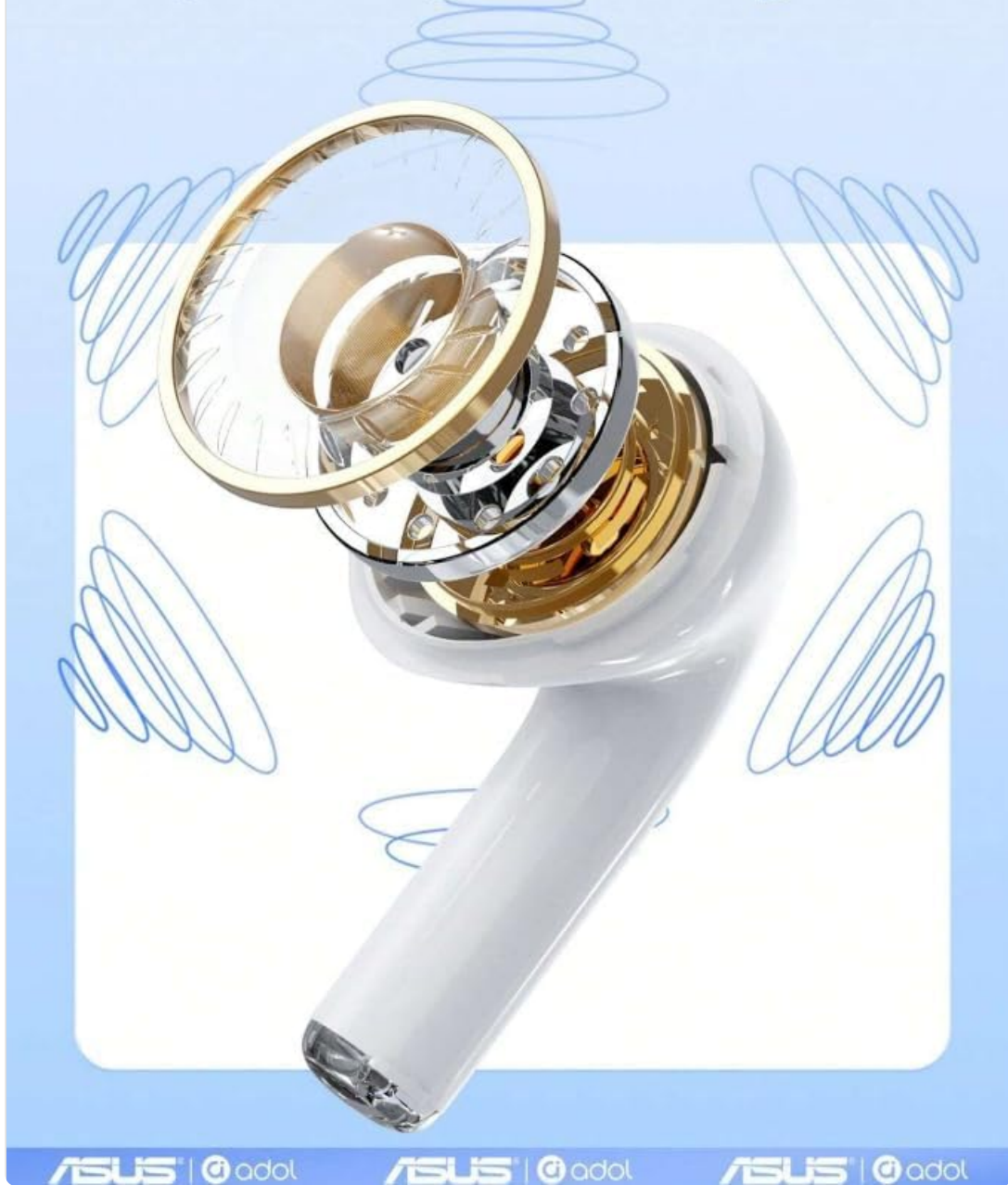
Image: An exploded view of the earbud highlighting the "Super-large moving coil" component, indicating advanced speaker technology for sound quality.