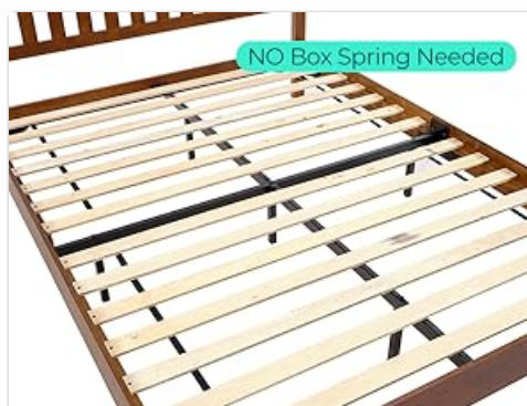
Figure 4.1: Slats providing direct mattress support, eliminating the need for a box spring.