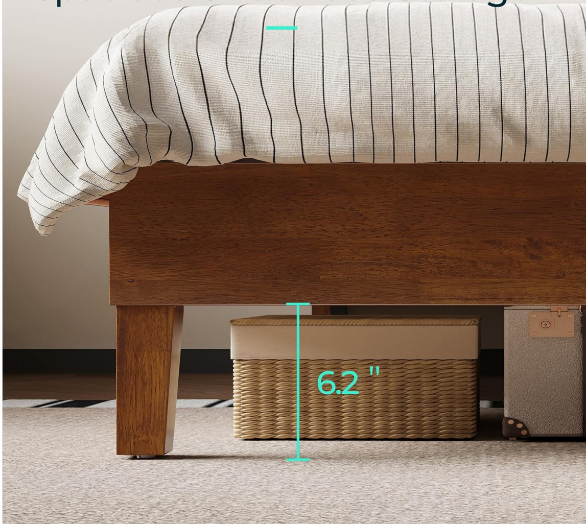
Figure 4.2: Illustration of under-bed storage space.