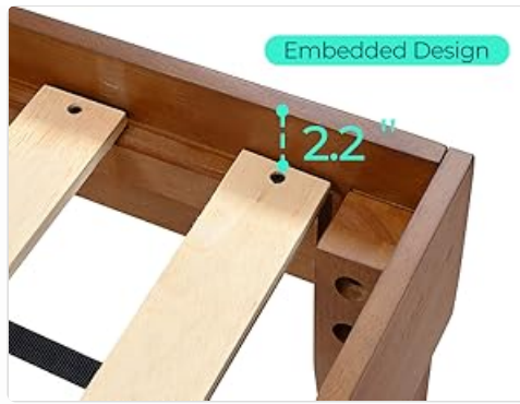
Figure 3.2: Detail of the embedded slat design for secure mattress support.