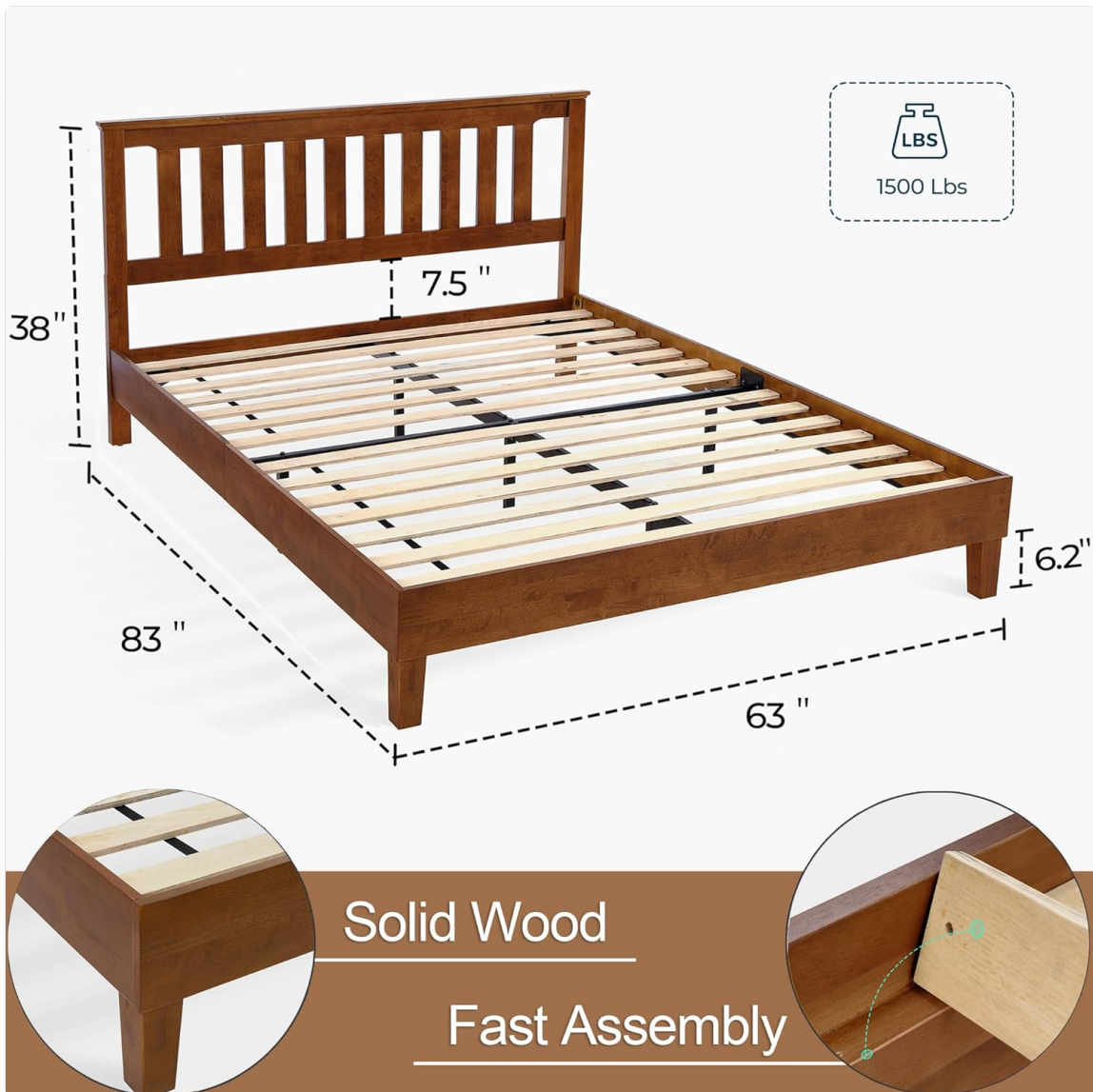
Figure 2.1: Exploded view of bed frame components and overall dimensions (83"L x 63"W x 38"H).