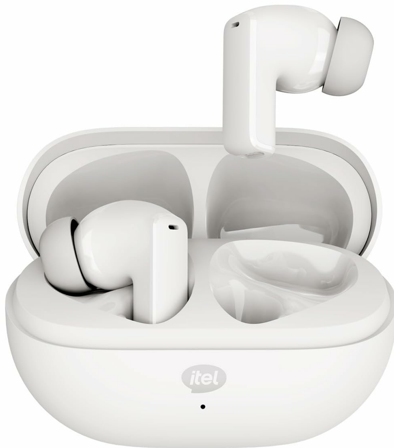
Image 1.1: itel Rhythm Pro True Wireless Earbuds in their charging case.