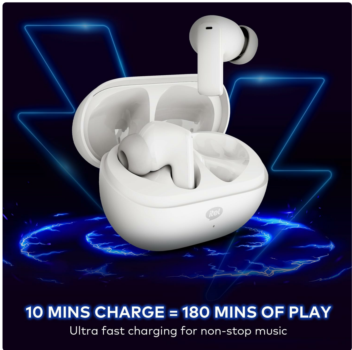
Image 3.1: itel Rhythm Pro True Wireless Earbuds removed from their charging case, showing individual earbud design.