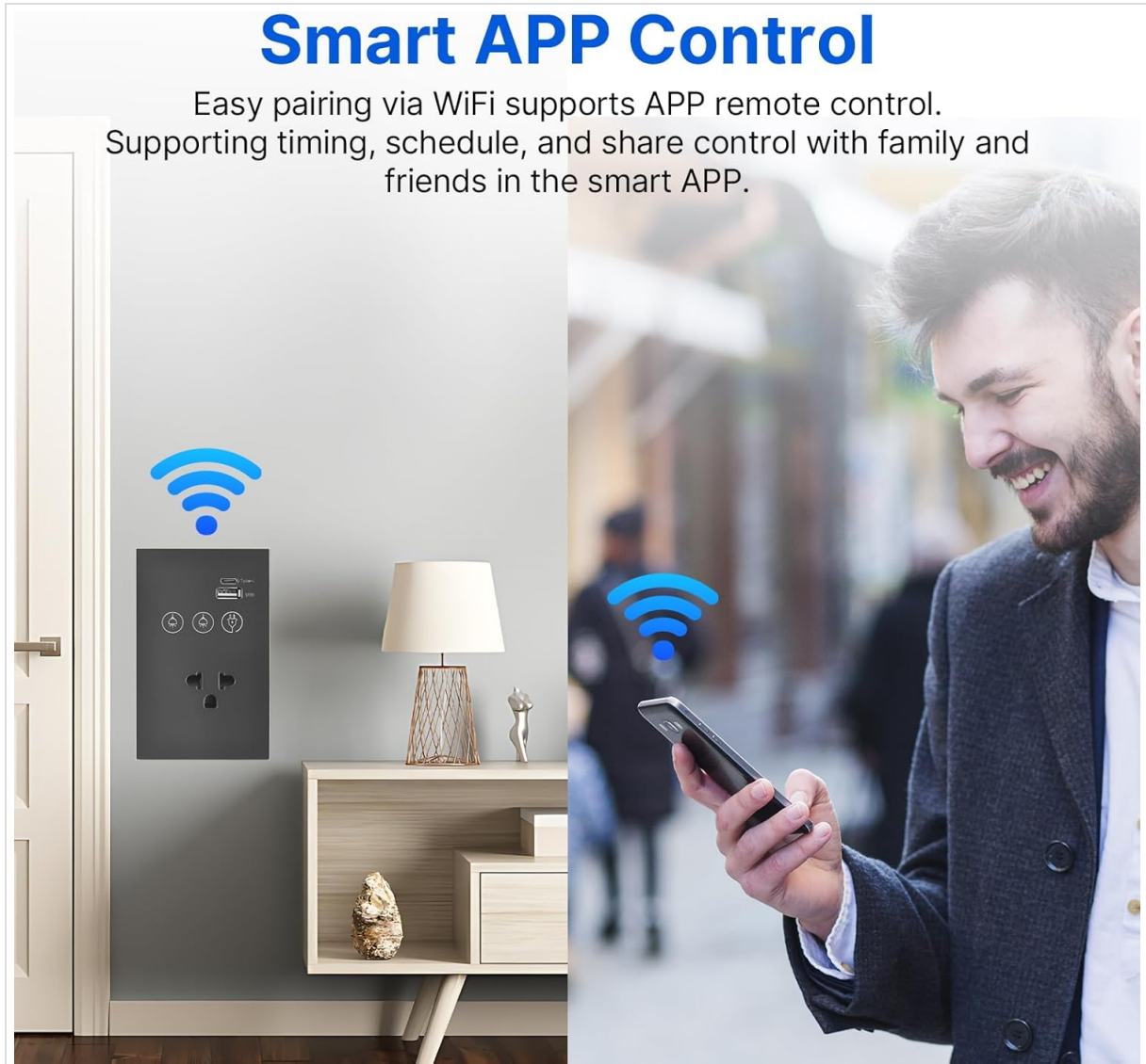
Image: Demonstrates remote control of the smart switch using a mobile application.