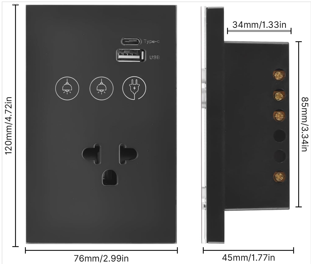
Image: Detailed dimensions of the smart wall switch for installation planning.