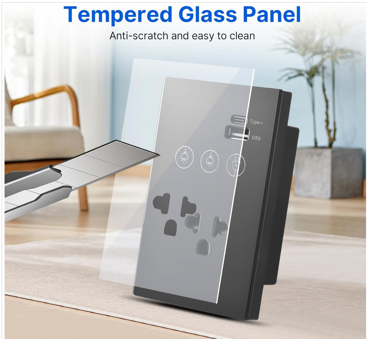
Image: The tempered glass panel offers sensitive and durable touch control.

The tempered glass panel features touch-sensitive icons for controlling the lights. Simply touch the light bulb icons to toggle the connected lights ON or OFF. The power outlet icon controls the integrated US plug outlet.