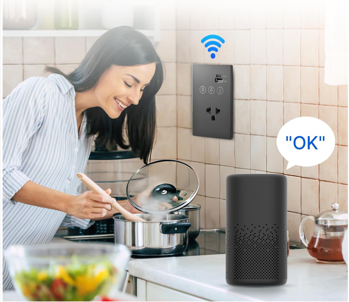
Image: Illustrates hands-free voice control of the smart switch.