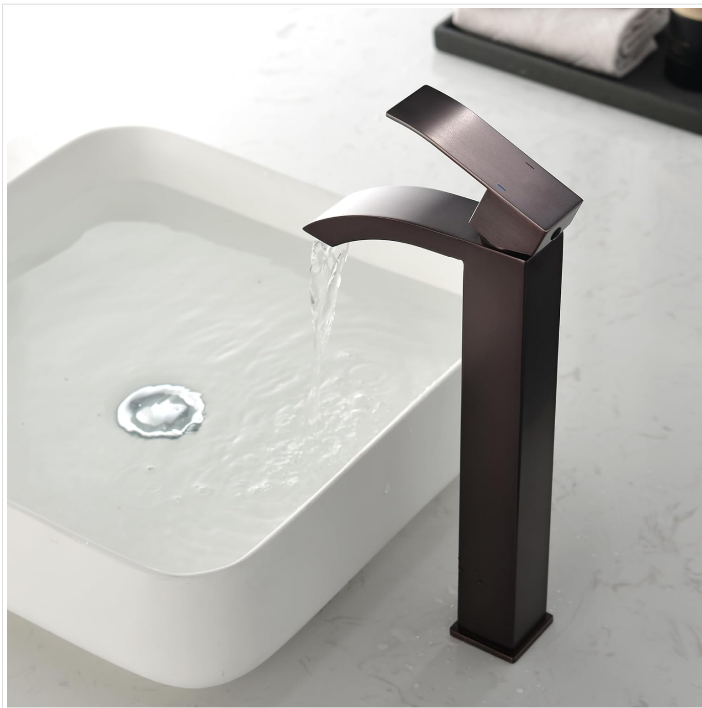
Figure 2: Image of the WELLFOR waterfall faucet installed on a bathroom sink, with water flowing into the basin. This illustrates the faucet's appearance and water delivery in a typical setup.