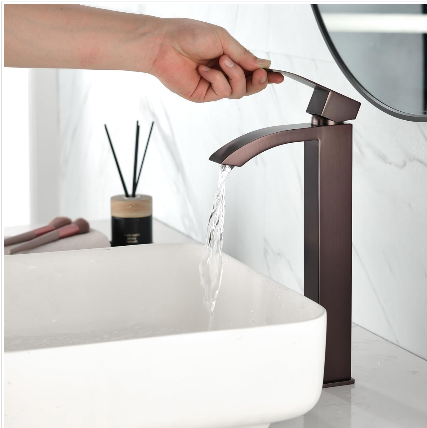
Figure 3: A hand adjusting the single handle of the WELLFOR faucet, demonstrating how to control water flow and temperature.