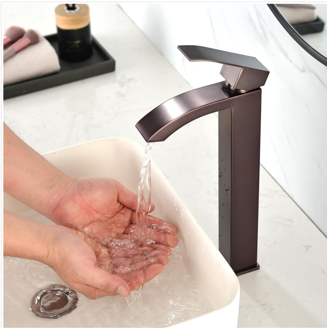
Figure 4: Hands placed under the flowing waterfall stream from the faucet, illustrating the water delivery pattern.