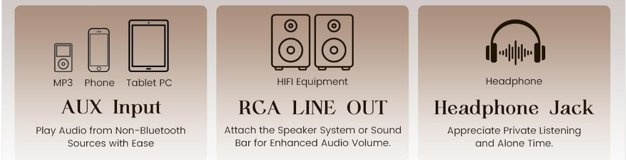
Figure 3.3: Rear Panel Connections

This image shows the rear panel of the record player, detailing the RCA Output Jack (L/R), AUX IN Jack, and Power Adapter (DC IN) port.