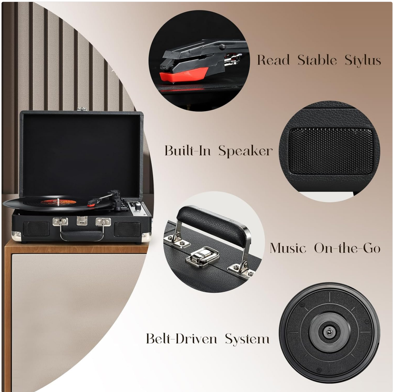
Figure 3.2: Key Features of the Hododou M63A Turntable

This diagram illustrates essential features including the stable stylus, built-in speakers, portable design for music on the go, and the belt-driven system.