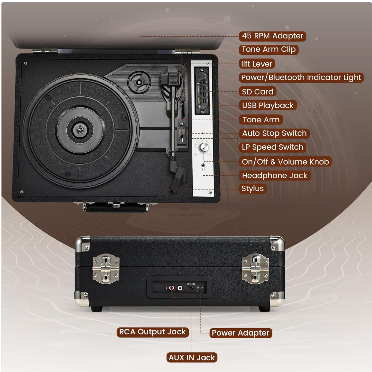
Figure 3.1: Top View of the Turntable with Labeled Controls

This image displays the top panel of the Hododou M63A record player, highlighting key components such as the 45 RPM adapter, tone arm clip, lift lever, power/Bluetooth indicator light, SD card slot, USB playback port, tone arm, auto stop switch, LP speed switch, On/Off & Volume knob, headphone jack, and stylus.