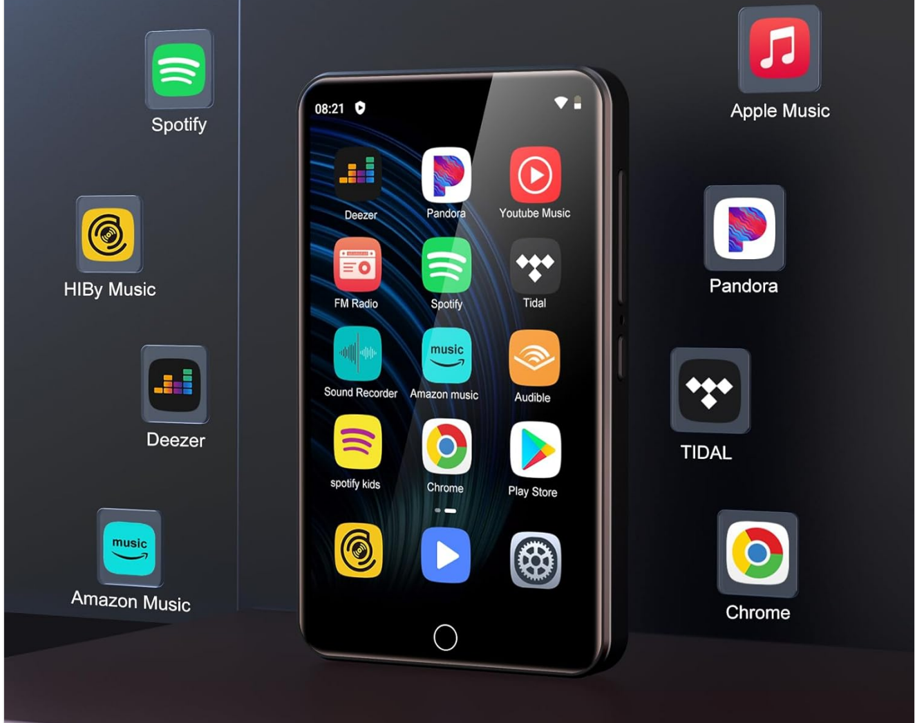
Figure 3.1: Multi-music Player Interface. This image illustrates the main interface of the Diofox M8 player, showcasing its multi-functional capabilities with pre-installed and downloadable applications for music, video, and other media.

Support you listening music&watch video online and offline.