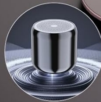
Figure 4.2: Wider Bluetooth Compatibility. The Diofox M8 offers broad Bluetooth compatibility, allowing quick and stable connections to different types of Bluetooth headphones, speakers, and car audio systems.