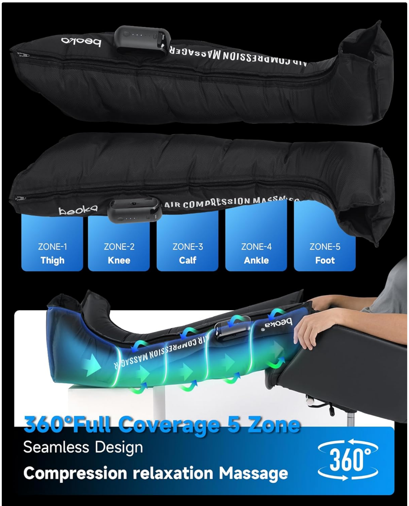
Image: Visual representation of the 5-zone, 360-degree full coverage compression massage.