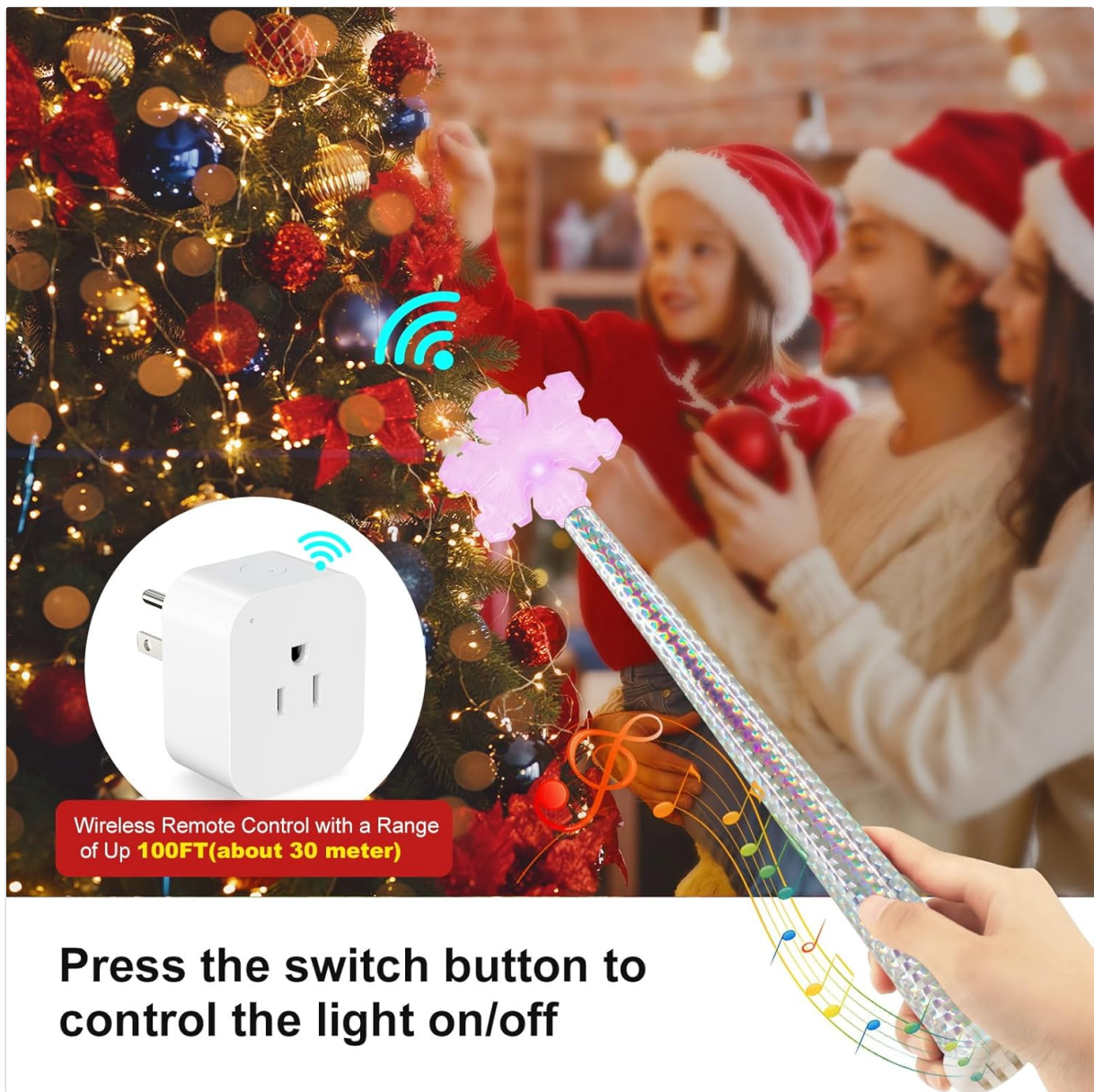
Image 6.1: A person using the Magic Light Wand to control Christmas tree lights, demonstrating the wireless remote control functionality with a range of up to 100 feet.