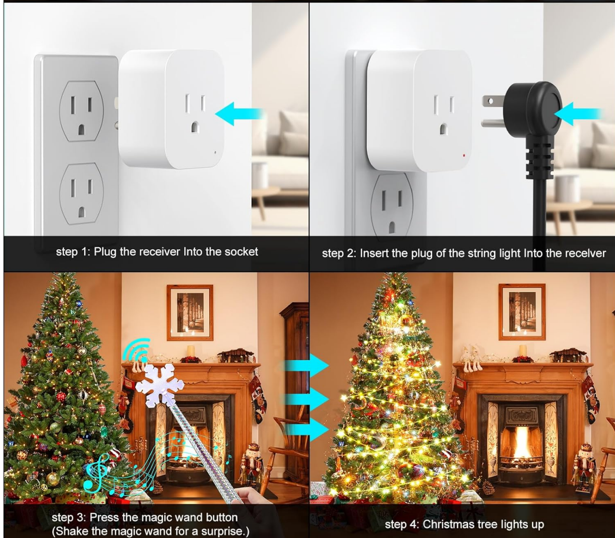
Image 5.1: Visual guide for connecting the receiver to a wall socket and plugging in the string lights.