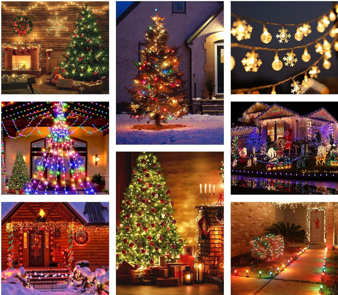
Image 6.3: Examples of various indoor and outdoor decoration lights that can be controlled using the HITRENDS Magic Light Wand system.