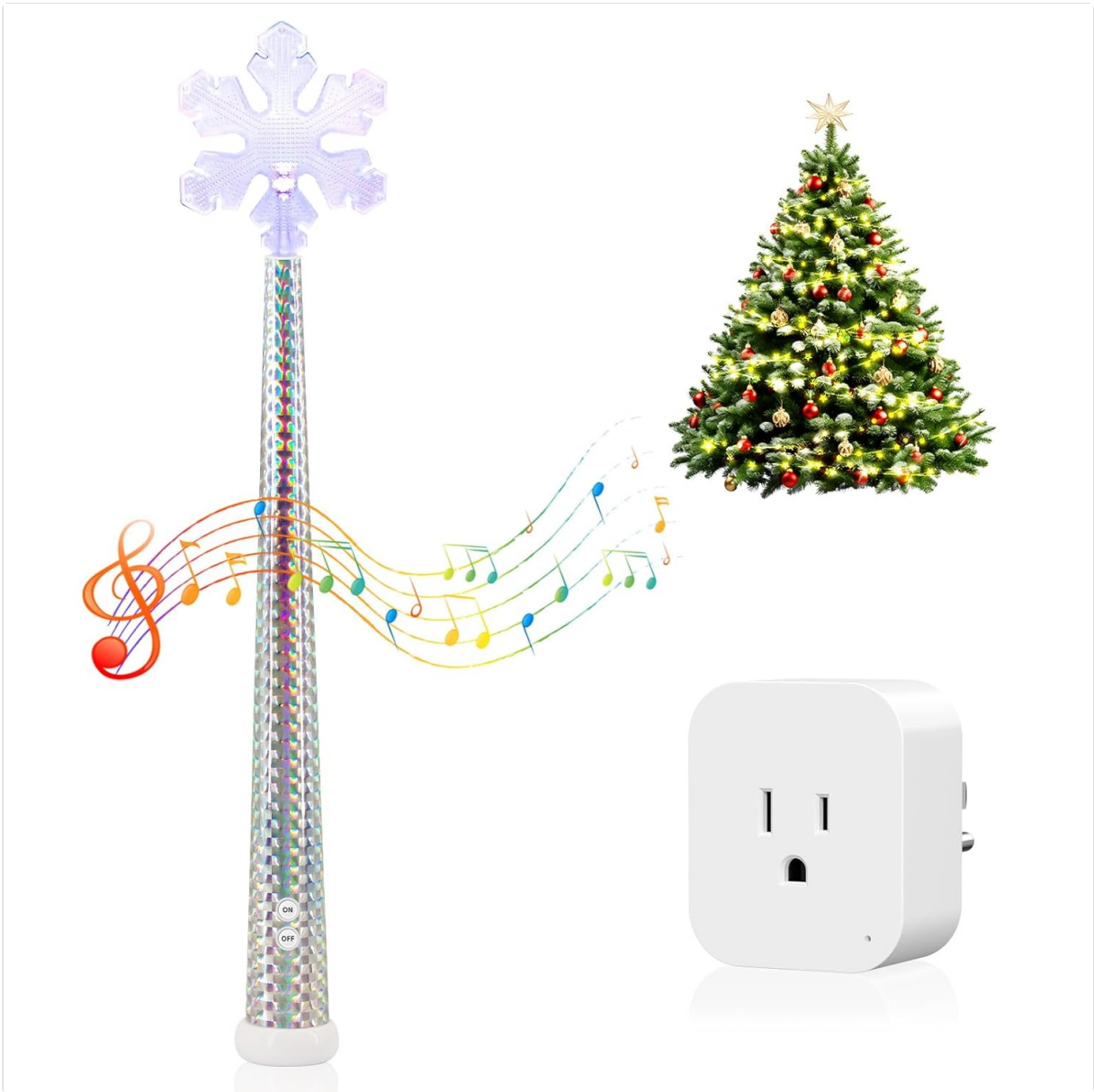
Image 4.1: The Magic Light Wand and its accompanying Wireless Remote Control Outlet Receiver.