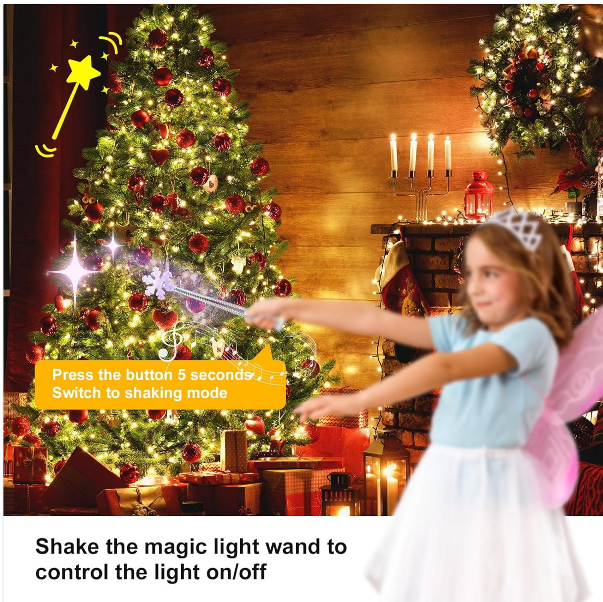
Image 6.2: A child demonstrating the shaking mode of the Magic Light Wand to control lights, accompanied by musical effects.