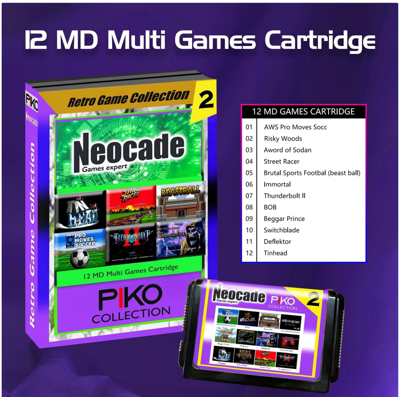
Image: The 'Retro Game Collection 2' cartridge and its box, clearly listing the 12 included MD games such as AWS Pro Moves Soccer, Risky Woods, Thunderbolt II, and Tinhead.

The included game cartridge contains the following 12 MD Piko games: