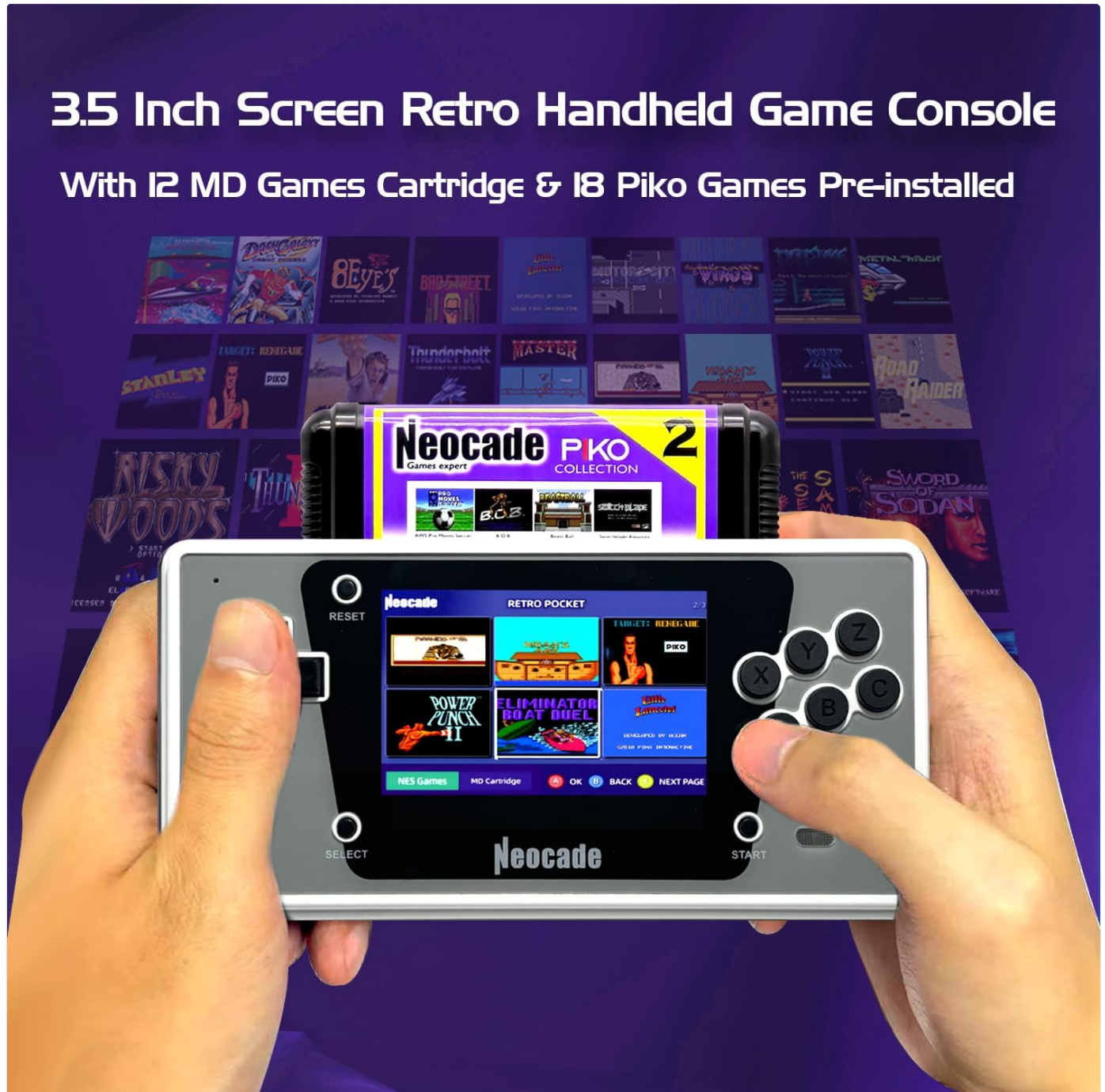
Image: A user holding the NEOCADE console, actively playing a game on its 3.5-inch LCD screen, demonstrating the handheld gaming experience.