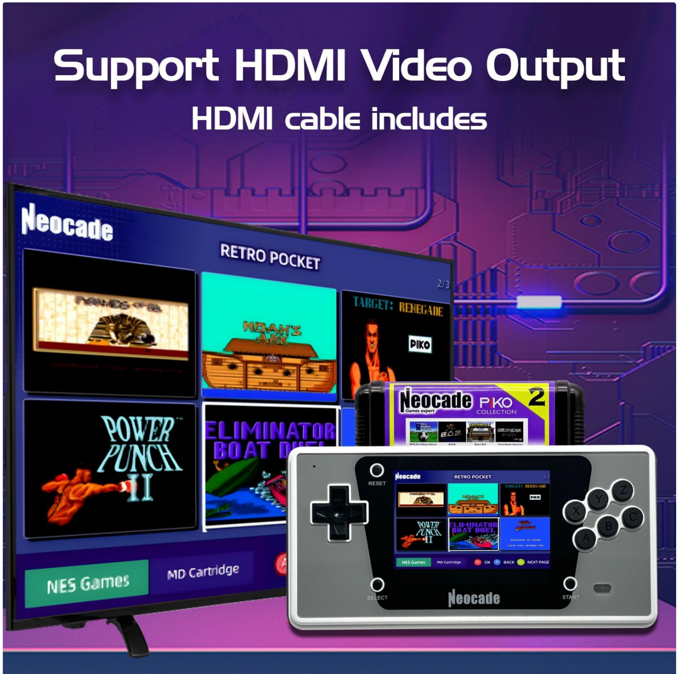
Image: The NEOCADE console connected to a television via an HDMI cable, showing the console's game selection menu mirrored on the larger TV screen.