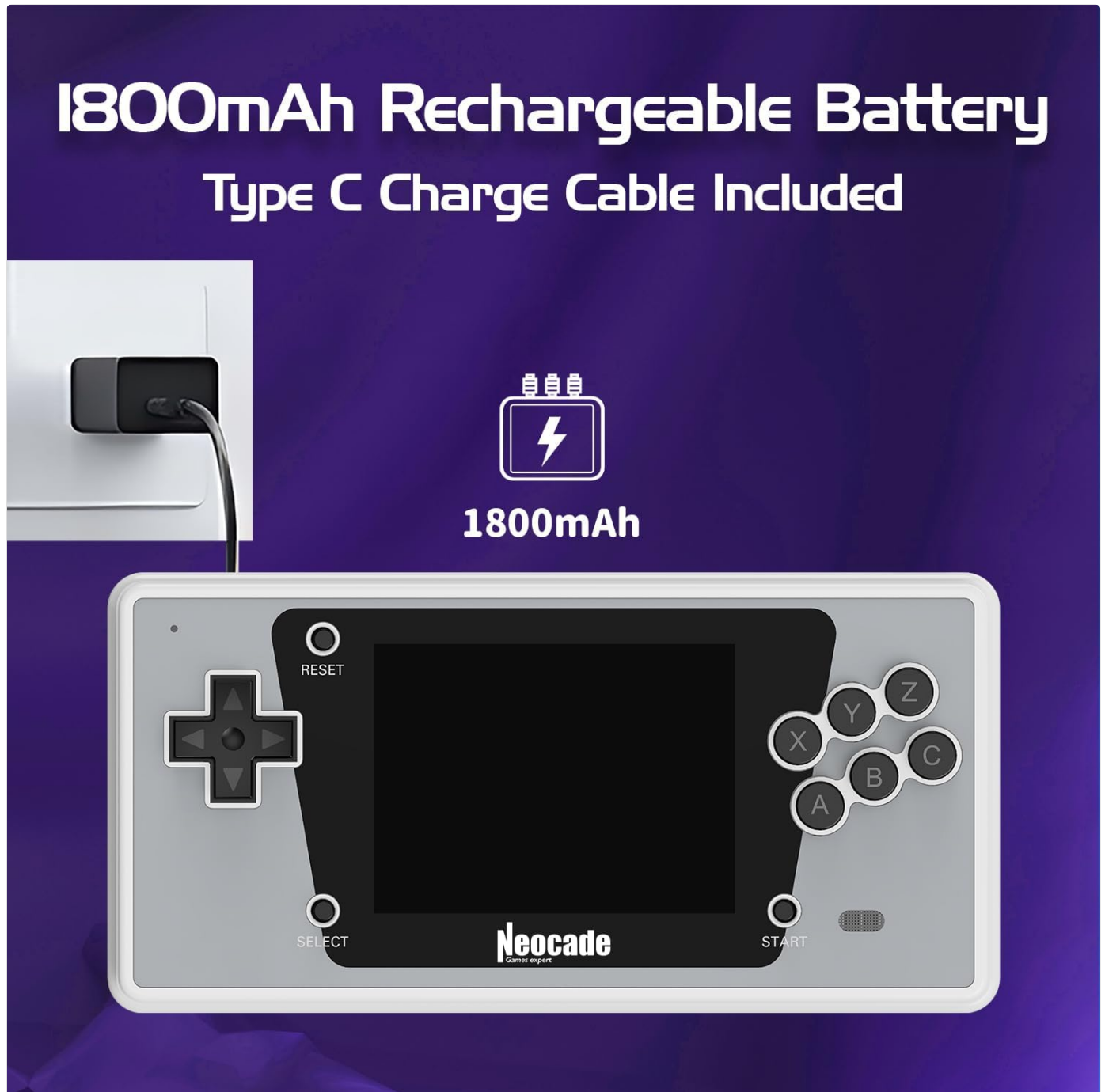
Image: The NEOCADE console being charged with a Type-C cable connected to a wall adapter, illustrating the charging process.