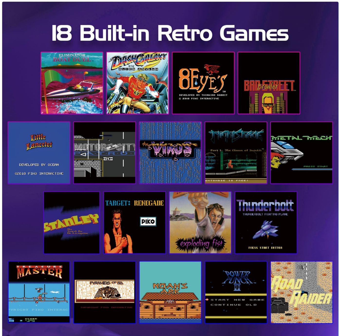
Image: A visual display of 18 different retro game titles, such as Eliminator Boat Duel, Dash Galaxy, 8 Eyes, and Bad Dudes, indicating the variety of built-in games.

The console comes pre-loaded with the following PIKO classical games: