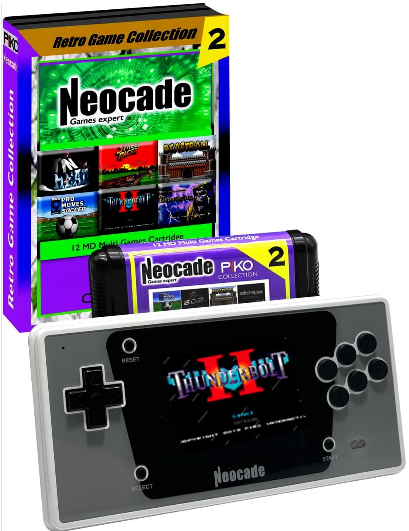
Image: The NEOCADE console with a 'Retro Game Collection 2' cartridge inserted, alongside the cartridge's box, demonstrating how a cartridge fits into the device.