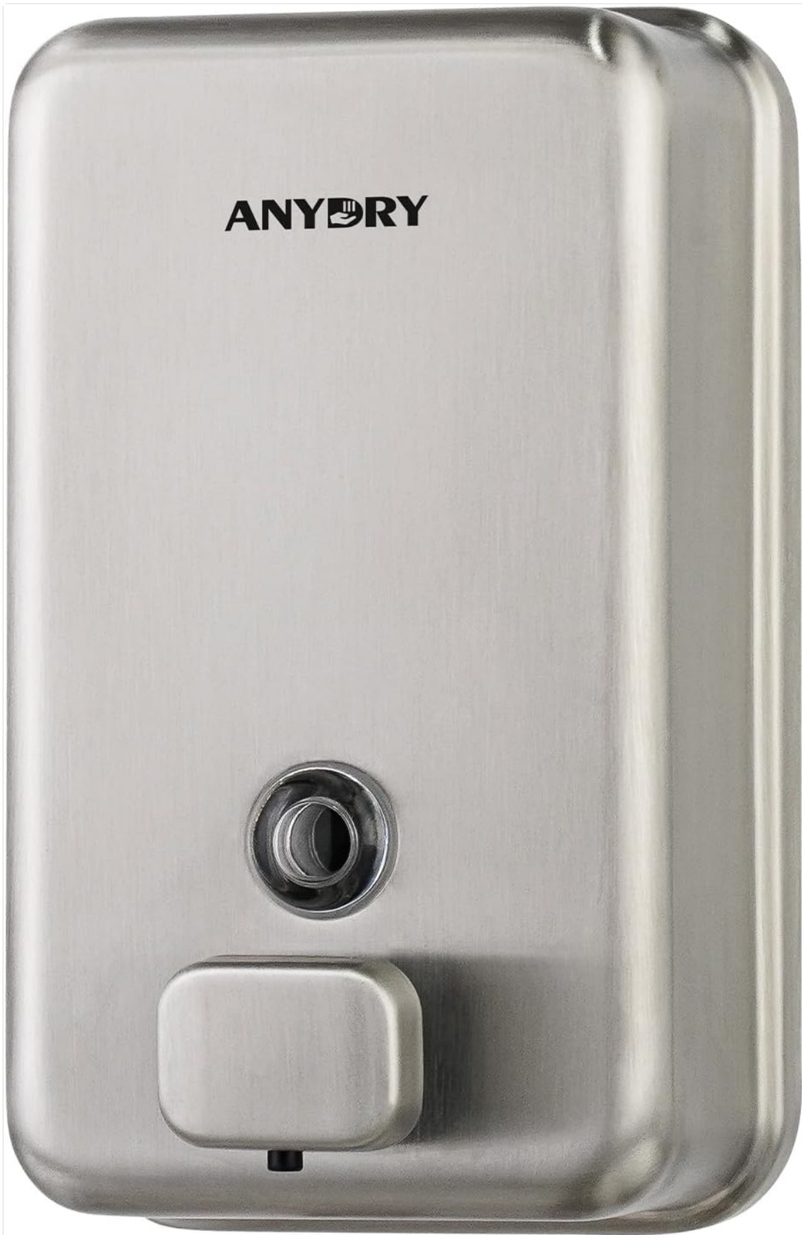
Image 1.1: Front view of the anydry Commercial Wall Mounted Soap Dispenser.