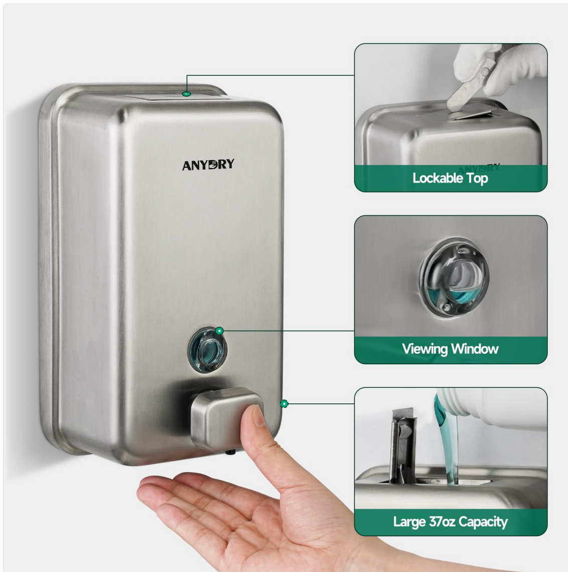
Image 4.4: Key features: lockable top, viewing window, and large capacity.