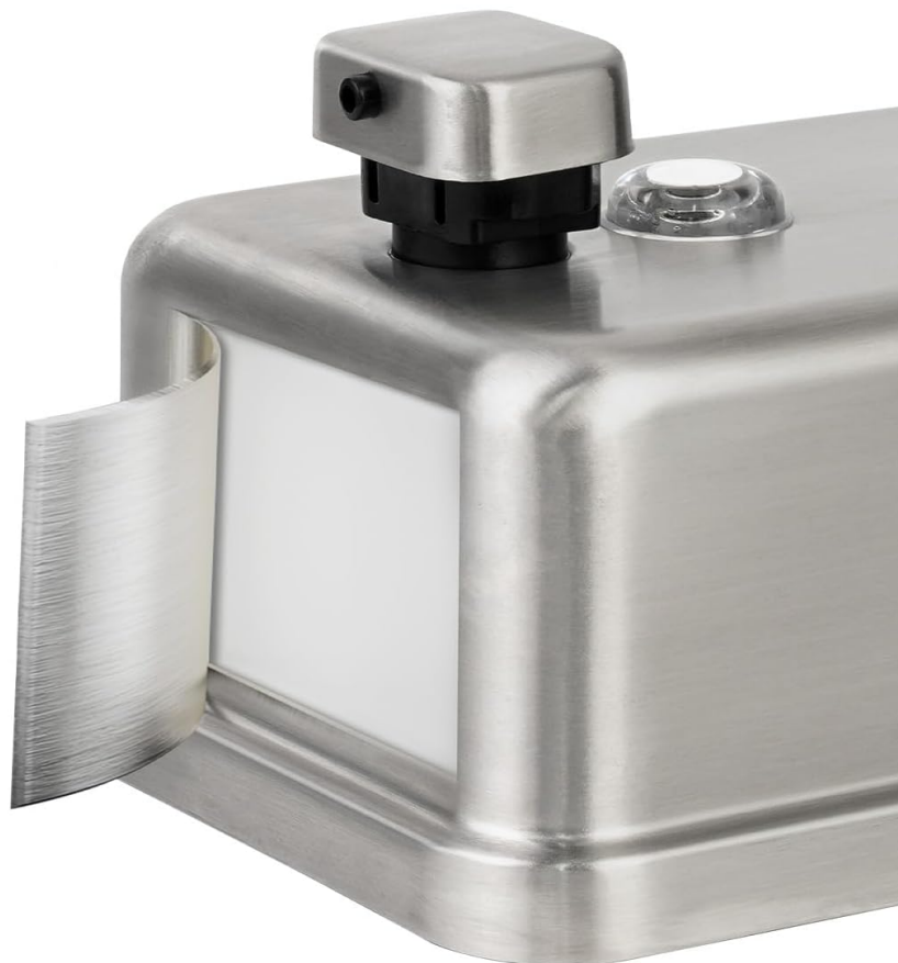
Image 4.1: Durable stainless steel shell and corrosion-proof liner.