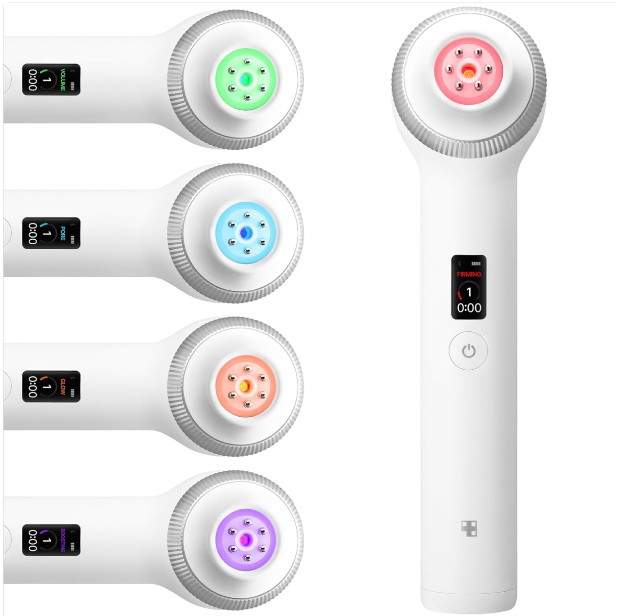
Image: The Medicube Age-R Ultra Tune 40.68 device, showcasing its sleek design and treatment head.