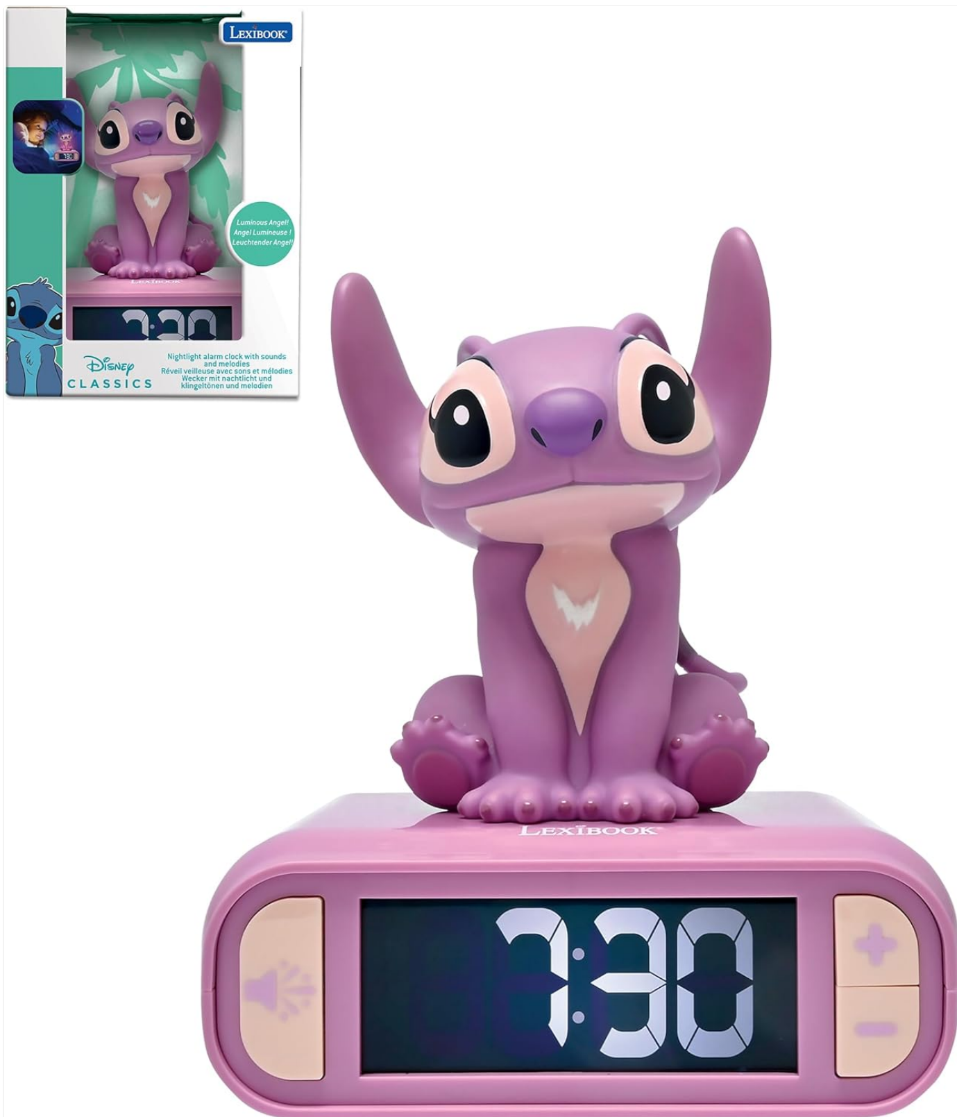
Image: The LEXIBOOK Disney Stitch Angel Night Light Alarm Clock, showing the product and its retail packaging.