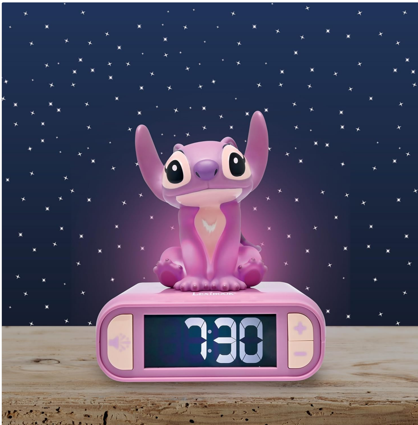
Image: The Angel nightlight alarm clock illuminating a dark room with subtle star projections.