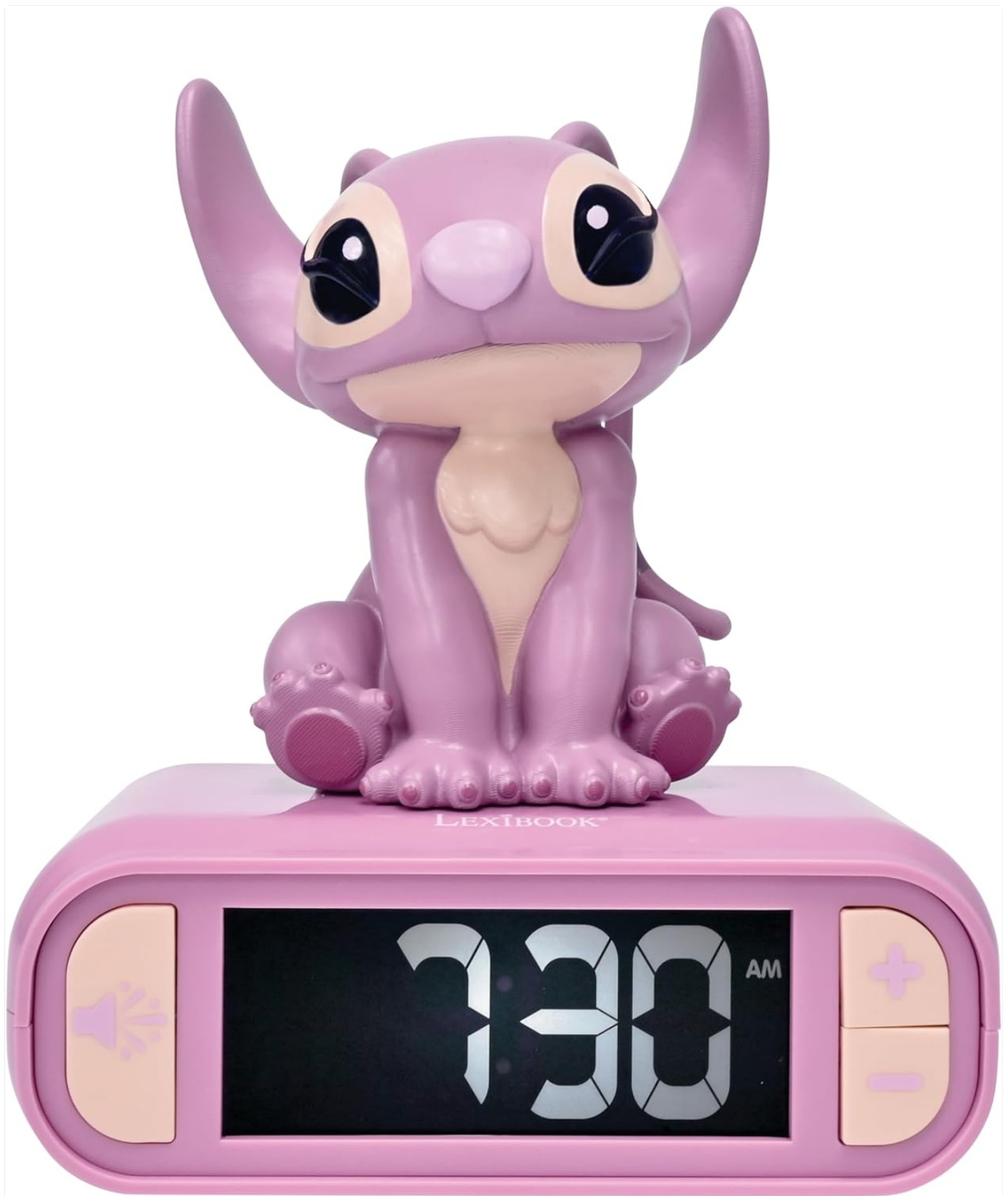
Image: Front view of the alarm clock, highlighting the LCD screen and control buttons.