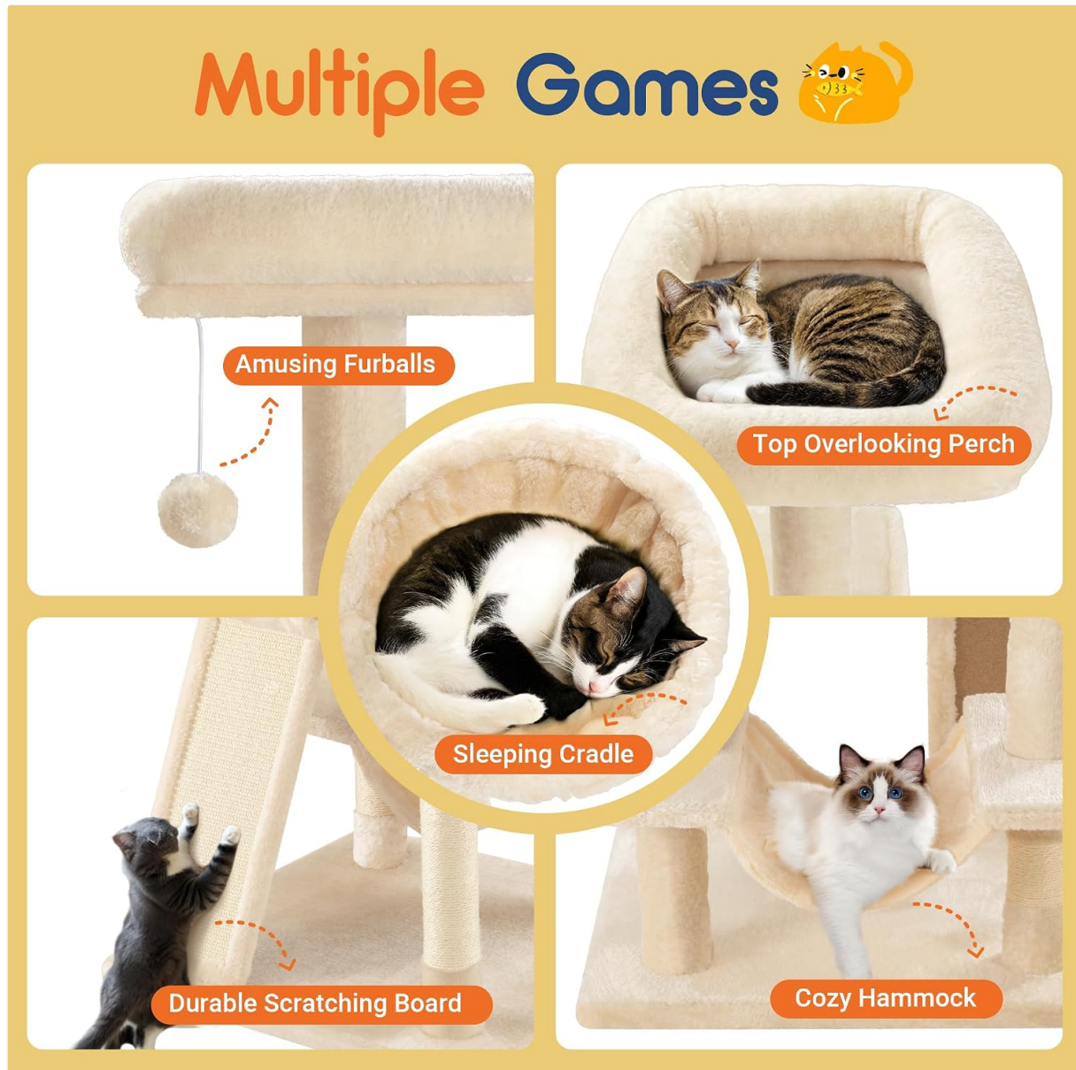
Image: Various activity zones on the cat tree.