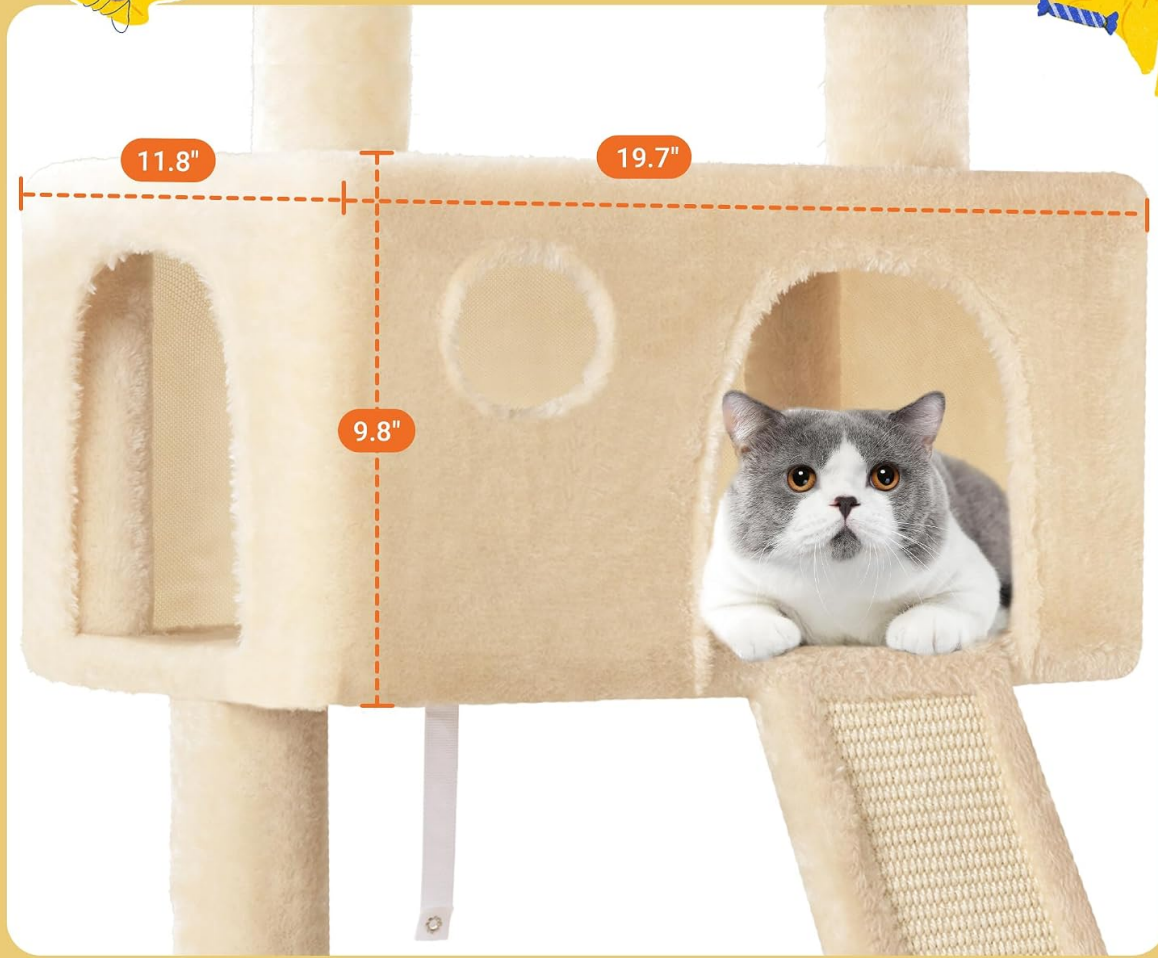
Image: Detail of two large cat condos.