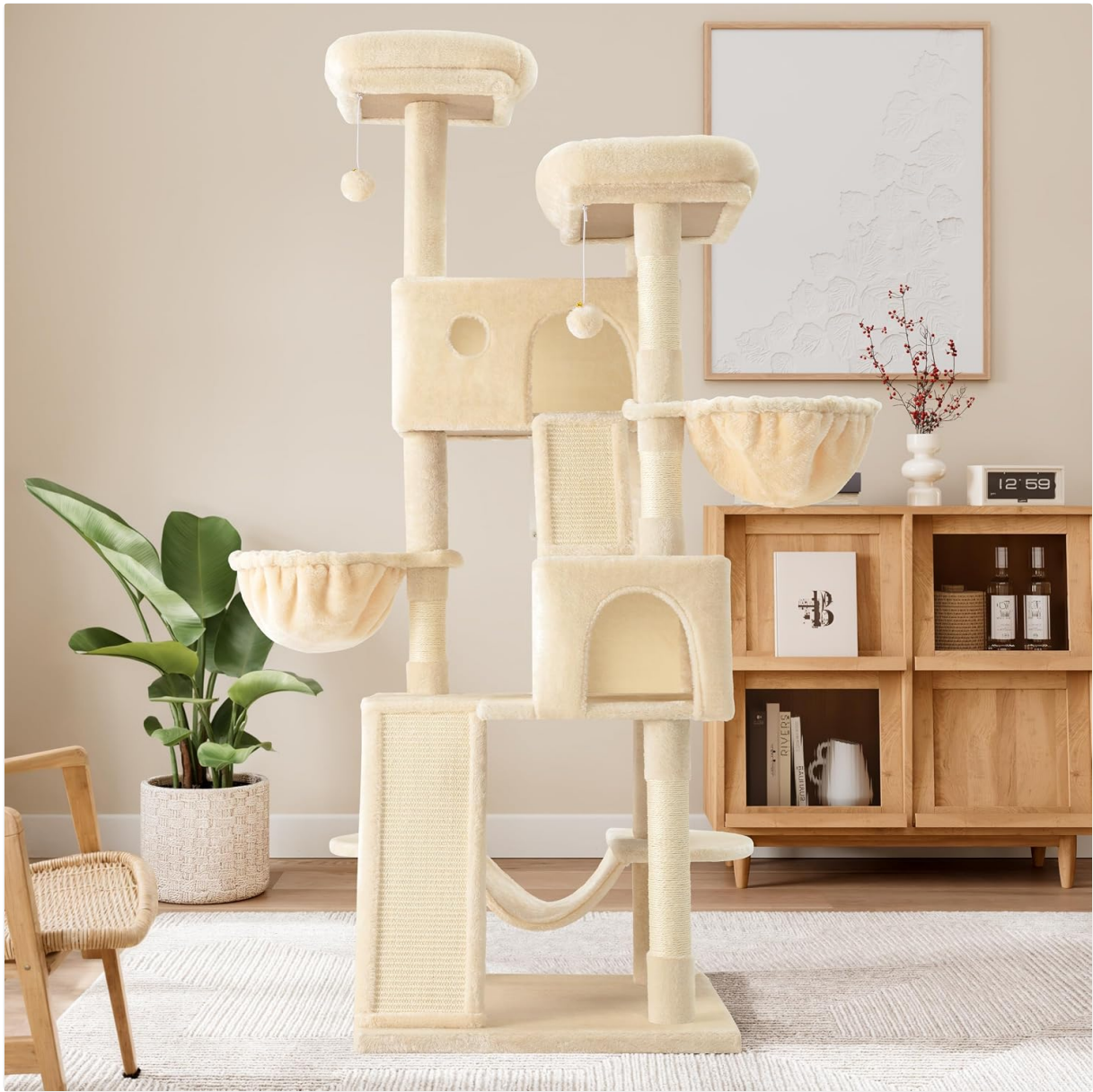
Image: Fully assembled Allewie 65-inch Multi-Level Tall Cat Tree.