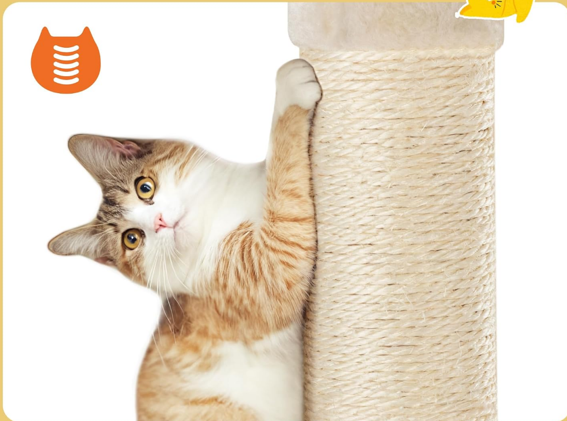
Image: Sisal scratching posts for nail health.