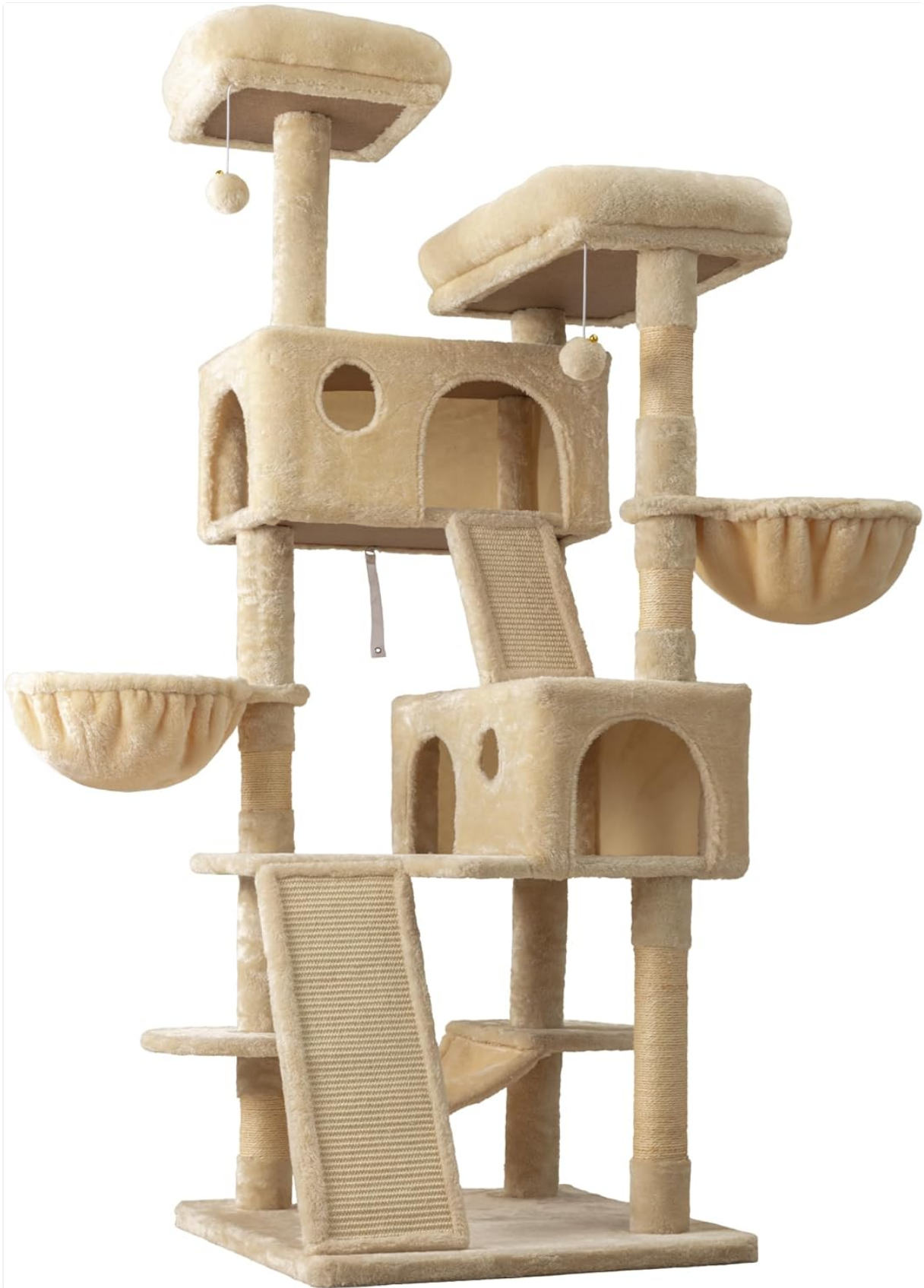
Image: Components of the cat tree during assembly.