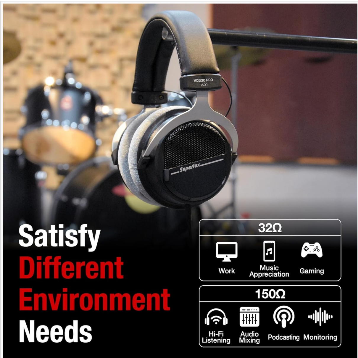
Figure 6: The headphones are suitable for diverse environments and needs, including professional and casual listening.

Video 1: Official product overview of the Superlux HD 330PRO Professional Semi-Open Wired Headphones.