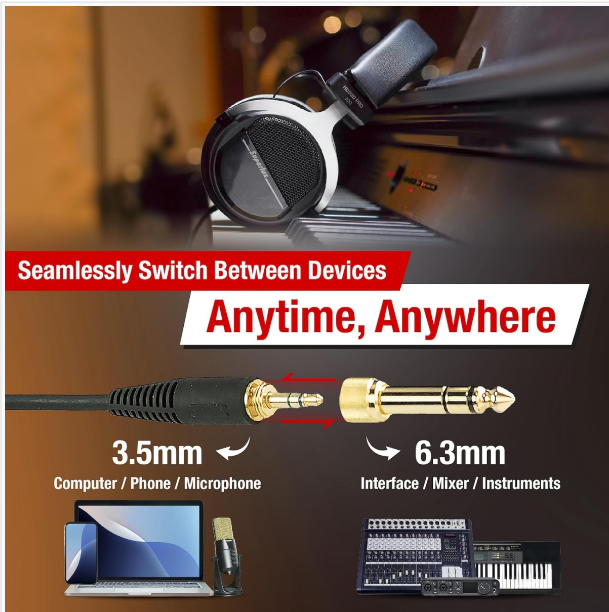
Figure 3: The 3.5mm plug and 6.3mm adapter for device compatibility.