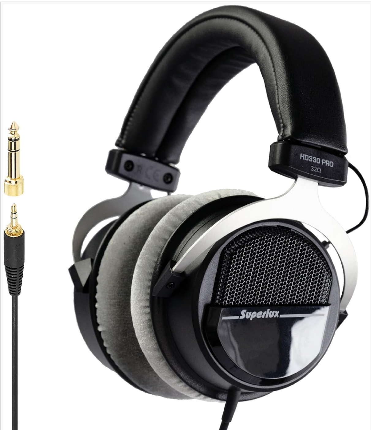
Figure 1: Superlux HD 330PRO headphones with included adapters.