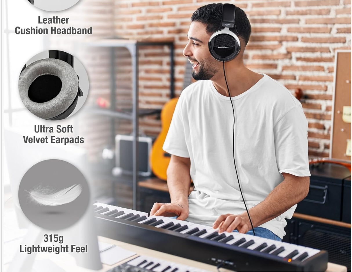
Figure 4: The adjustable leather headband and soft velvet earpads ensure comfort.