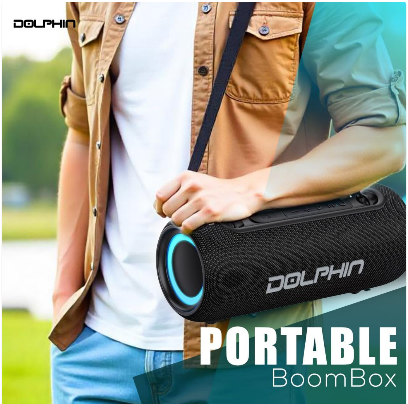
Figure 3: A person carrying the Dolphin LX-30 speaker using the detachable shoulder strap, demonstrating its portability for outdoor use.