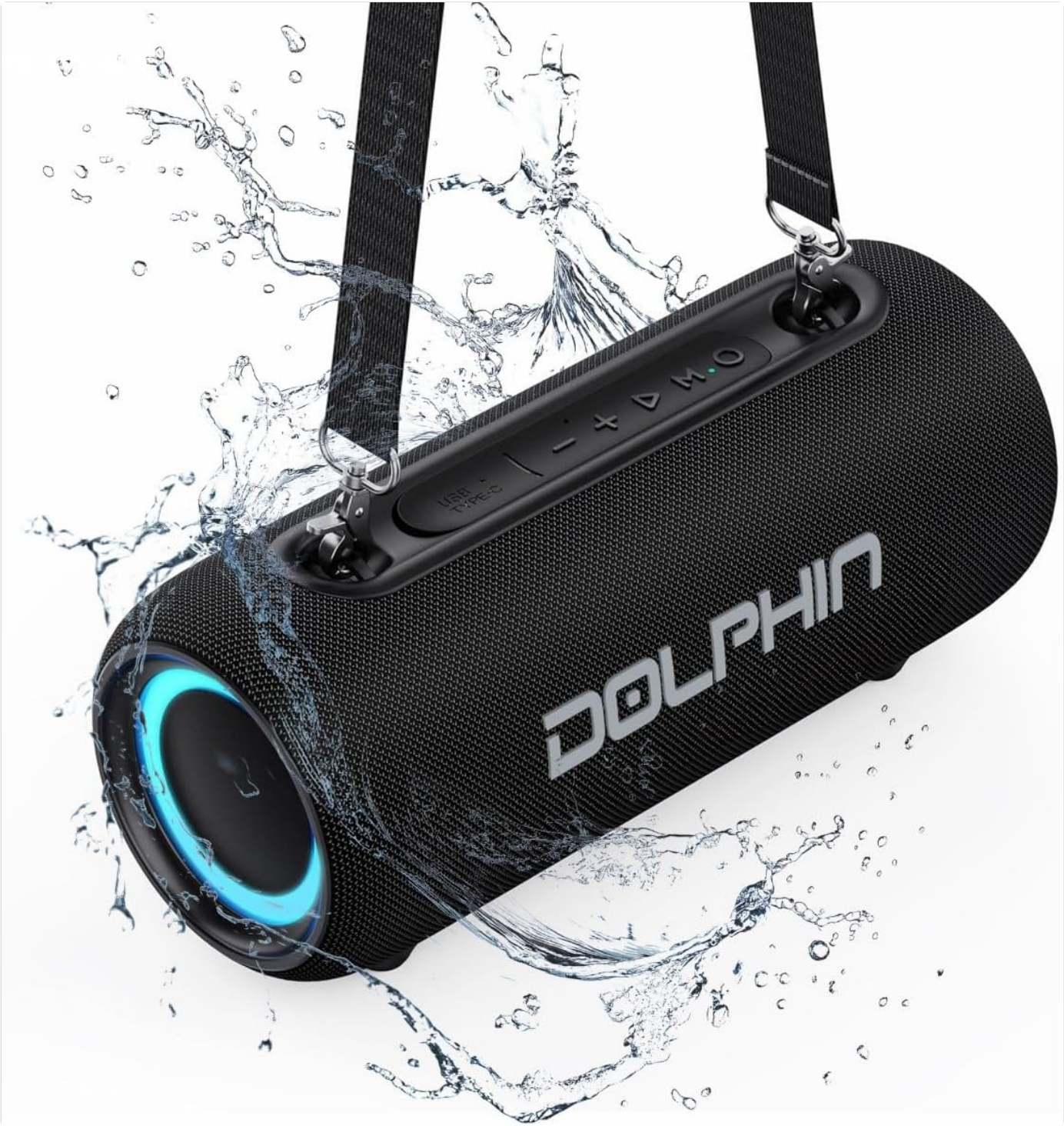
Figure 5: The Dolphin LX-30 speaker being splashed with water, illustrating its IPX5 water-resistant design, suitable for environments like pools or beaches.

The Dolphin LX-30 is rated IPX5, meaning it is protected against low-pressure water jets from any direction. This makes it suitable for use in environments where it might encounter splashes, such as by a pool, at the beach, or in a shower.