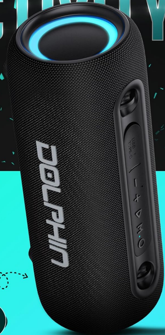
Figure 1: Top view of the Dolphin LX-30 speaker, highlighting the control buttons and USB-C charging port. The image also indicates features like volume controls, Micro SD card slot, Bluetooth 5.0, and a 3.5mm jack, along with the Type-C charging port and 40Hz frequency response.

The Dolphin LX-30 features an intuitive control panel located on the top surface. Key controls include: