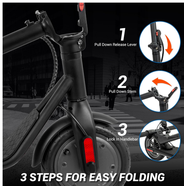
Figure 2: The scooter features a 3-step folding mechanism: 1. Pull down release lever, 2. Pull down stem, 3. Lock in handlebar.