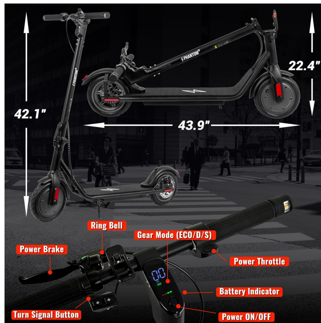
Figure 1: Overview of Phantomgogo Electric Scooter components and dimensions (42.1" height, 43.9" length, 22.4" folded height).