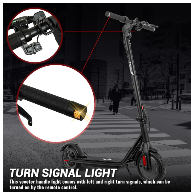
Figure 4: The scooter features integrated turn signal lights on the handlebars for enhanced visibility.