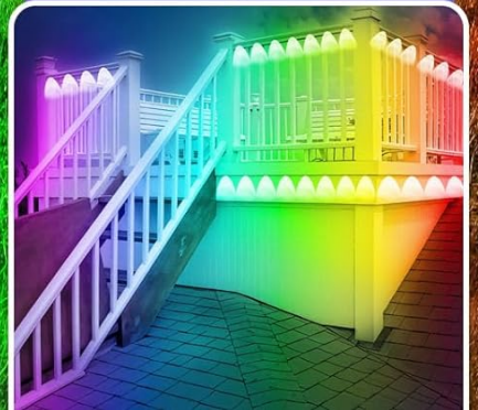
Image: Example installation on eaves, stairs, and stairway railing.