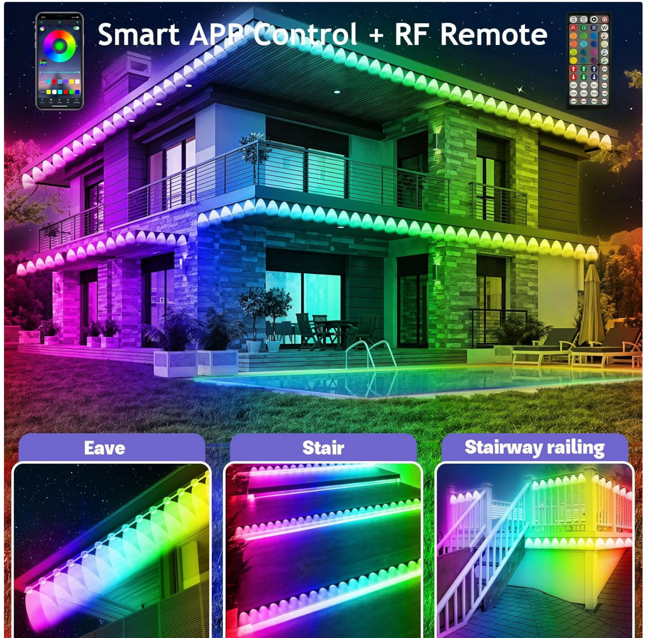
Image: Smart App Control and Remote.