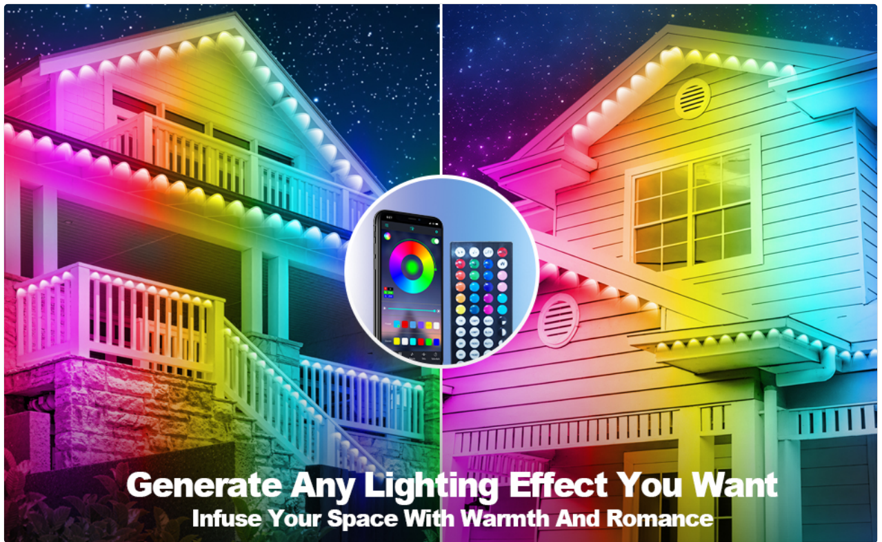
Image: App control with built-in microphone for music sync.