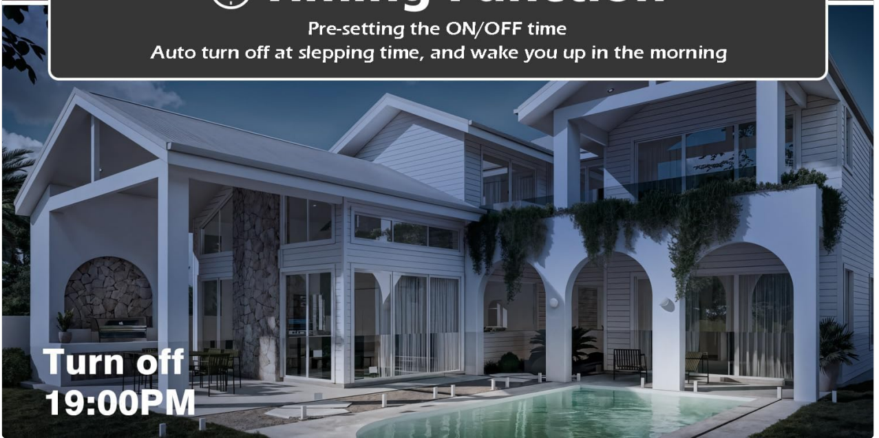
Image: Timing Function for automatic operation.