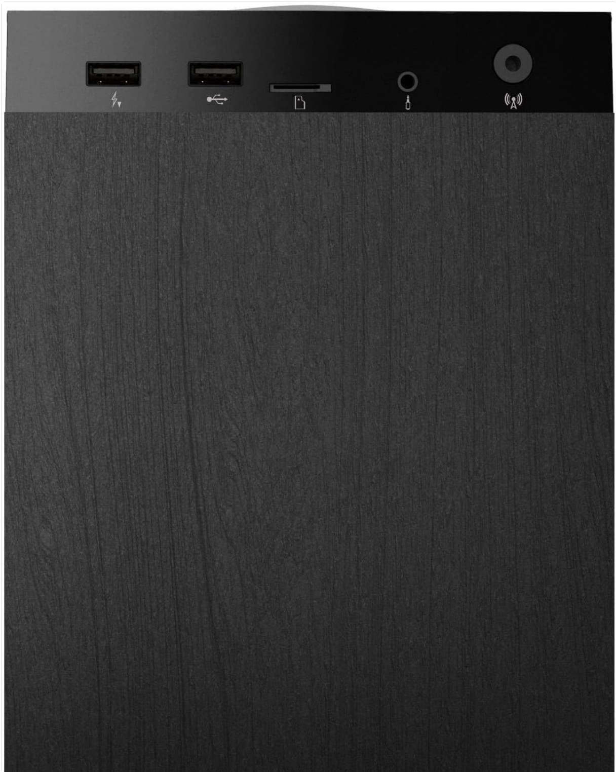
Image 1.1: Front view of the Energy Sistem Tower 5 MAX with the remote control.