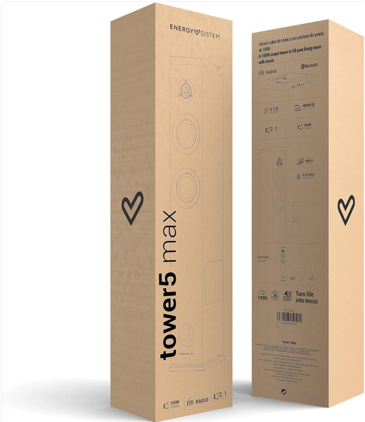
Image 2.1: Product packaging illustrating included items and features.