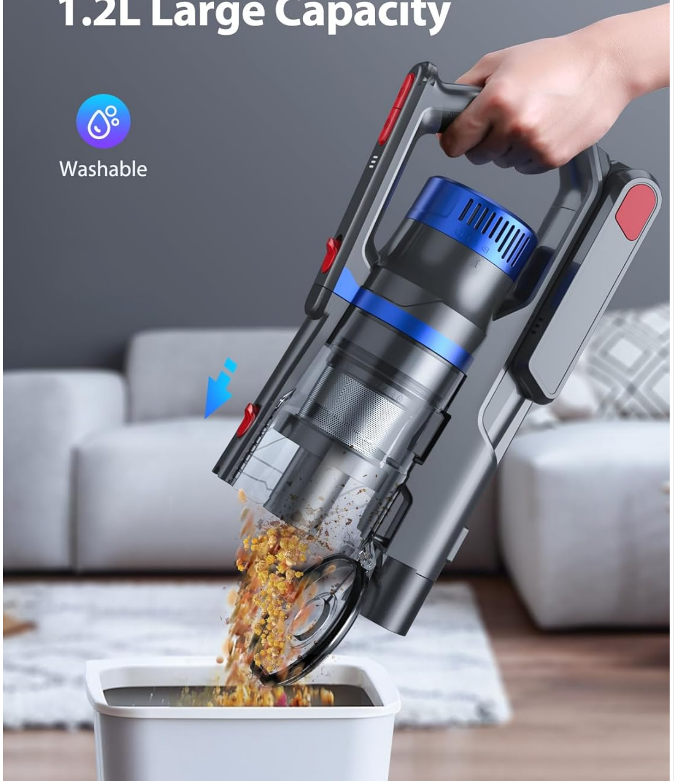
Image 5.1: Demonstration of the one-touch emptying mechanism for the 1.2L large capacity dust cup of the BuTure VAC JR500, showing collected debris being released into a waste bin.