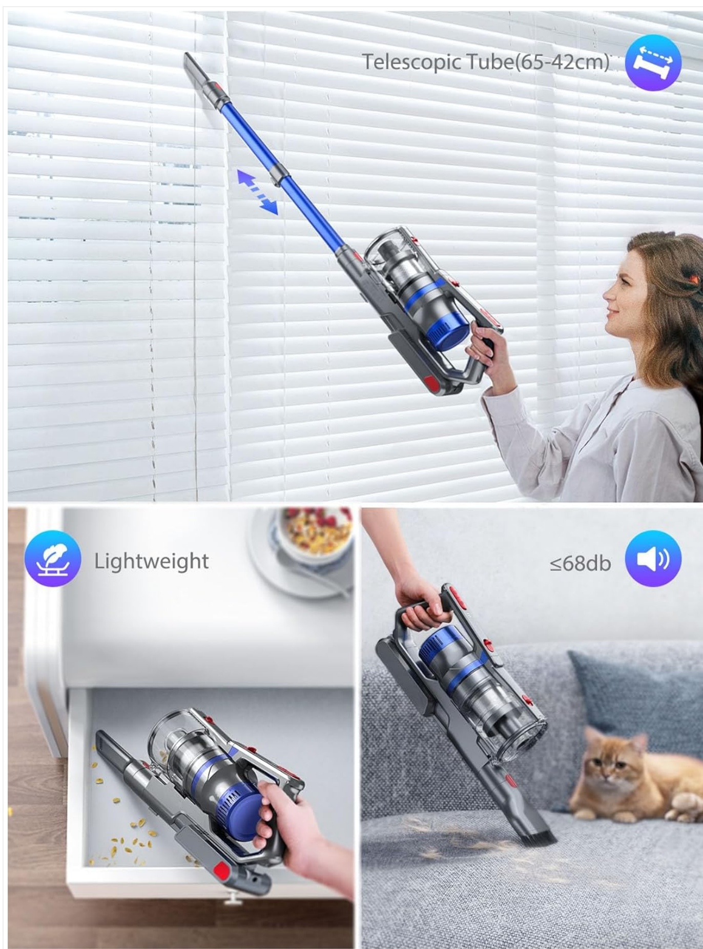
Image 4.1: The BuTure VAC JR500 in various operational modes, demonstrating the adjustable telescopic tube for high-reach cleaning and its lightweight design for handheld use on furniture.