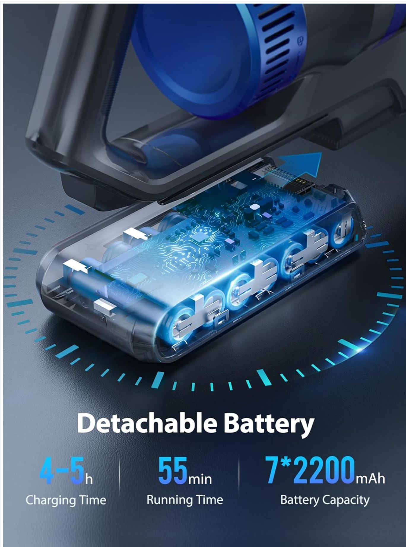
Image 3.1: Illustration of the detachable battery for the BuTure VAC JR500, highlighting its charging time, running time, and capacity.