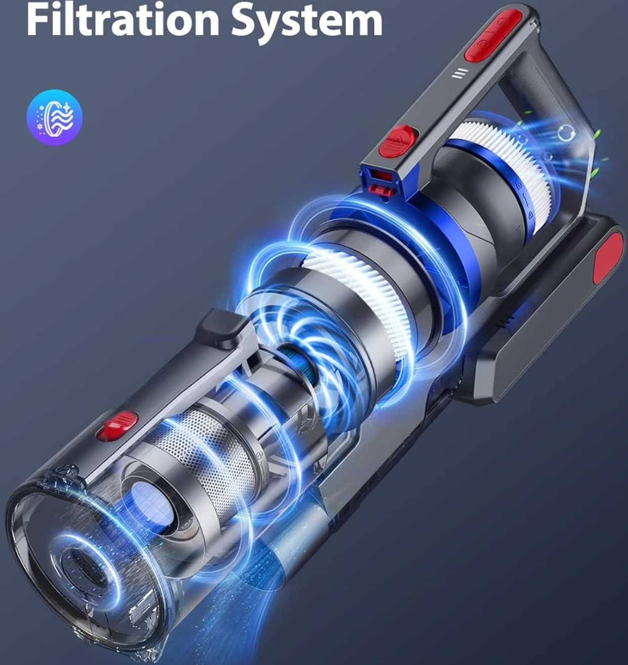
Image 5.2: An internal view illustrating the 6-stage cyclonic filtration system of the BuTure VAC JR500, showing the airflow and separation of dust particles.