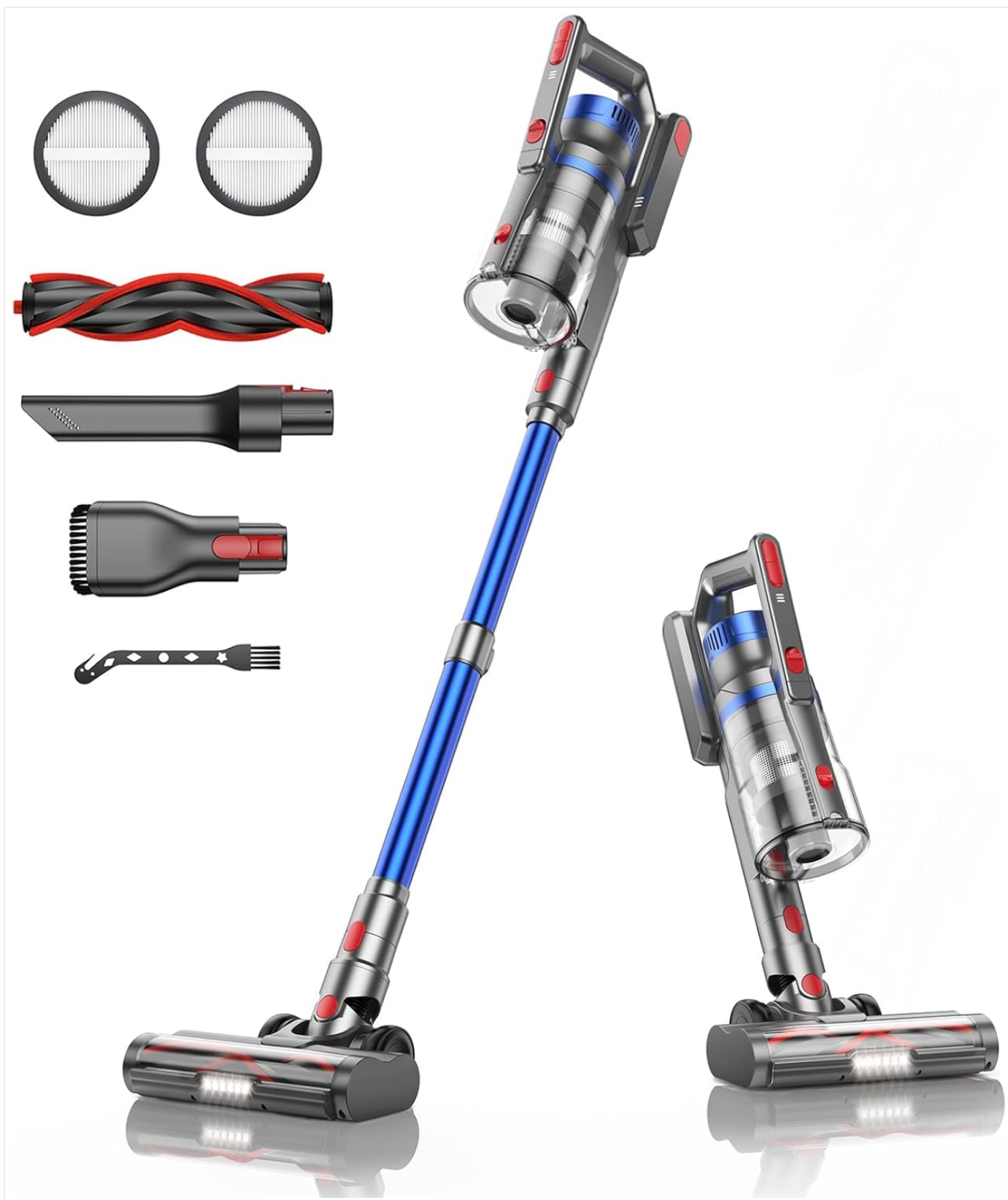
Image 2.1: Overview of the BuTure VAC JR500 Cordless Vacuum Cleaner and its included accessories. This image displays the main vacuum body, telescopic tube, electric floor brush, two HEPA filters, soft bristle brush, crevice brush, battery, charger, small cleaning tool, and wall mount stand.