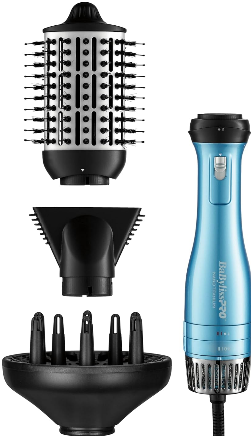
Image: All components of the BaBylissPRO Nano Titanium Hot Air Styler.