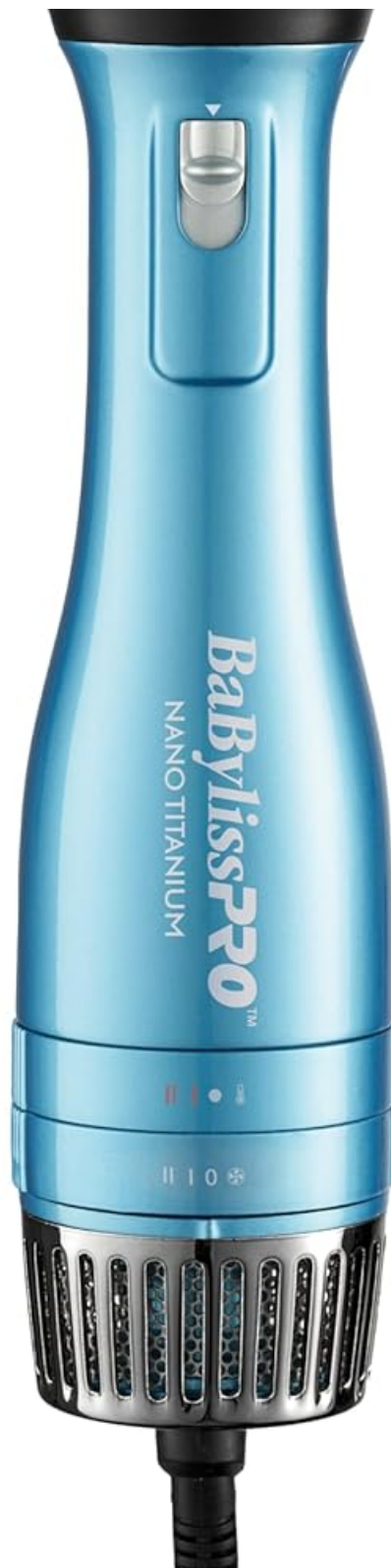
Image: Diffuser attachment connected to the main unit.