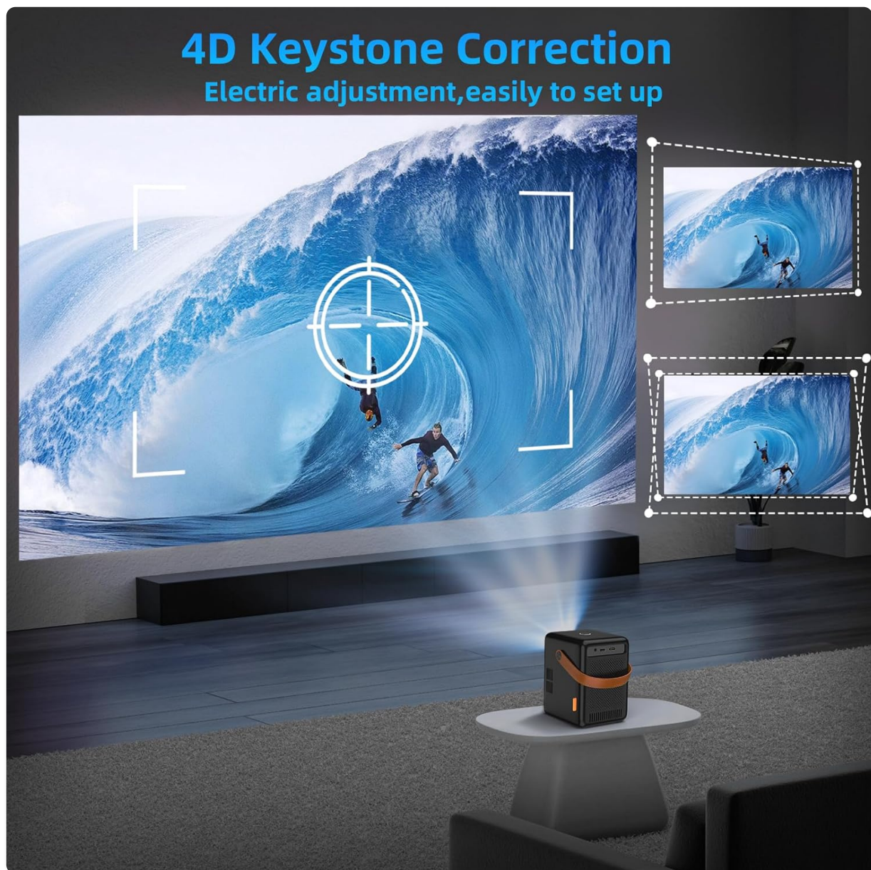
Figure 2: Illustrates the 4D Keystone Correction feature, allowing for flexible image adjustment from various angles.