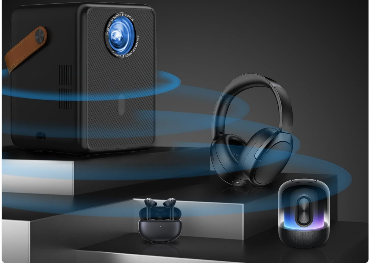
Figure 5: Illustration of the upgraded Bluetooth 5.2 function, allowing seamless connection to external audio devices.

Bluetooth 5.2, longer transmission distance and faster transmission speed.