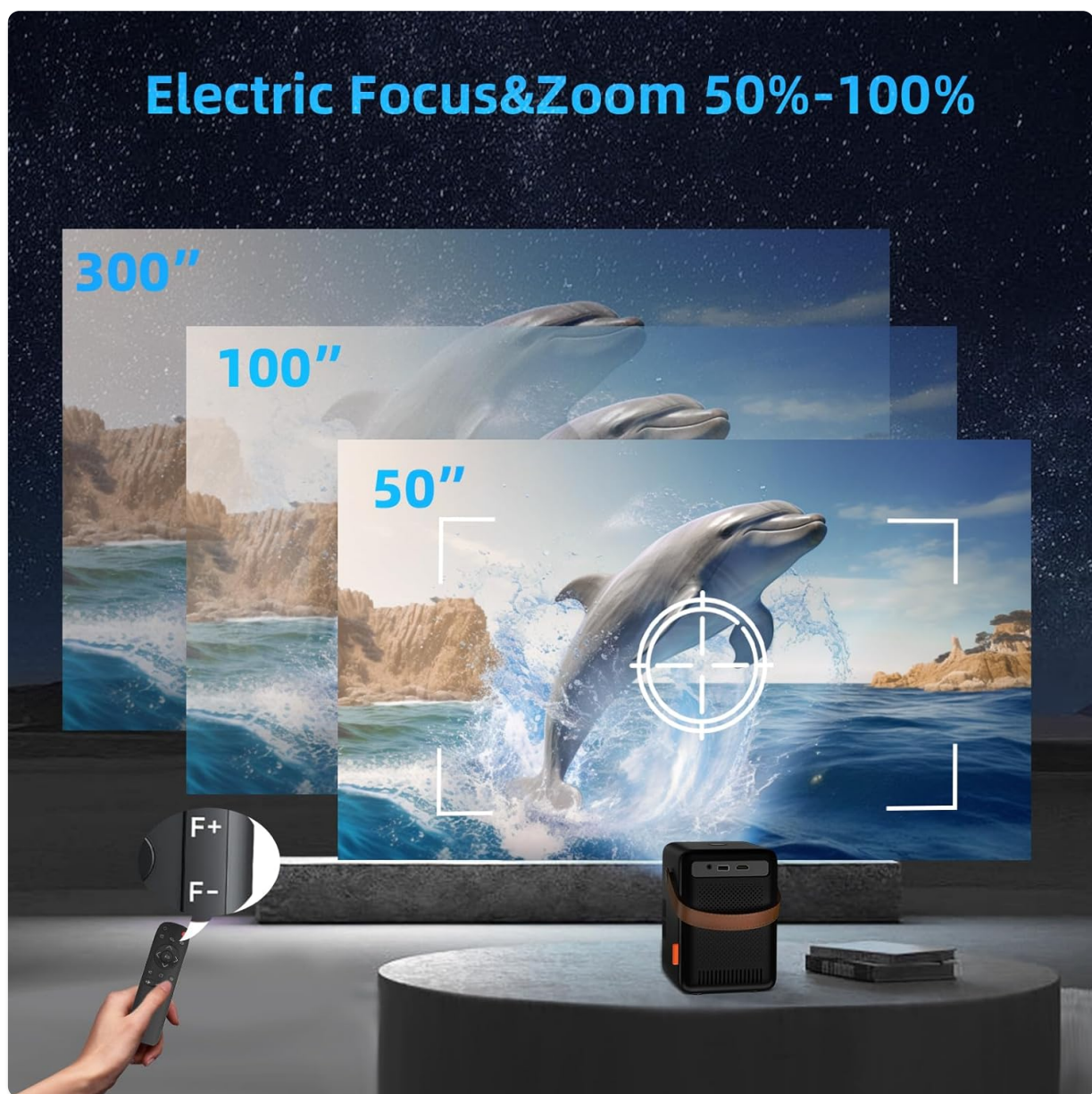
Figure 3: Demonstrates the electric focus and 50%-100% zoom capabilities, enabling precise image sizing and clarity.