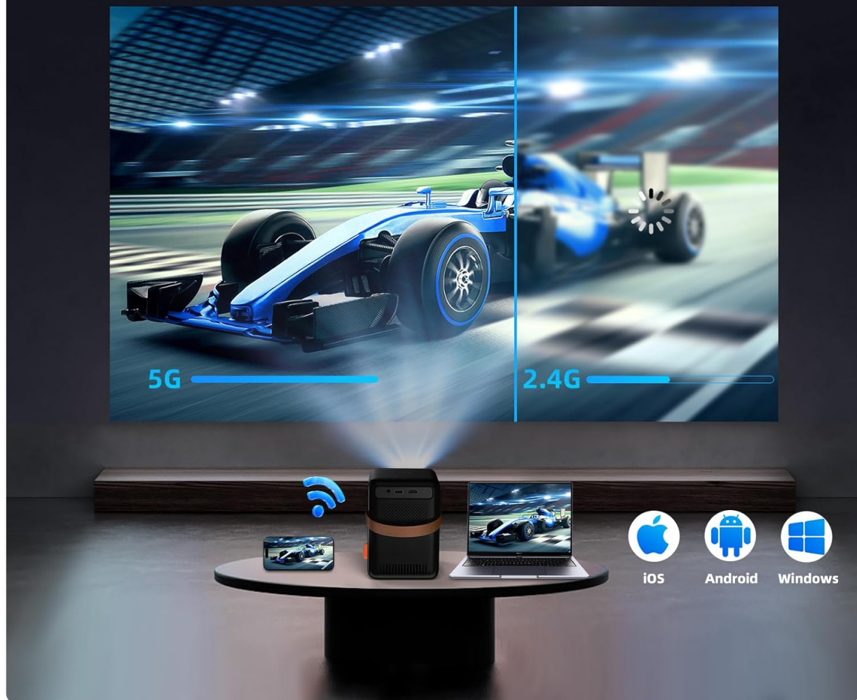
Figure 6: Demonstrates wireless screencasting from various devices (iOS, Android, Windows) using 5G+2.4 WiFi.