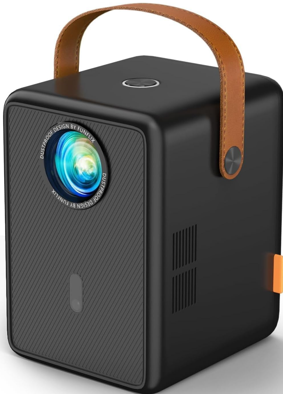
Figure 1: FunFlix G1 Mini Projector. This compact device features a sleek design with a leather handle for easy portability.