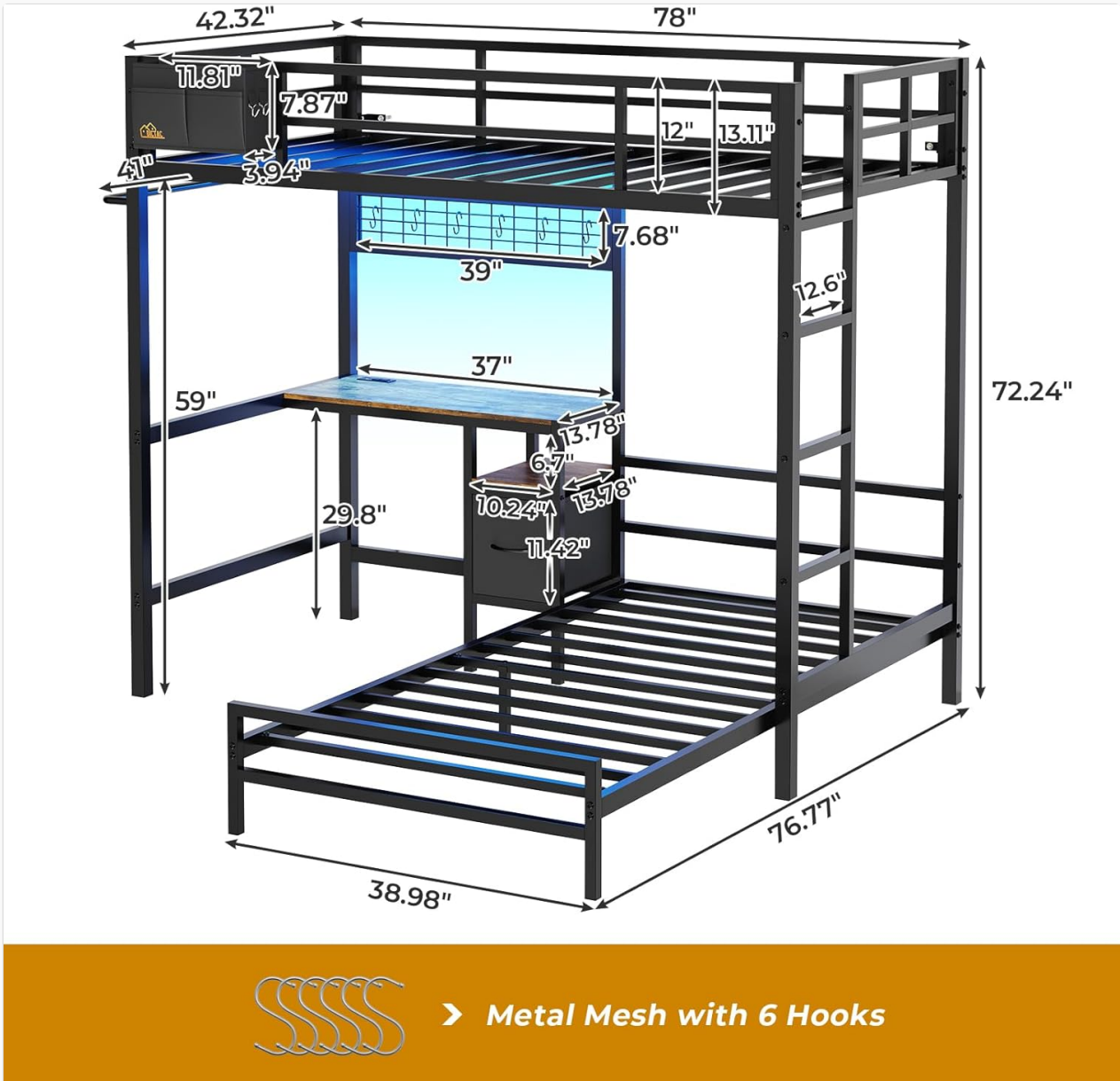
Figure 3.1: Product Dimensions and Components Overview

Refer to the diagram for an overview of the bed's dimensions and key components: