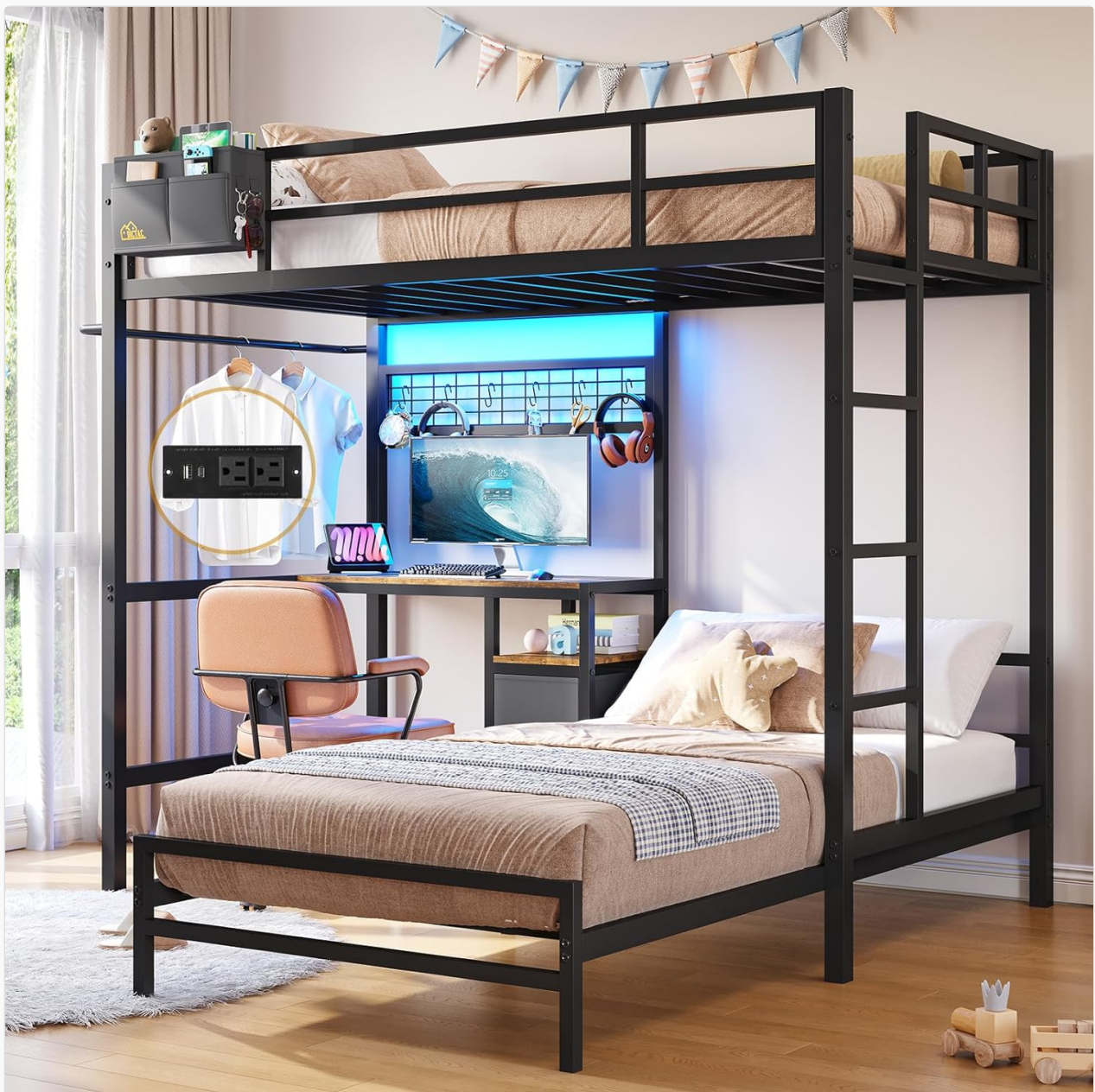
Figure 4.1: Assembled Bunk Bed