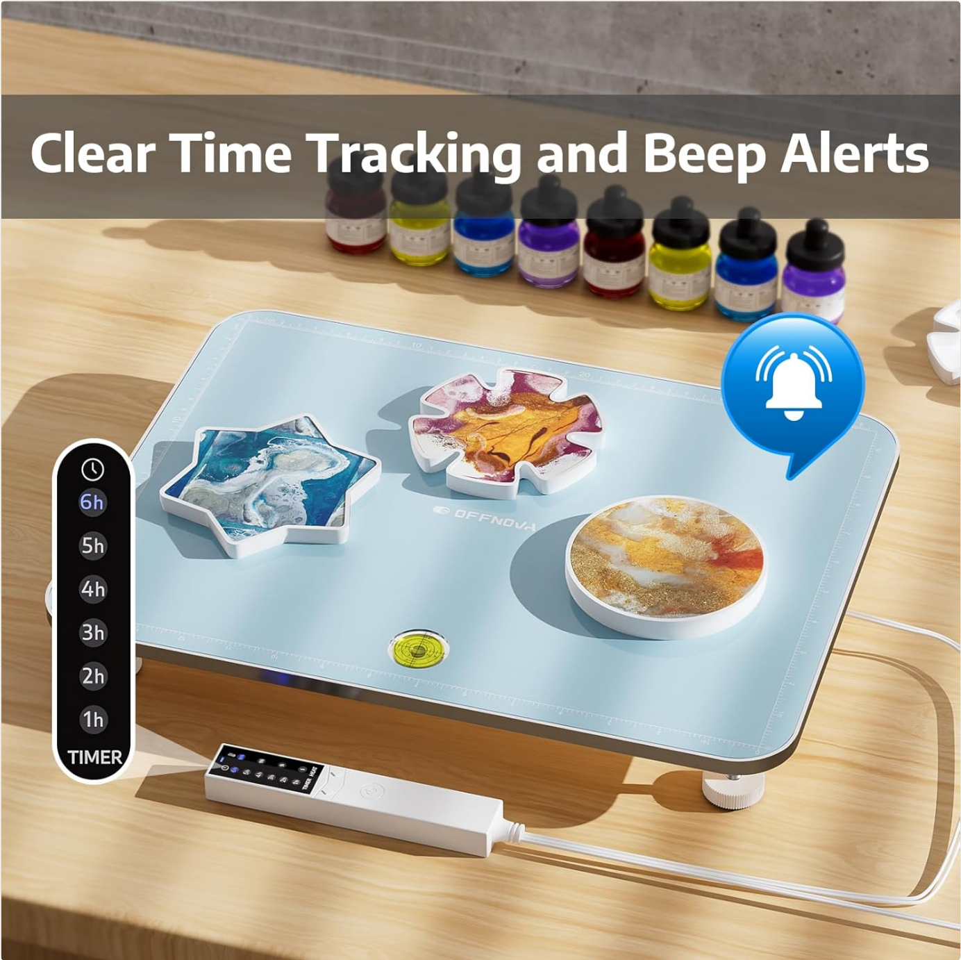
Image: The OFFNOVA heating mat in use, with the remote control displaying active timer settings and a visual representation of the alert system.

Image: A comprehensive diagram of the OFFNOVA remote controller, detailing all buttons and indicators for temperature and timer settings.