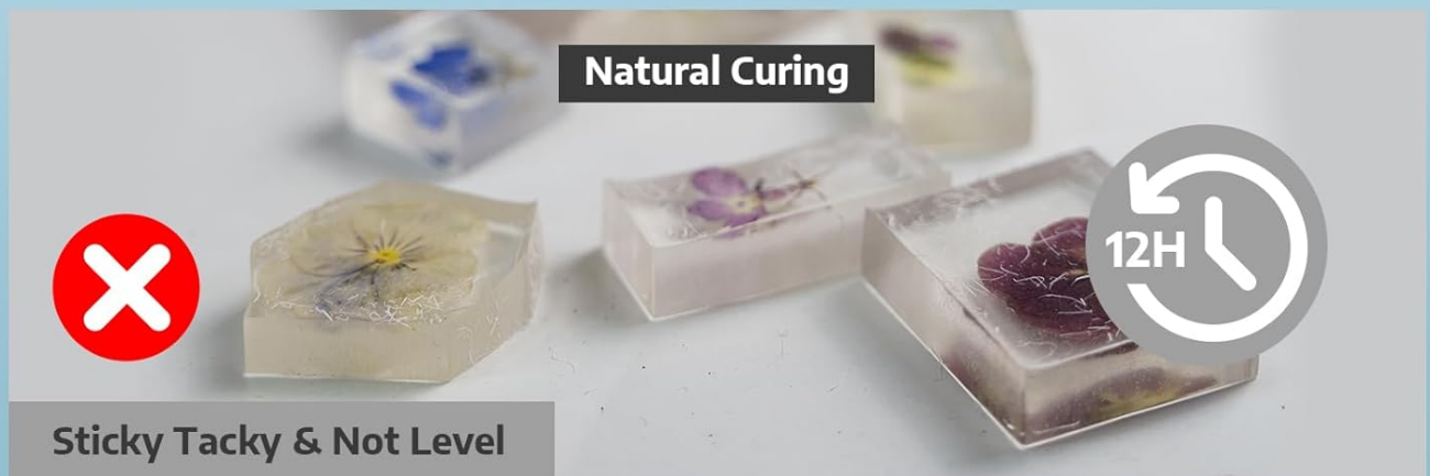
Image: A visual comparison demonstrating the significantly faster and more complete curing achieved with the OFFNOVA Resin Heating Leveling Board (2 hours) compared to natural curing (12 hours).