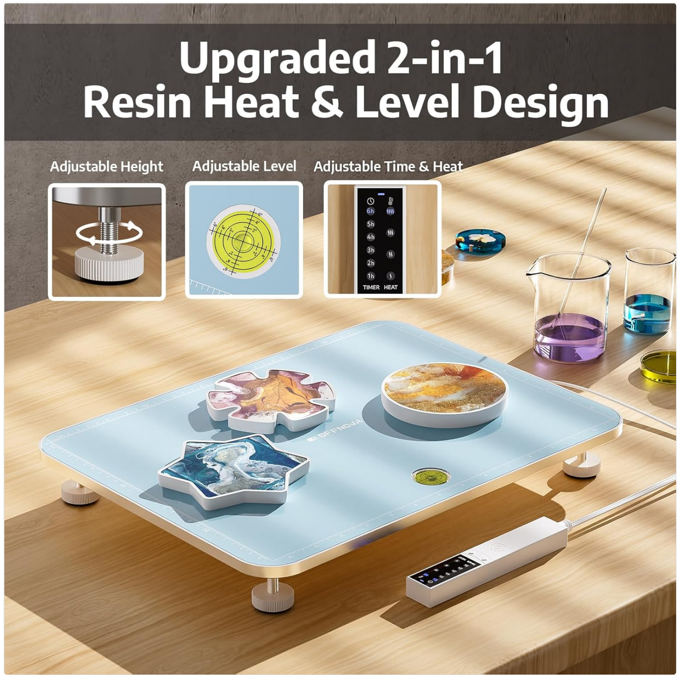
Image: The OFFNOVA 2-in-1 Resin Heating Mat and Leveling Table highlighting its adjustable height, built-in level, and control panel for time and heat settings.

an even surface, preventing uneven curing. The heating function efficiently cures resin, typically within 2-3 hours, for professional results.