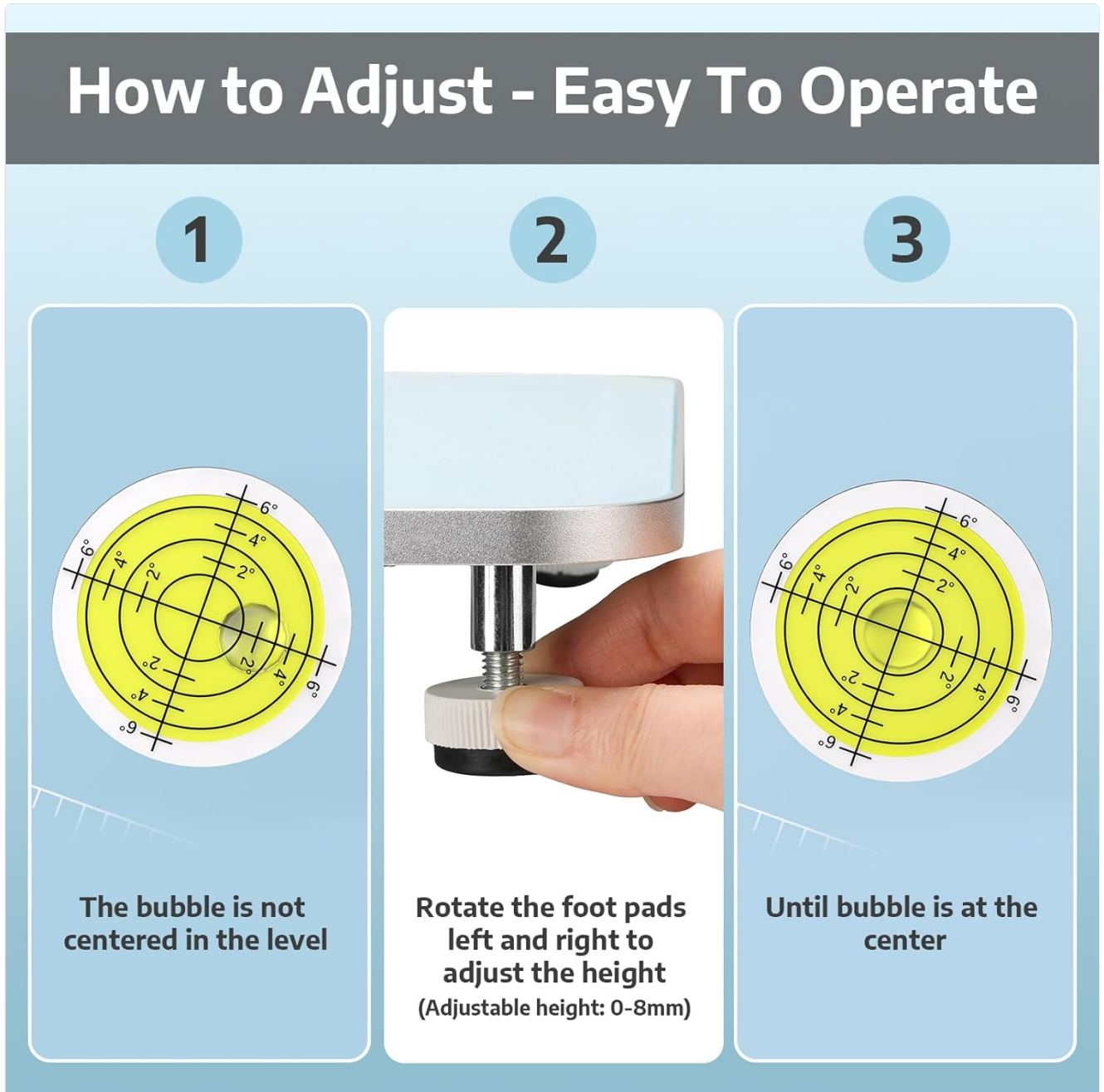
Image: A visual guide demonstrating the process of adjusting the leveling feet to achieve a perfectly horizontal surface, indicated by the centered bubble in the built-in level.