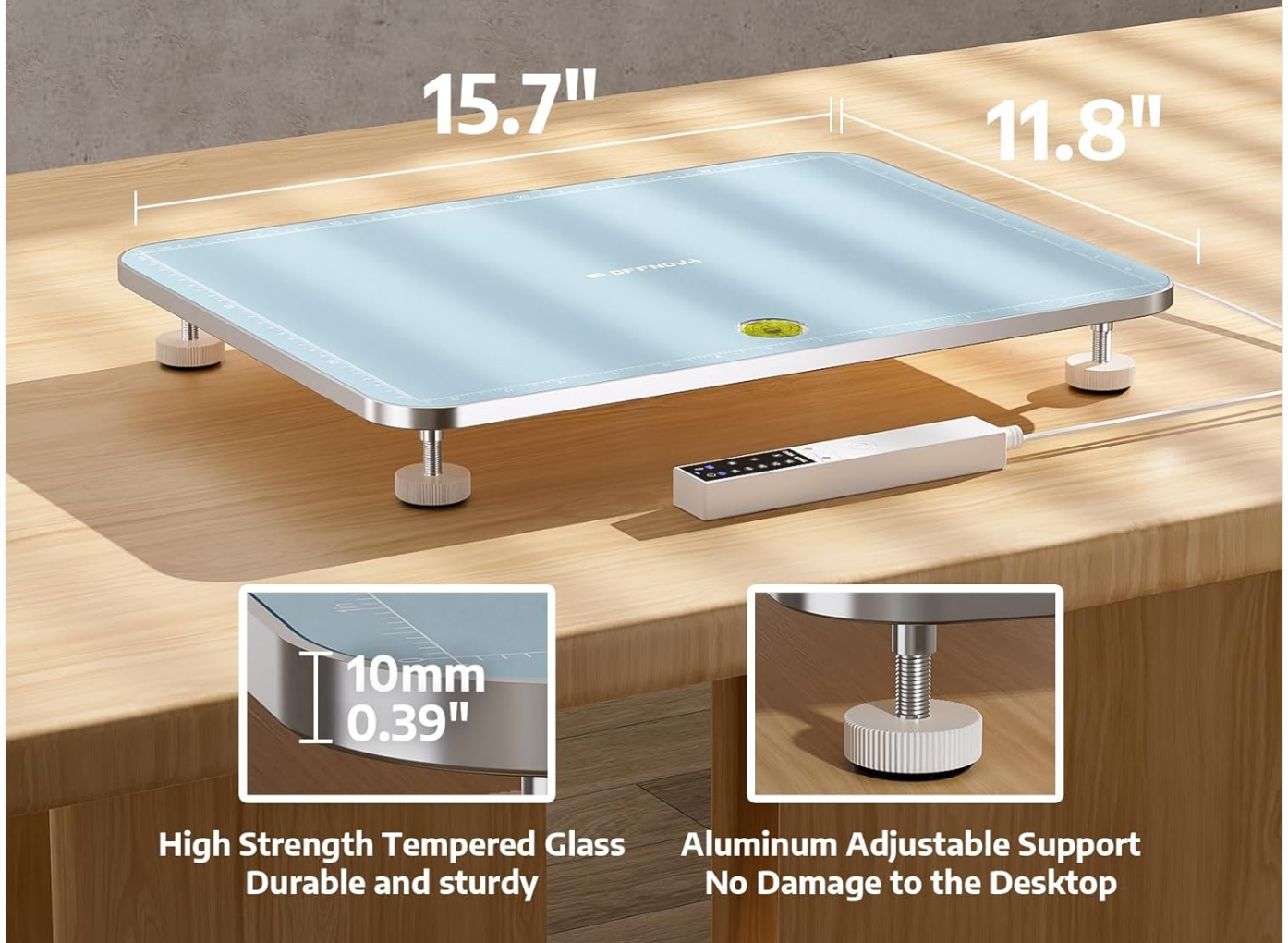
Image: The OFFNOVA heating mat displaying its overall dimensions and the thickness of its high-strength tempered glass surface.